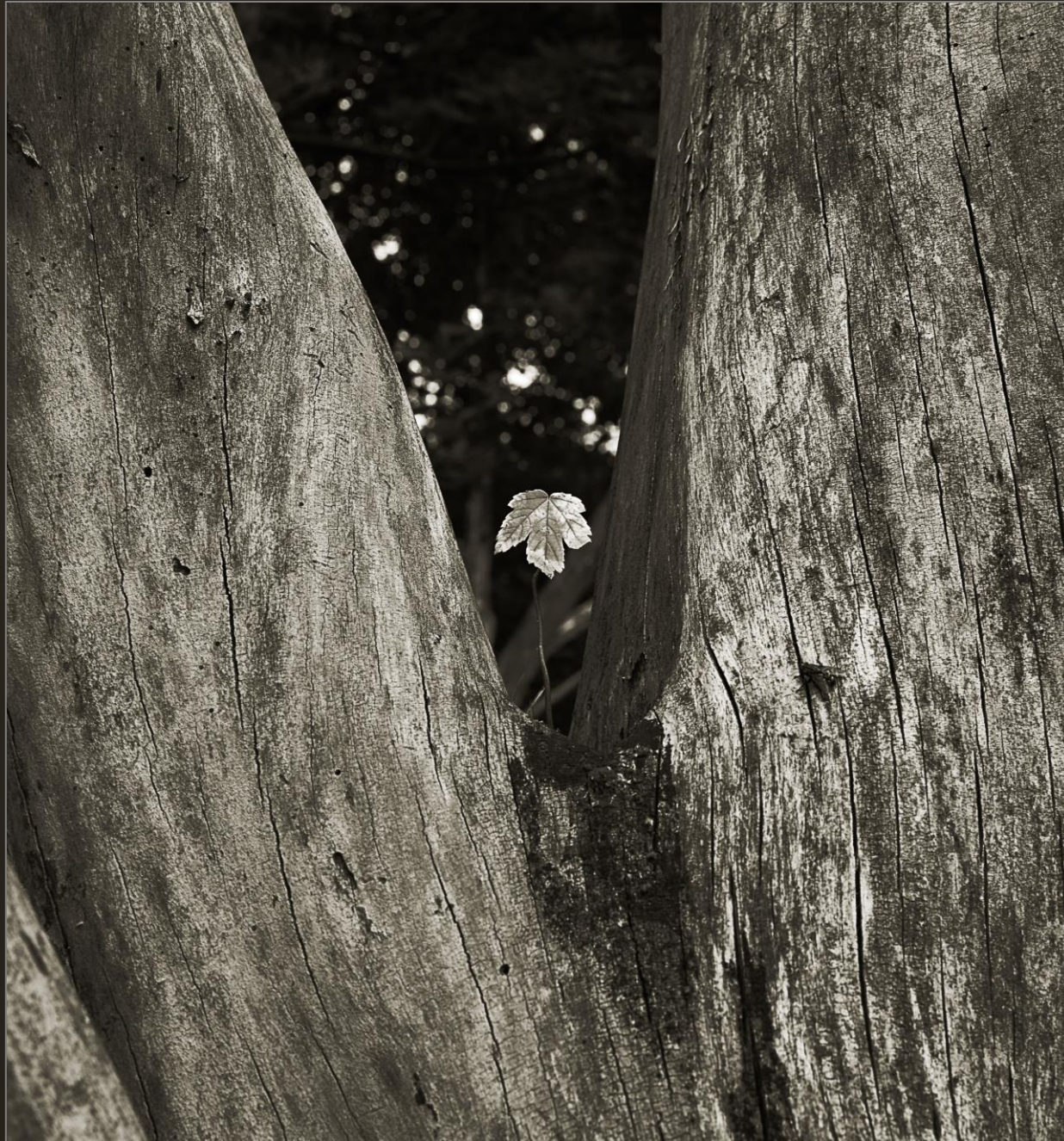
Sprouting life, Kongerslev Præstegårdshede, July 2008