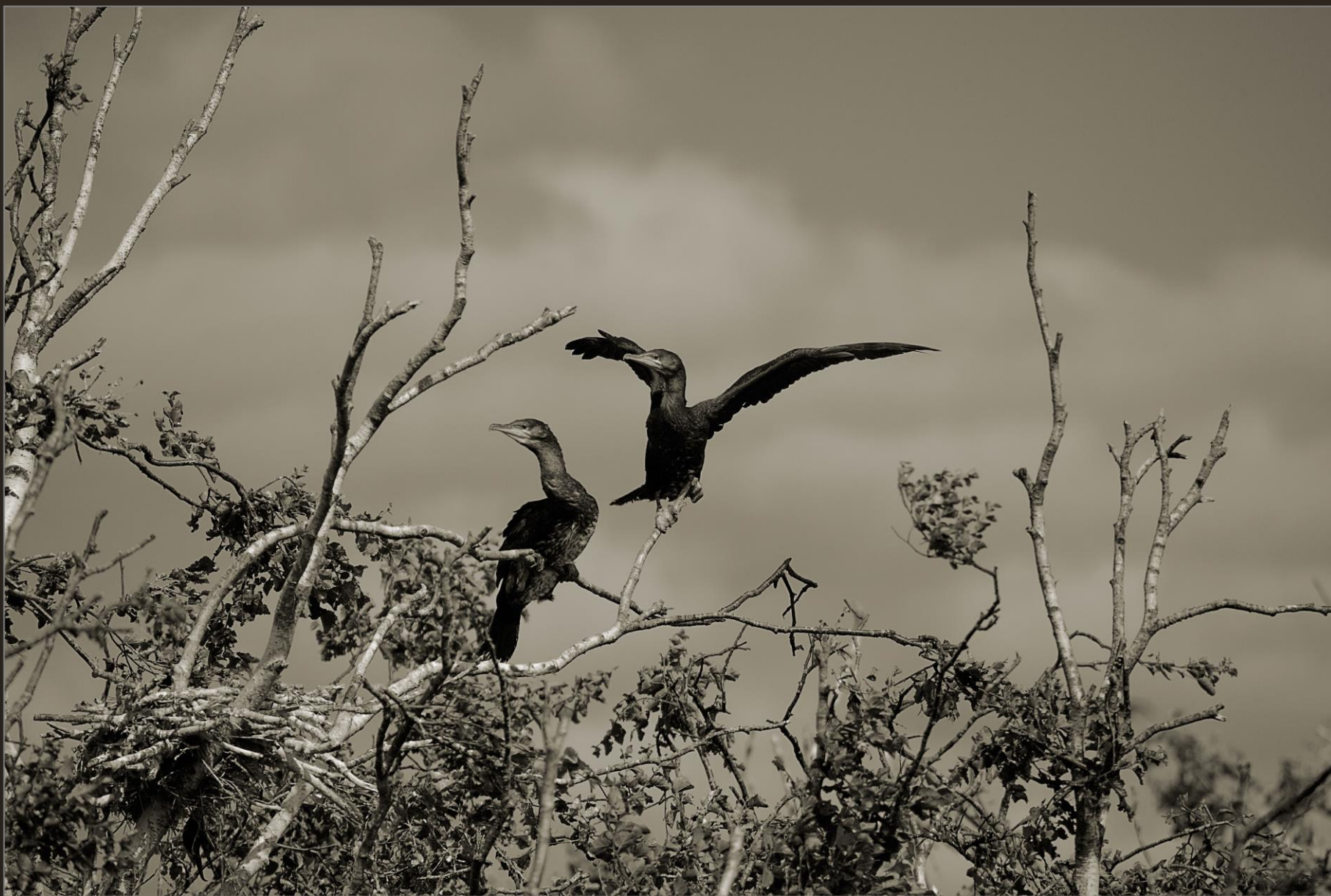
Cormorants, the cormorants colony at Toftesøen, Lille Vildmose, July 2007