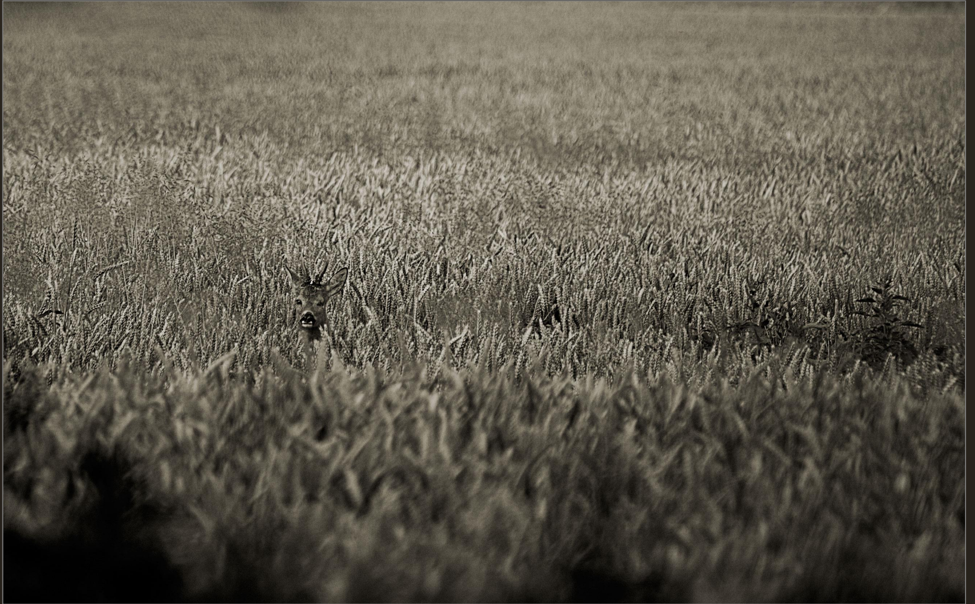
Roebuck, Louisendal, July 2008