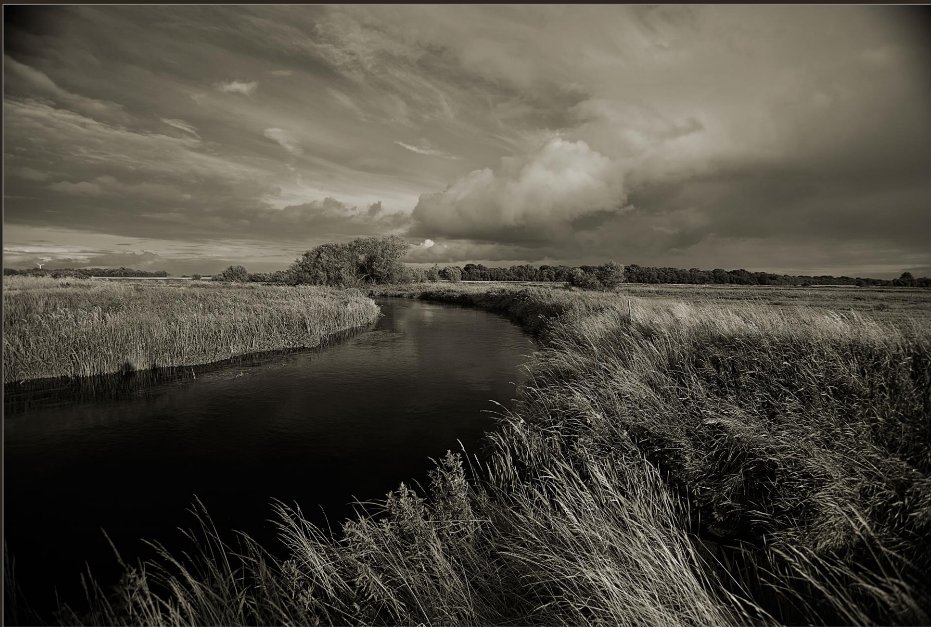
The river Lindenberg Å, Louisendal, July 2008