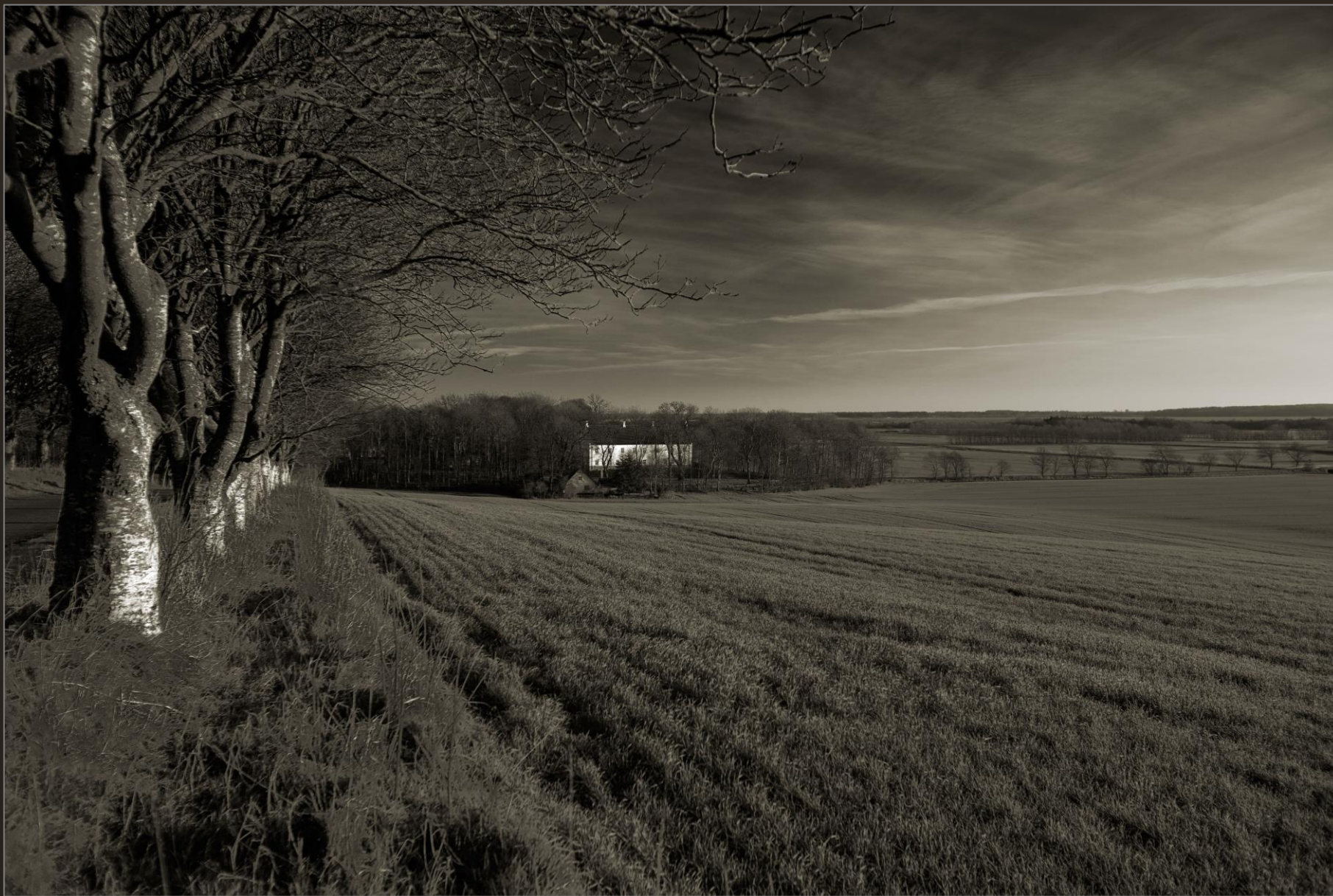
The Manor House Kongstedlund, December 2006