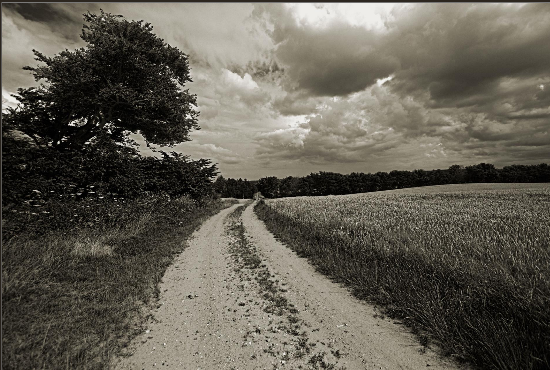
Lille Vildmose, the earth road from Kongstedlund, July 2005