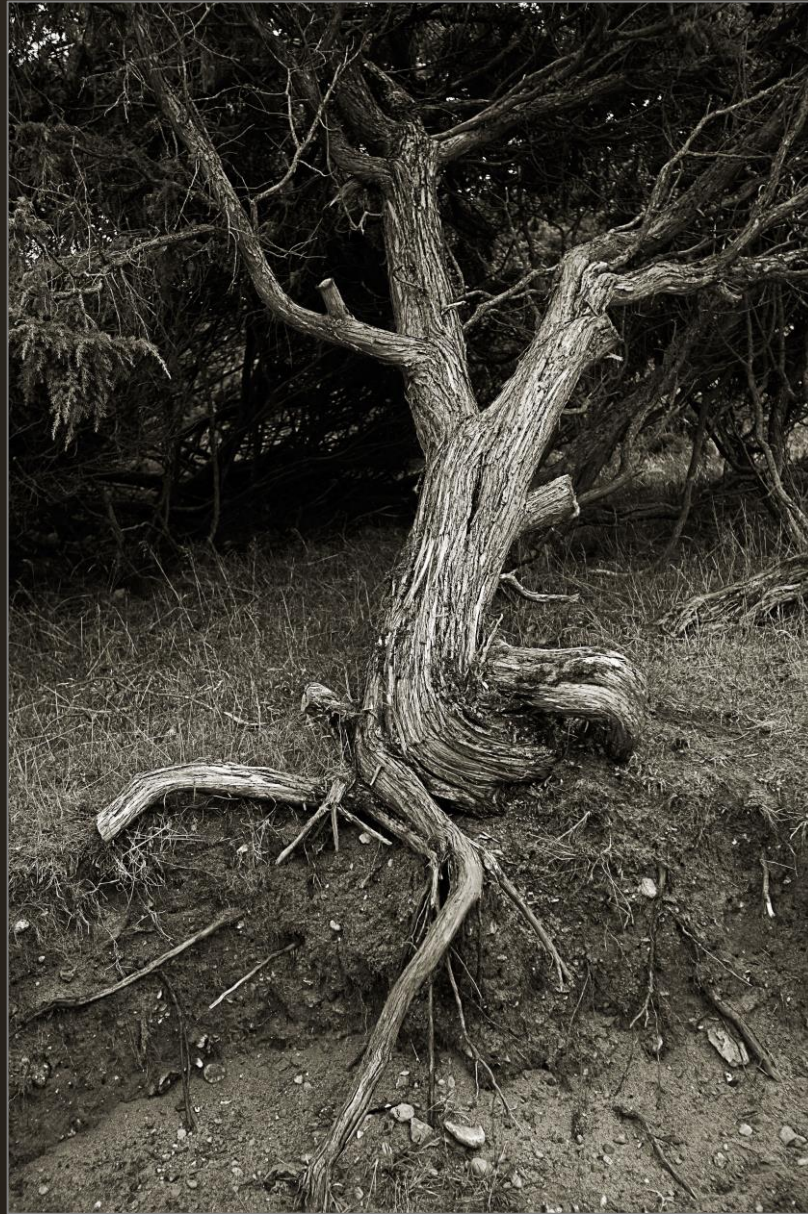
A juniper, Rebild, July 2009