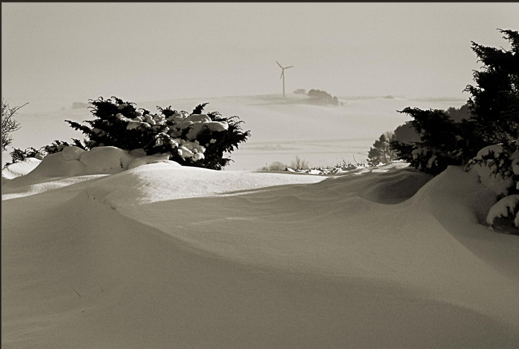
Kongerslev Præstegårdshede, The view towards the village Smidie, January 2006