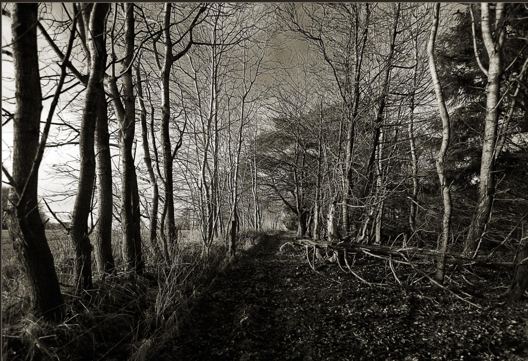
The edge of the wood, Kongerslev Præstegårdshede, December 2007