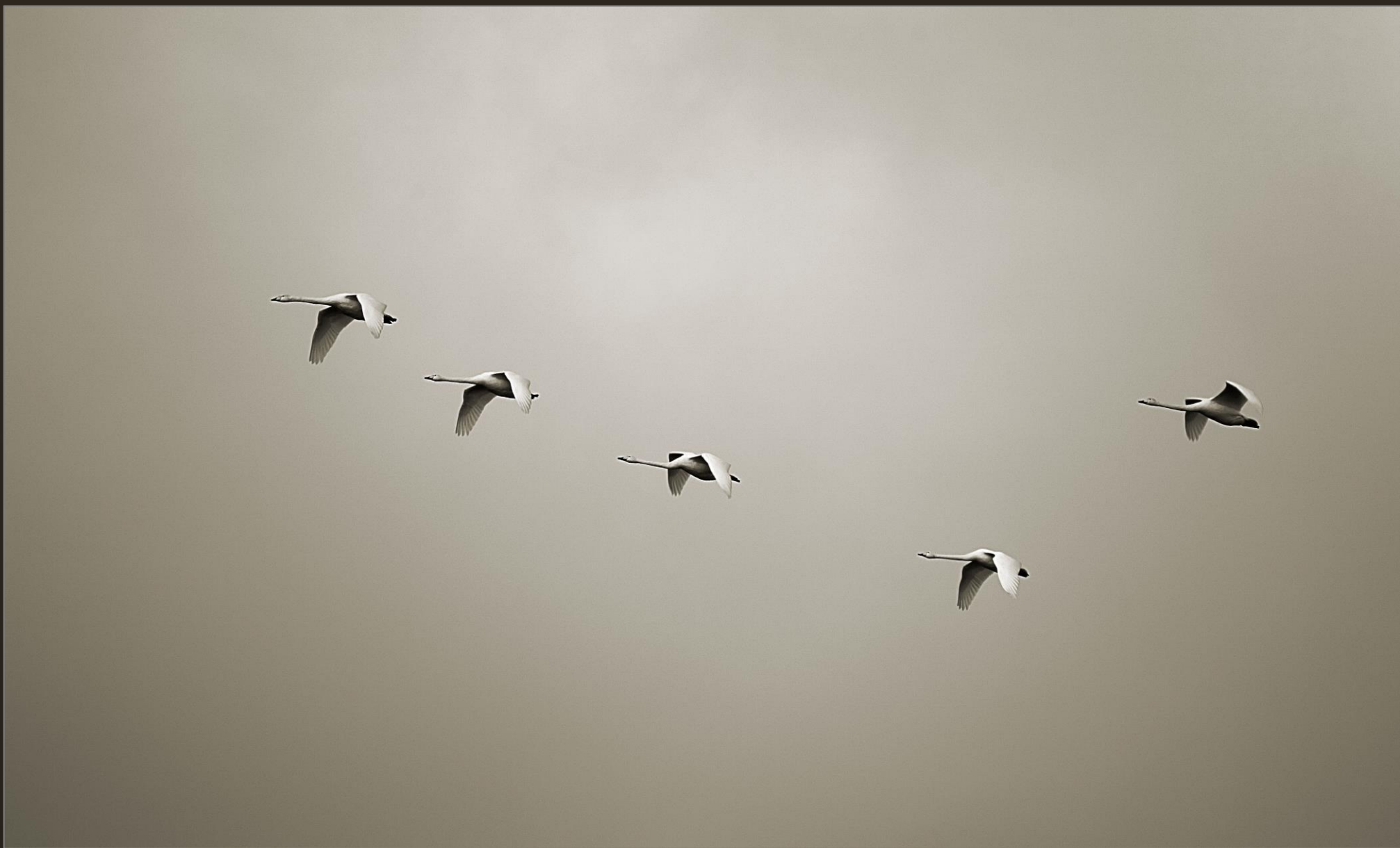
Whooper Swans, Fladen outside the village Kongerslev, August 2009