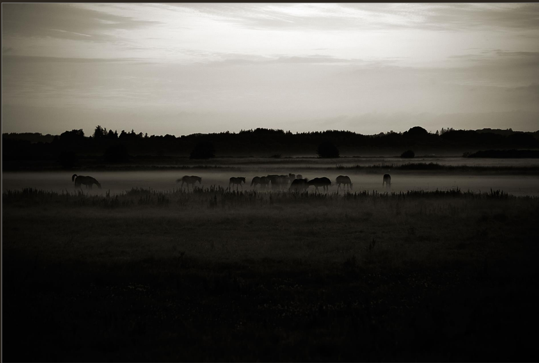
Horses surrounded by the ground mist, Lille Vildmose, July 2009