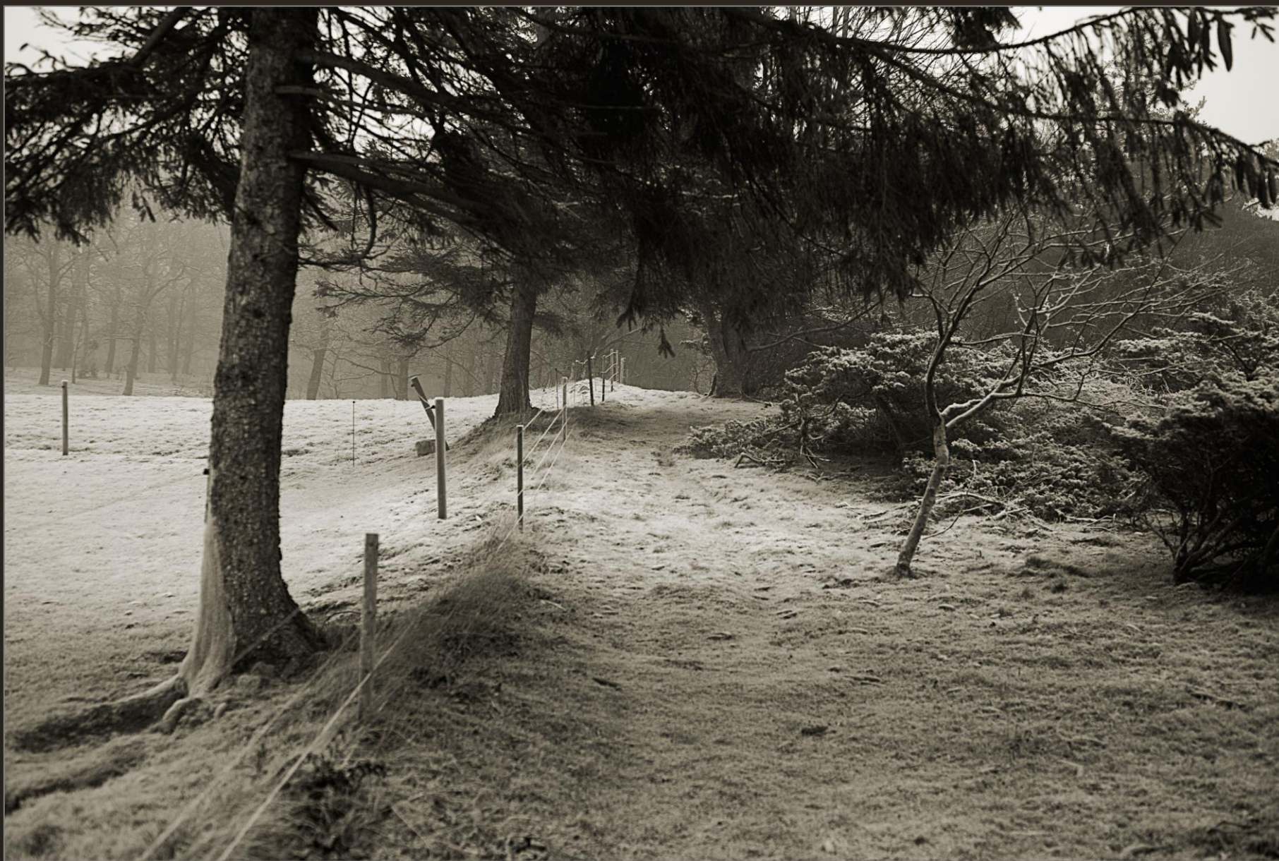
Freezing fog, Kongerslev Præstegårdshede, December 2008