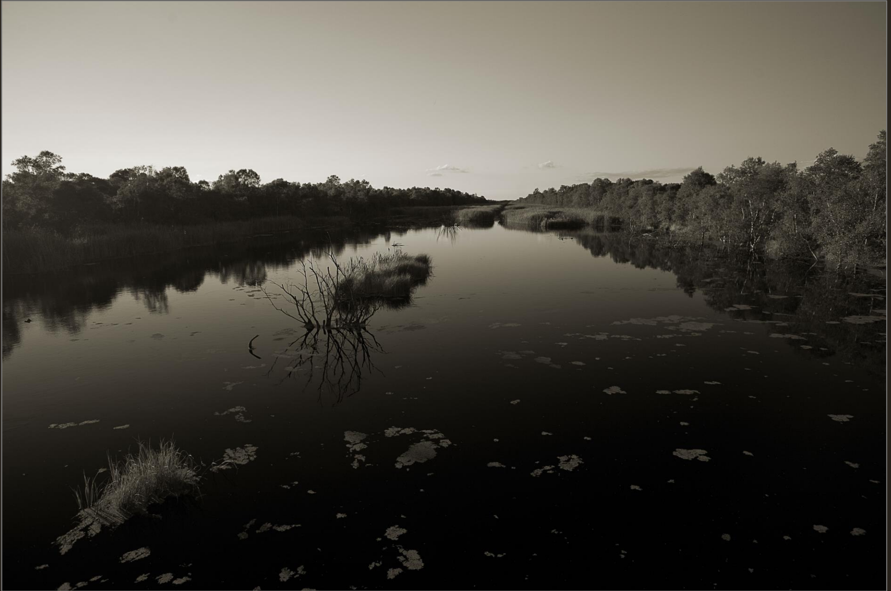
Portlandmosen, Lille Vildmose, July 2008