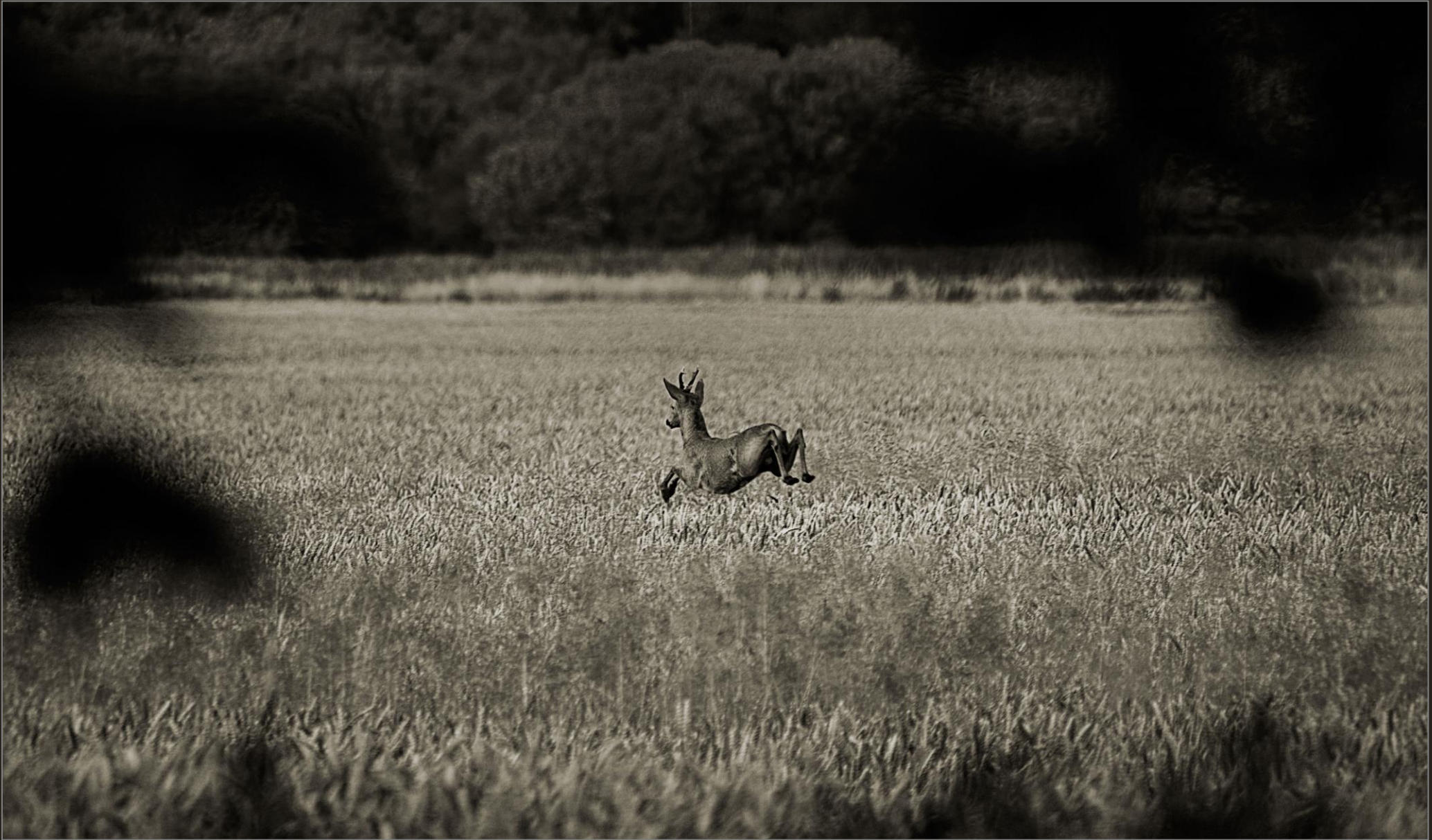
The roebuck put to flight, Louisendal, July 2008