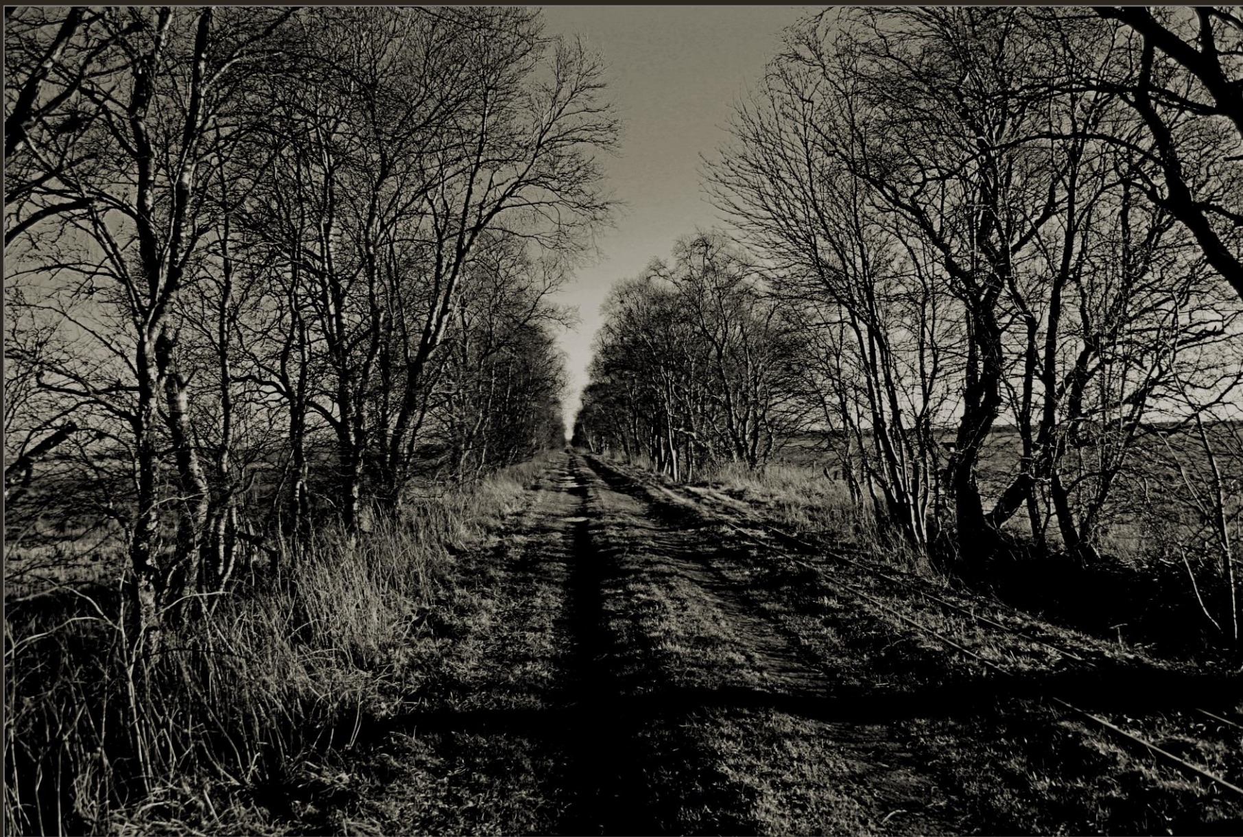
Lille Vildmose, the earth road Langelinie, December 2004