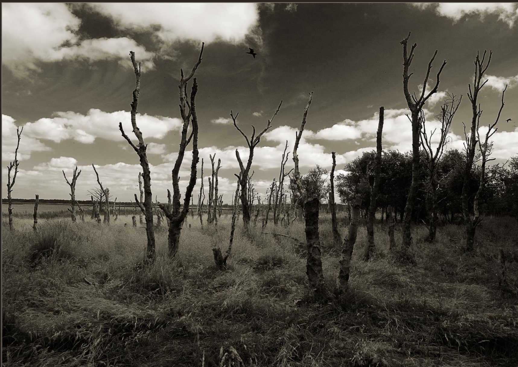
At the Toftesøen, Lille Vildmose, July 2007