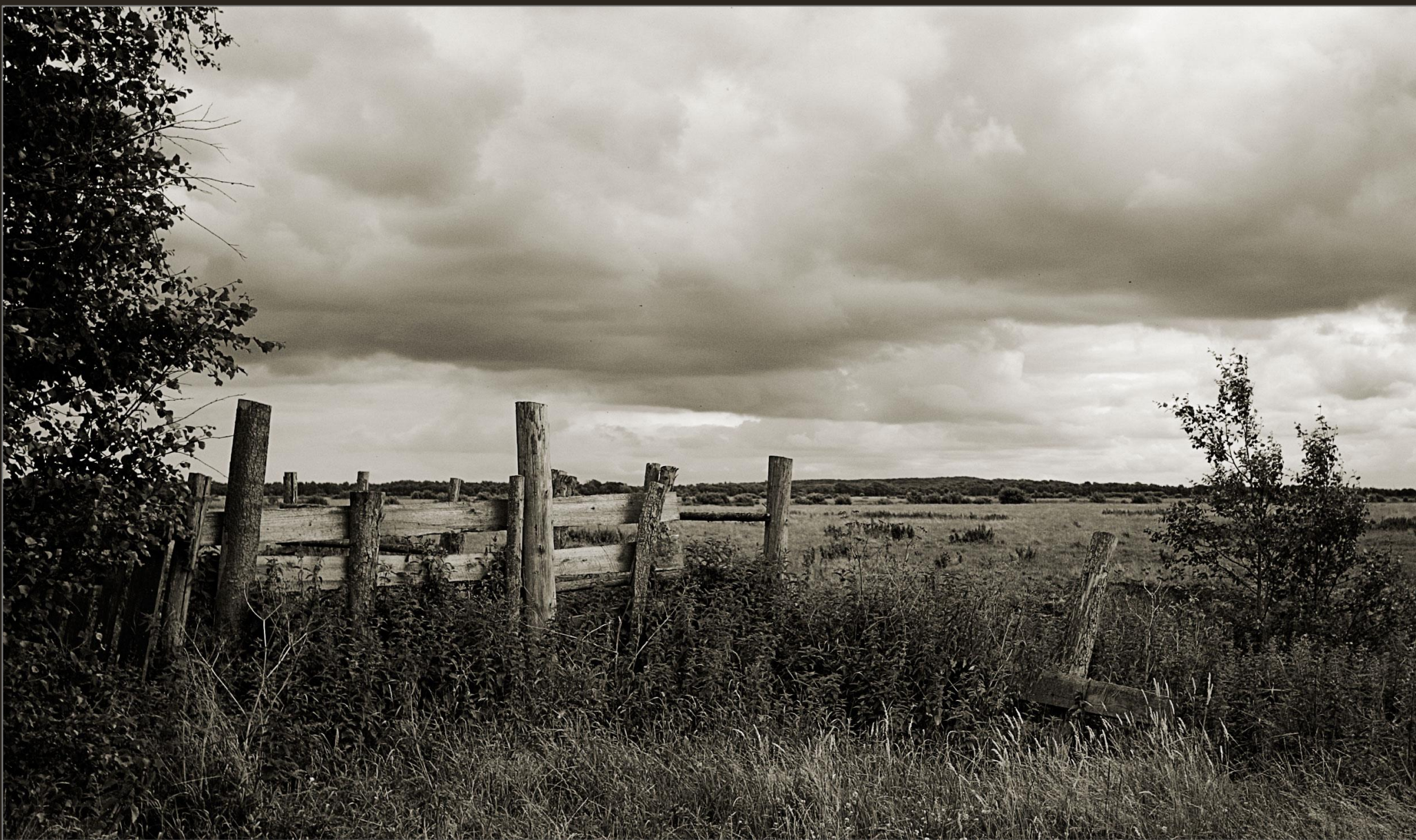
Lille Vildmose, the view from the earth road Langelinie towards Tofteskoven, July 2005