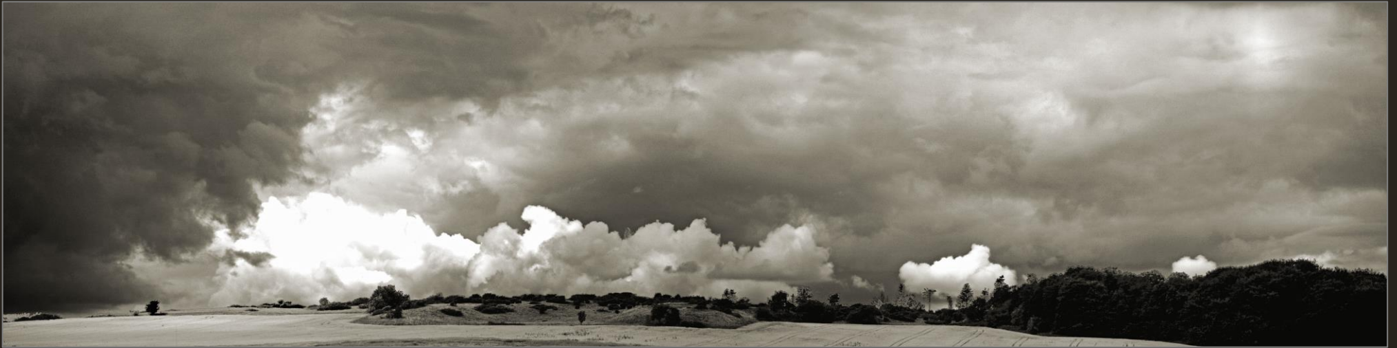
Thunderstorm, Kongerslev Præstegårdshede, August 2009