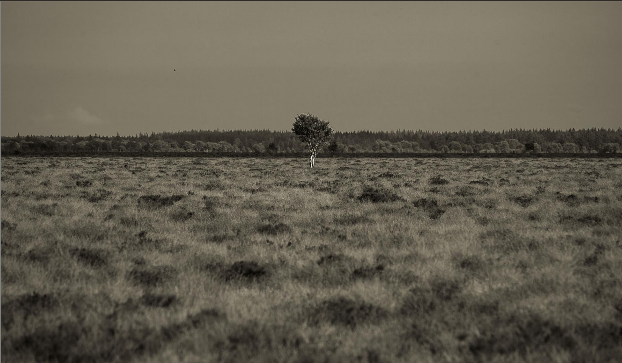
A birch at the raised bog, Lille Vildmose, July 2009