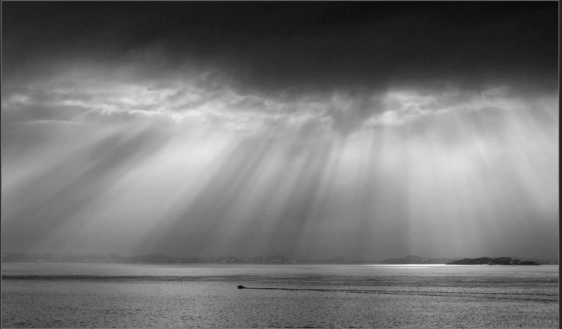
Sun shower above the fiord and Akia, May 2008