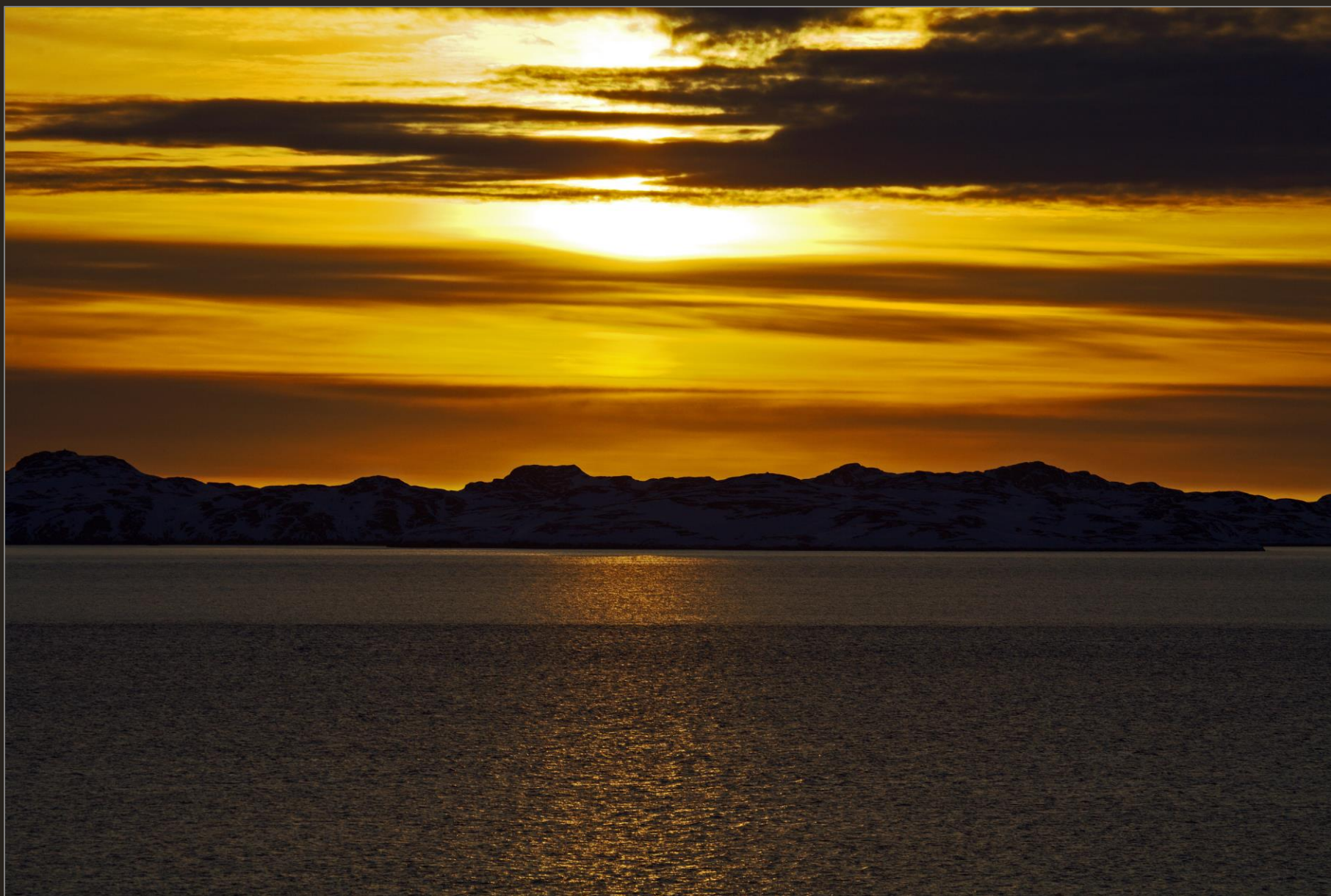
Sunset above Akia, April 2008