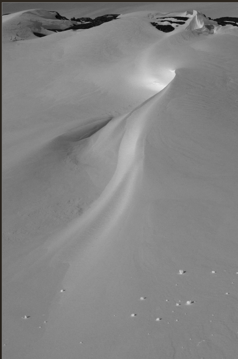
Landscape of snow, April 2005