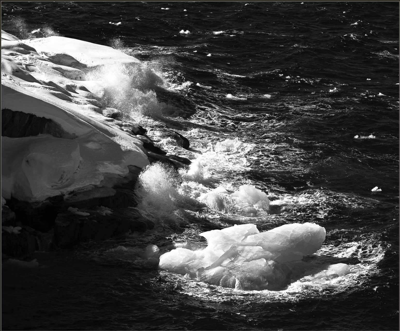
Ice floes caught in the surf, April 2007