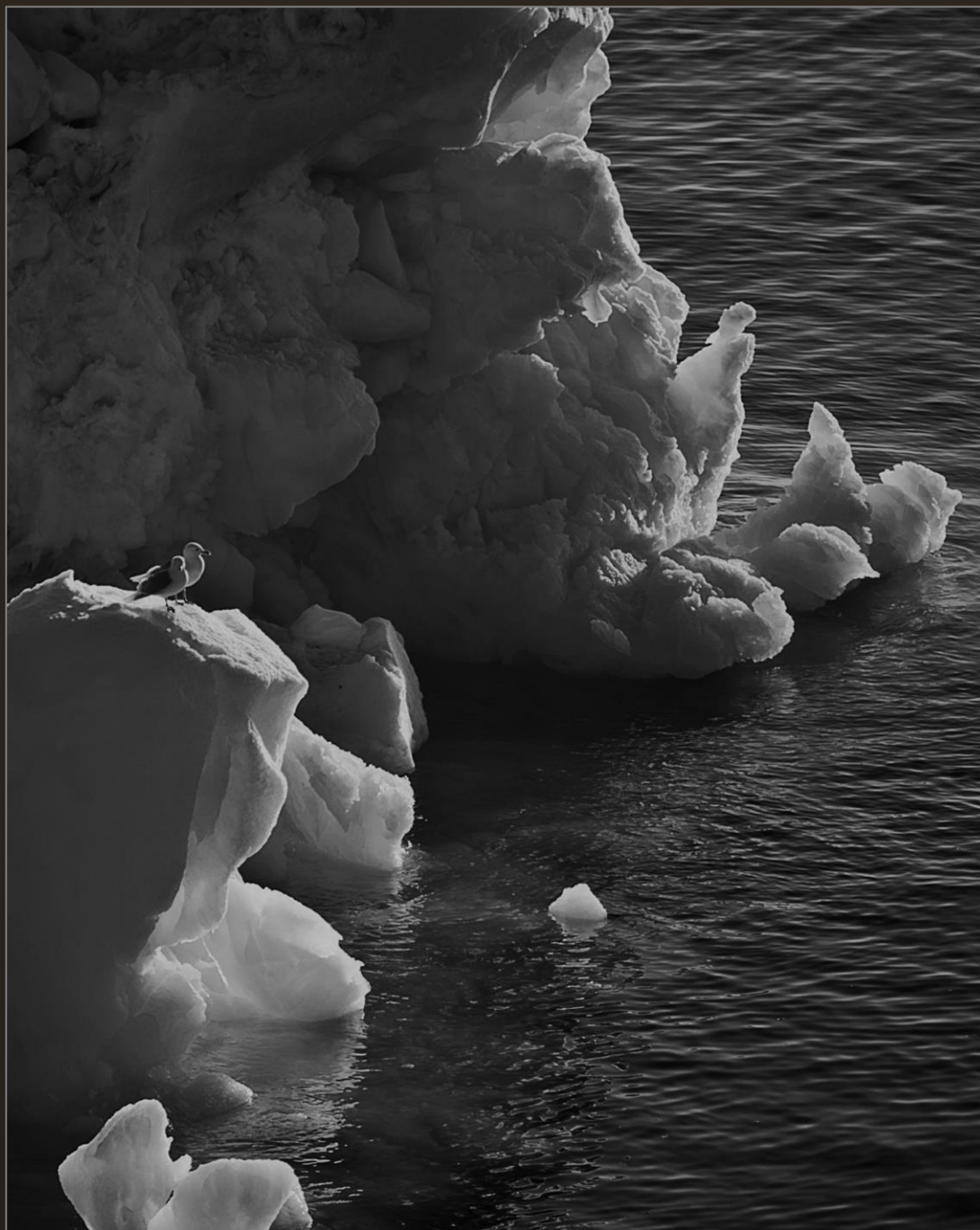
Iceland gulls on ice floe, April 2007