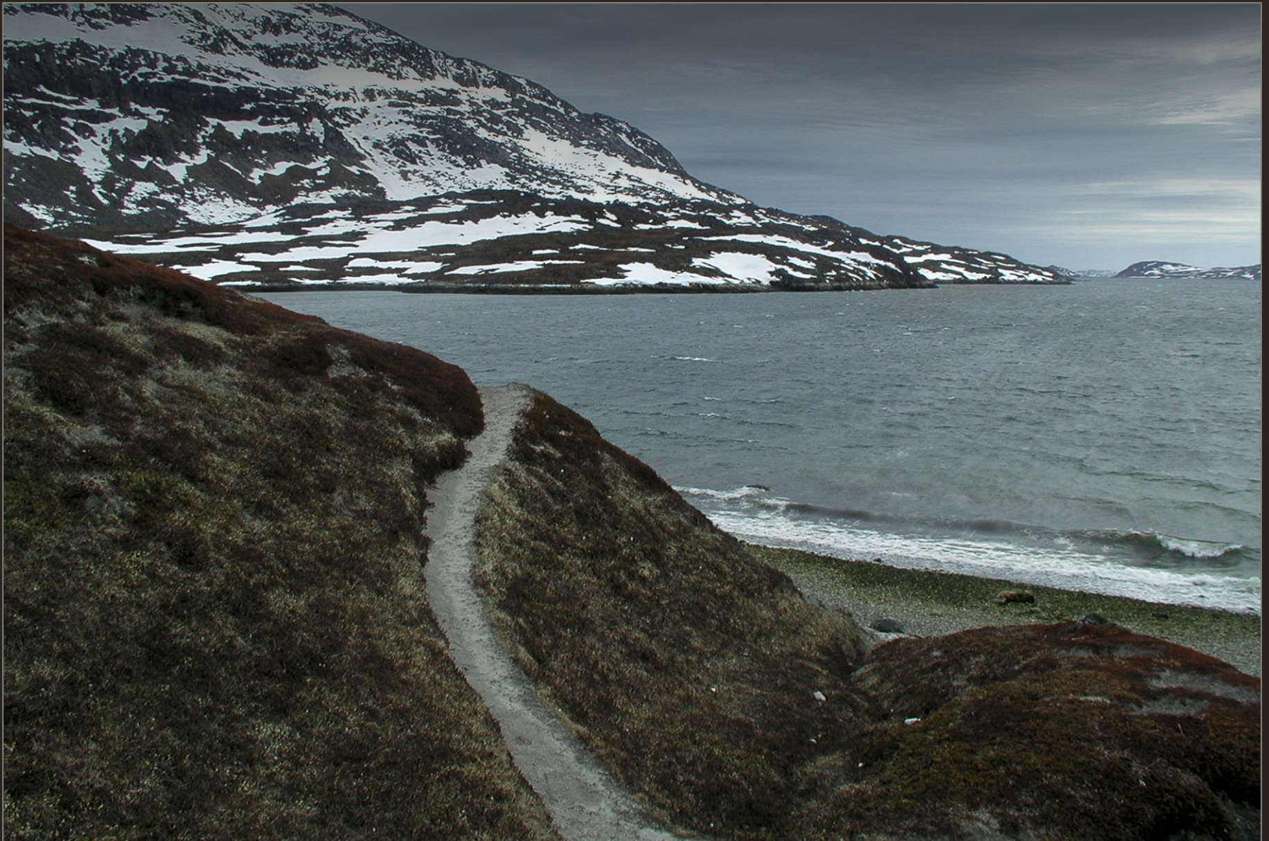
A track along the coast, Malene Bay, May 2001