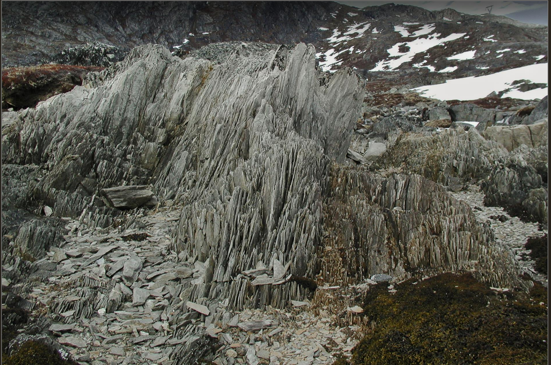
Weathered rocks, May 2001