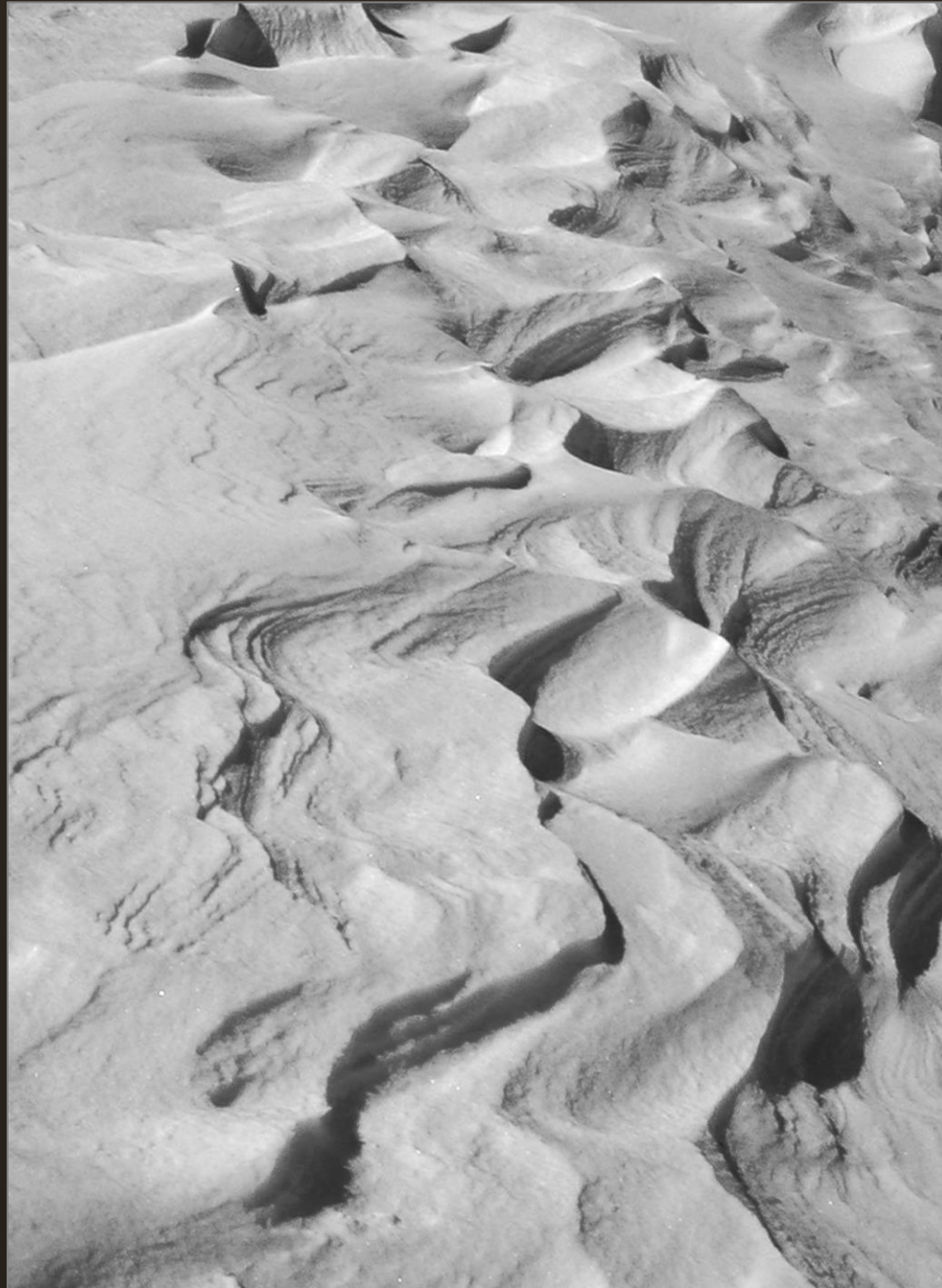
Figures in the snow, April 2005