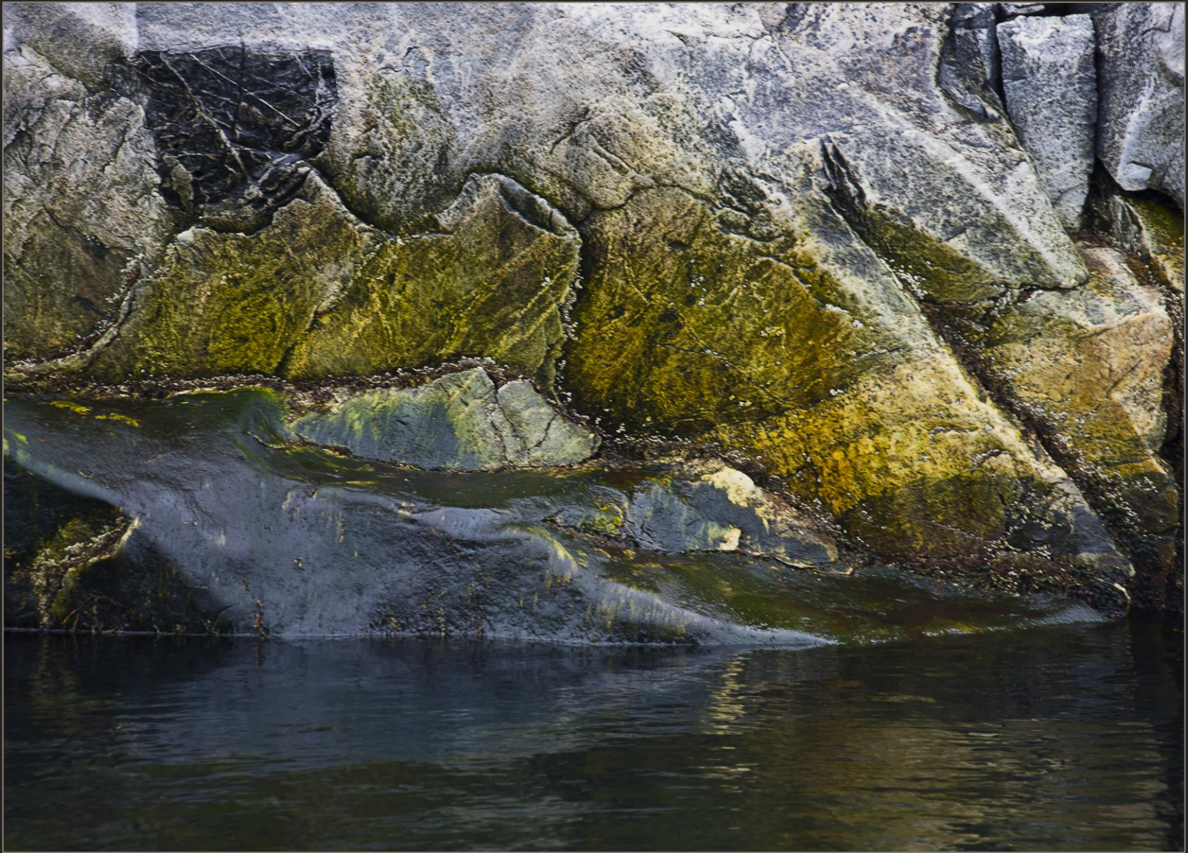
Algae on rocks, low tide, May 2008