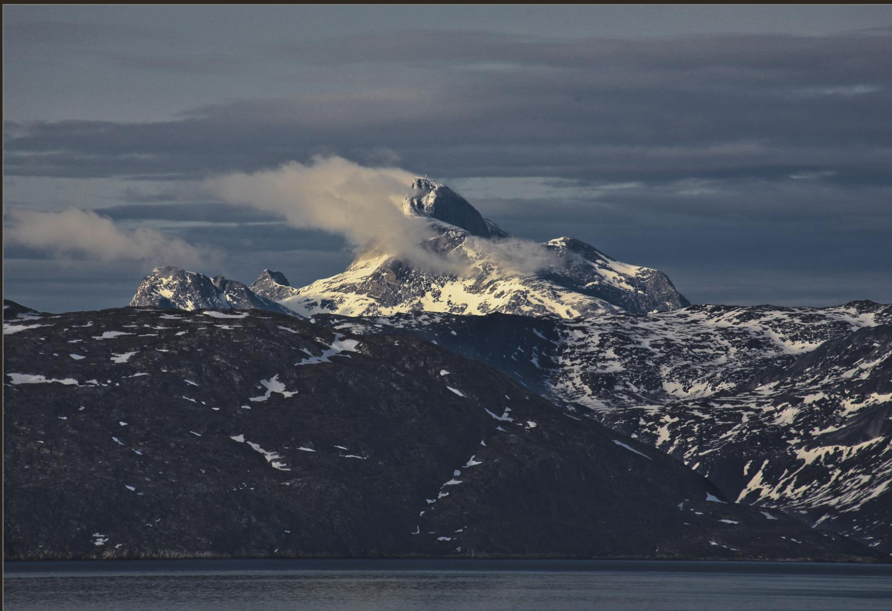
Sunshine on the high mountains on the island Storøen, May 2008