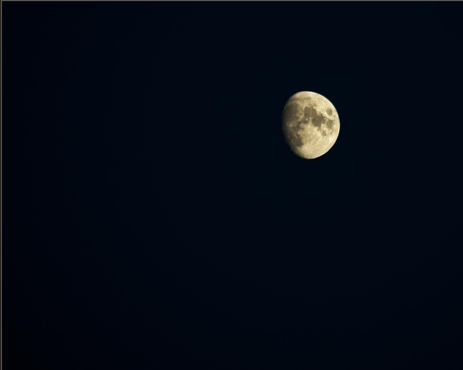
The moon above Nuuk, May 2008