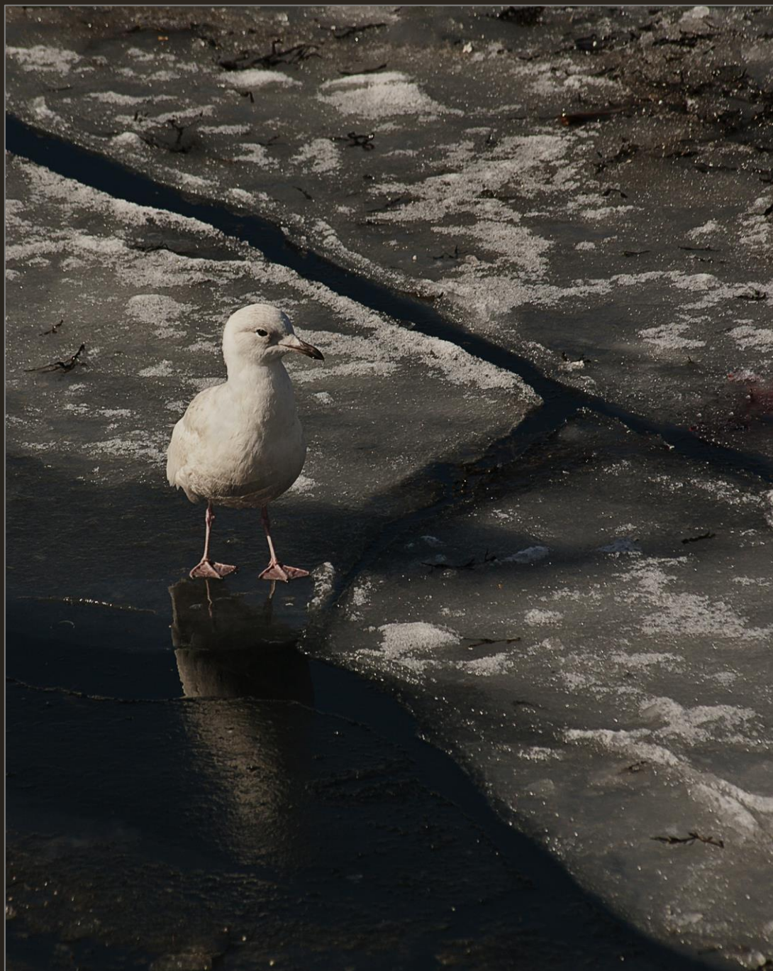
Iceland gull on ice floe, April 2008