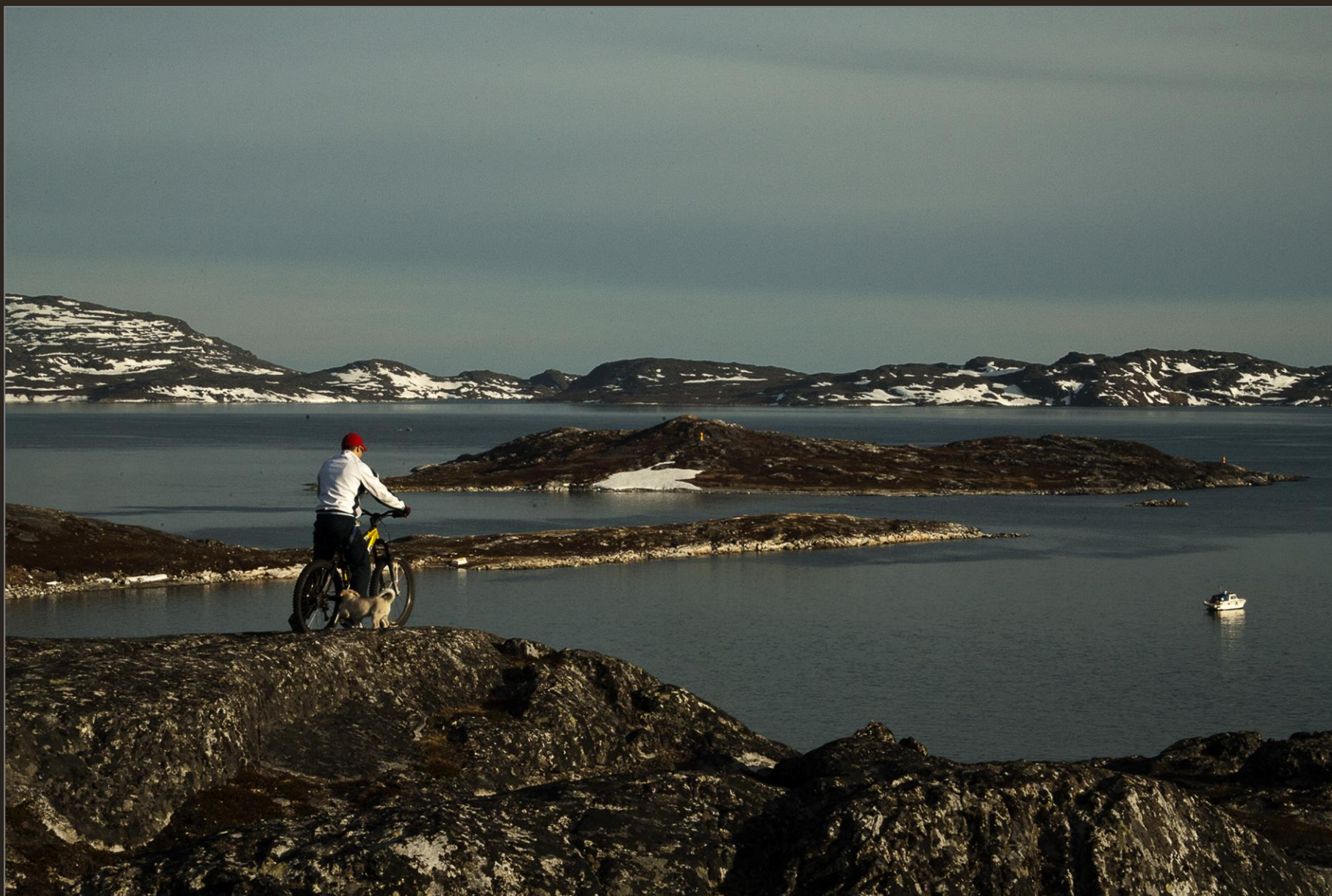
View over the Malene Bay, May 2006