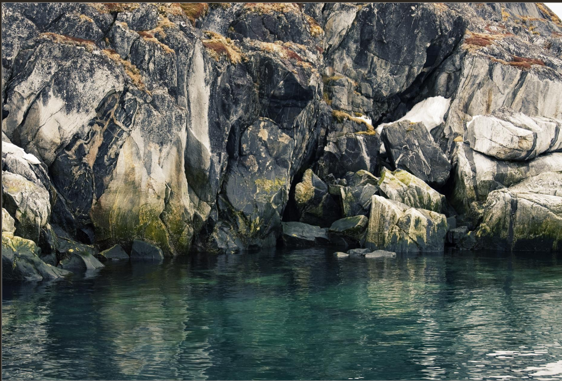
Low tide at the coast, May 2008