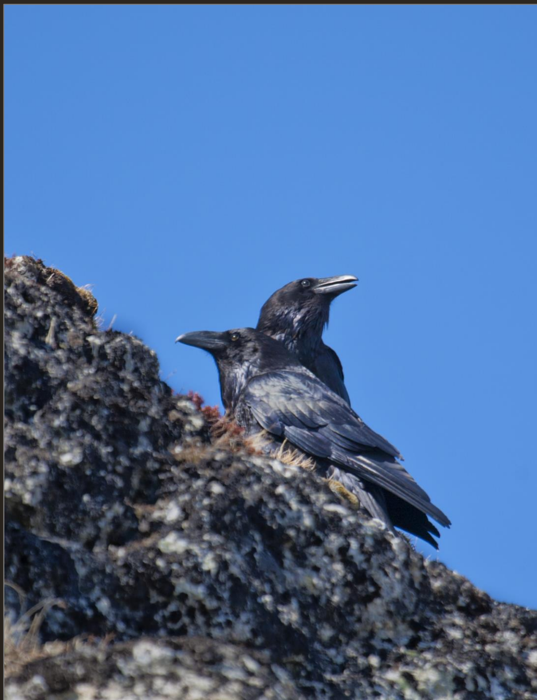
A pair of ravens, May 2007