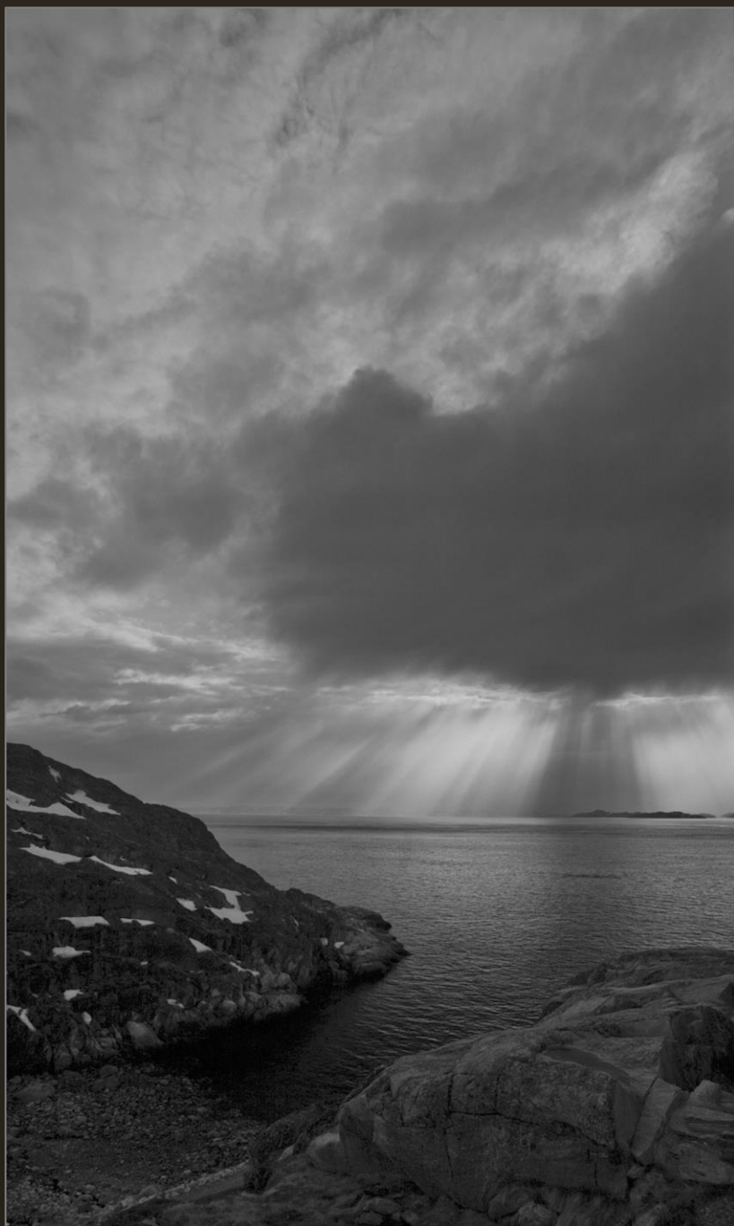
Sun shower above the fiord, May 2008