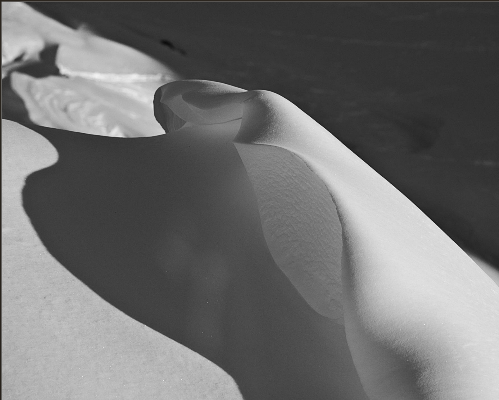
A snow drift in the sun, April 2007