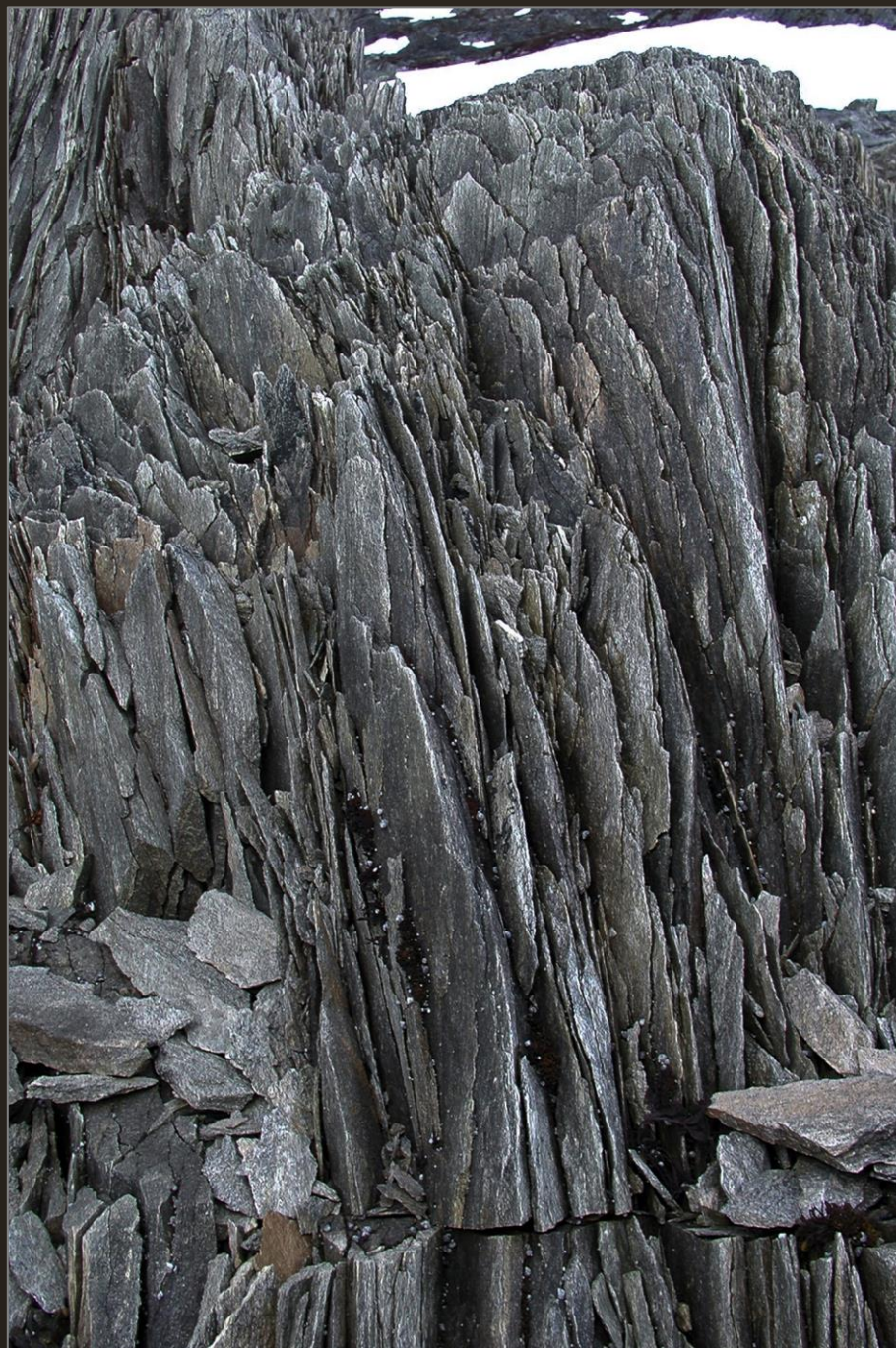
Weathered rocks by the coast, Malene Bay, May 2001