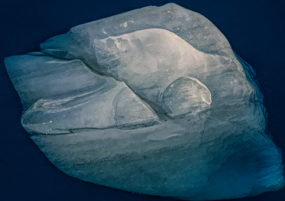
Godthåbsfjorden, Vestgrønland, august 2010