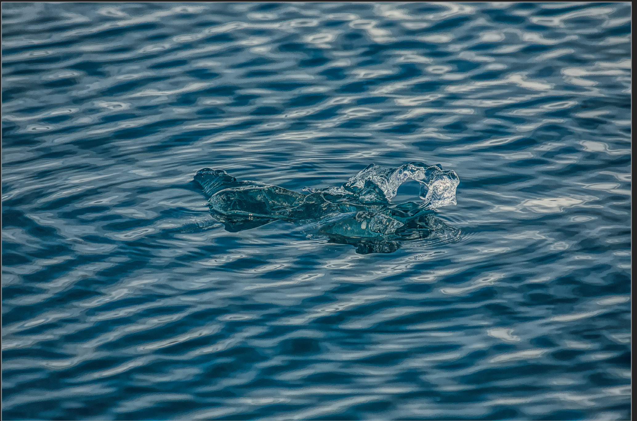
Godthåbsfjorden, Vestgrønland, august 2010