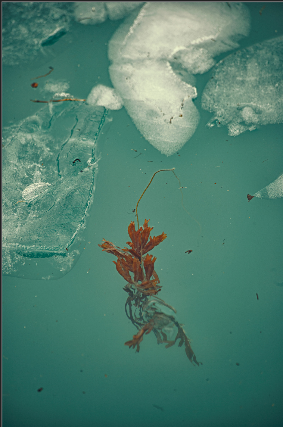
Qooroq Isfjord, Sydgrønland, september 2017