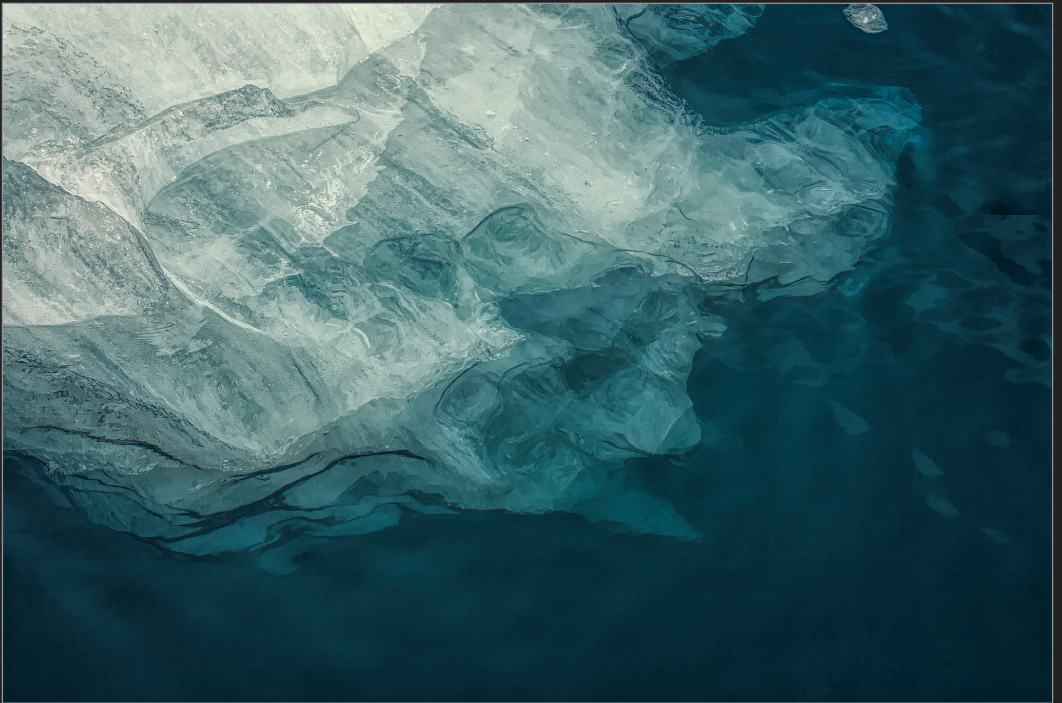
Godthåbsfjorden, Vestgrønland, juni 2013