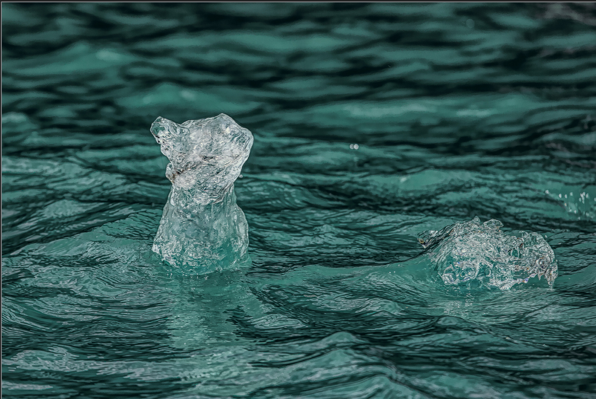
Godthåbsfjorden, Vestgrønland, august 2010