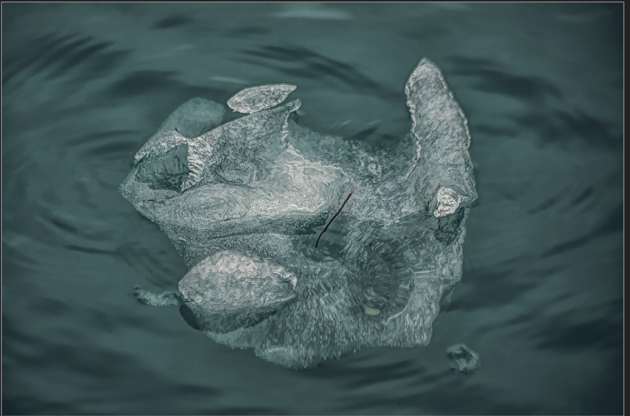
Qooroq Isfford, Sydgrønland, september 2017