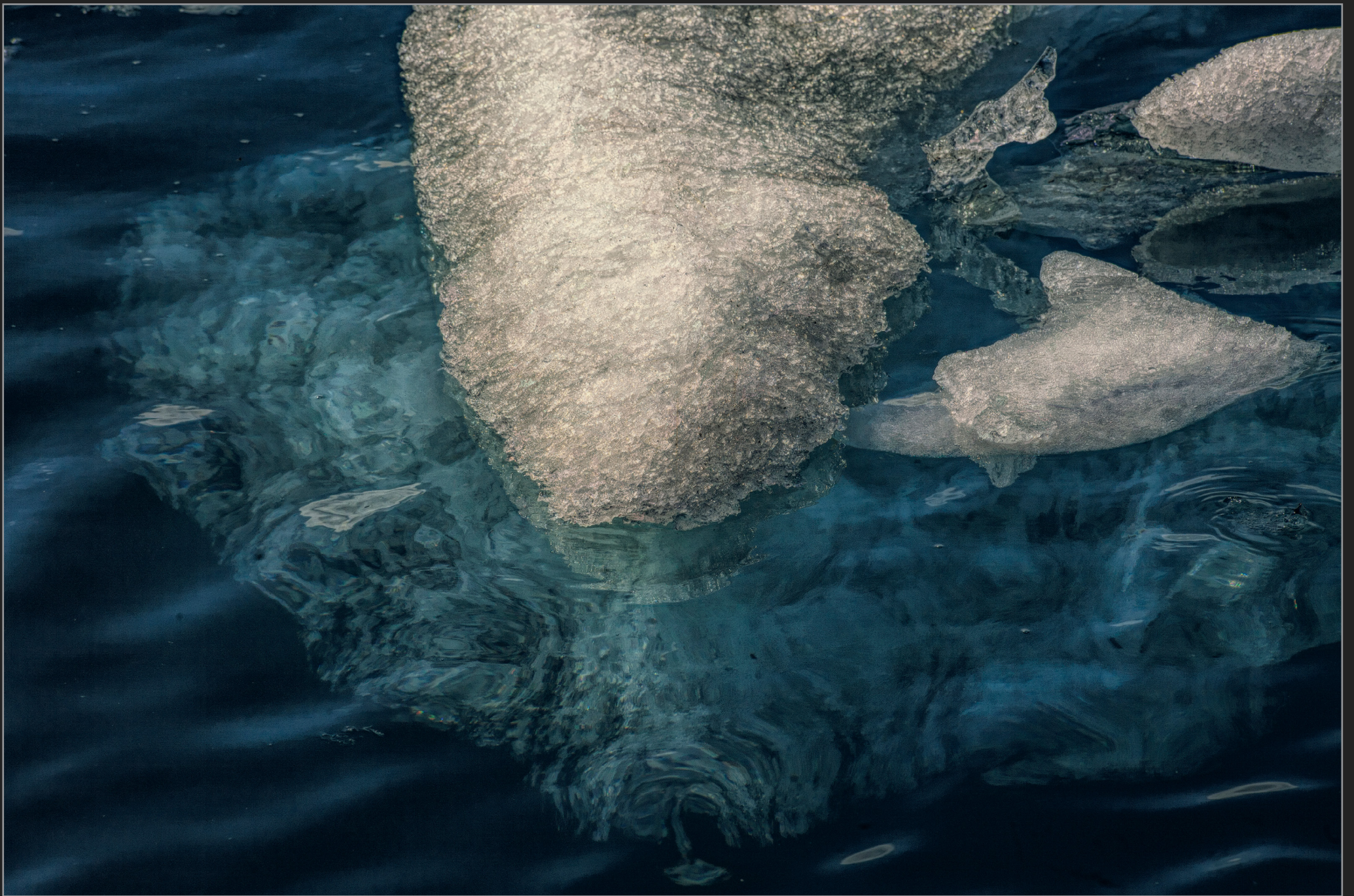
Godthåbsfjorden, Vestgrønland, august 2010