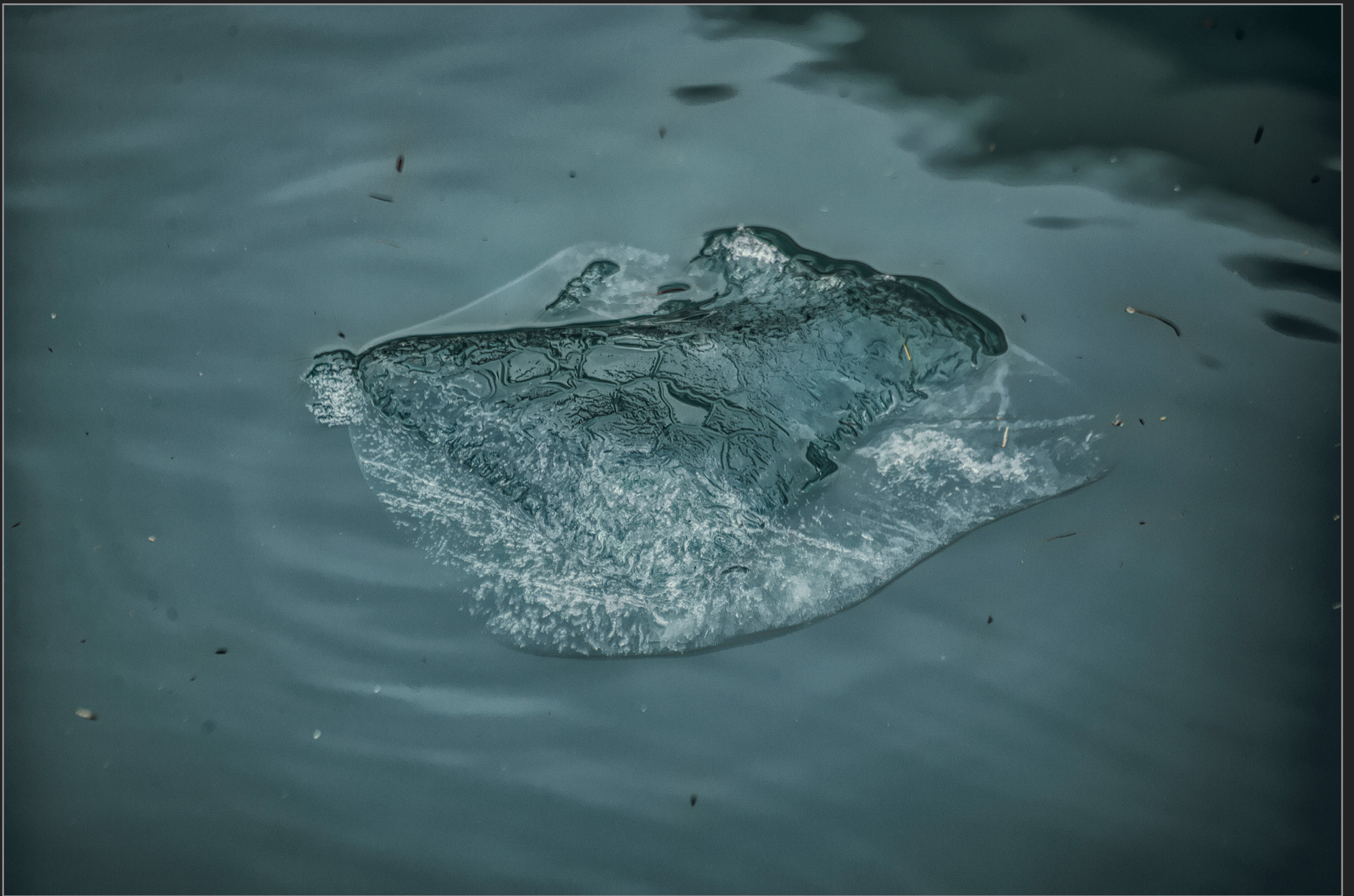
Qooroq Isfford, Sydgrønland, september 2017