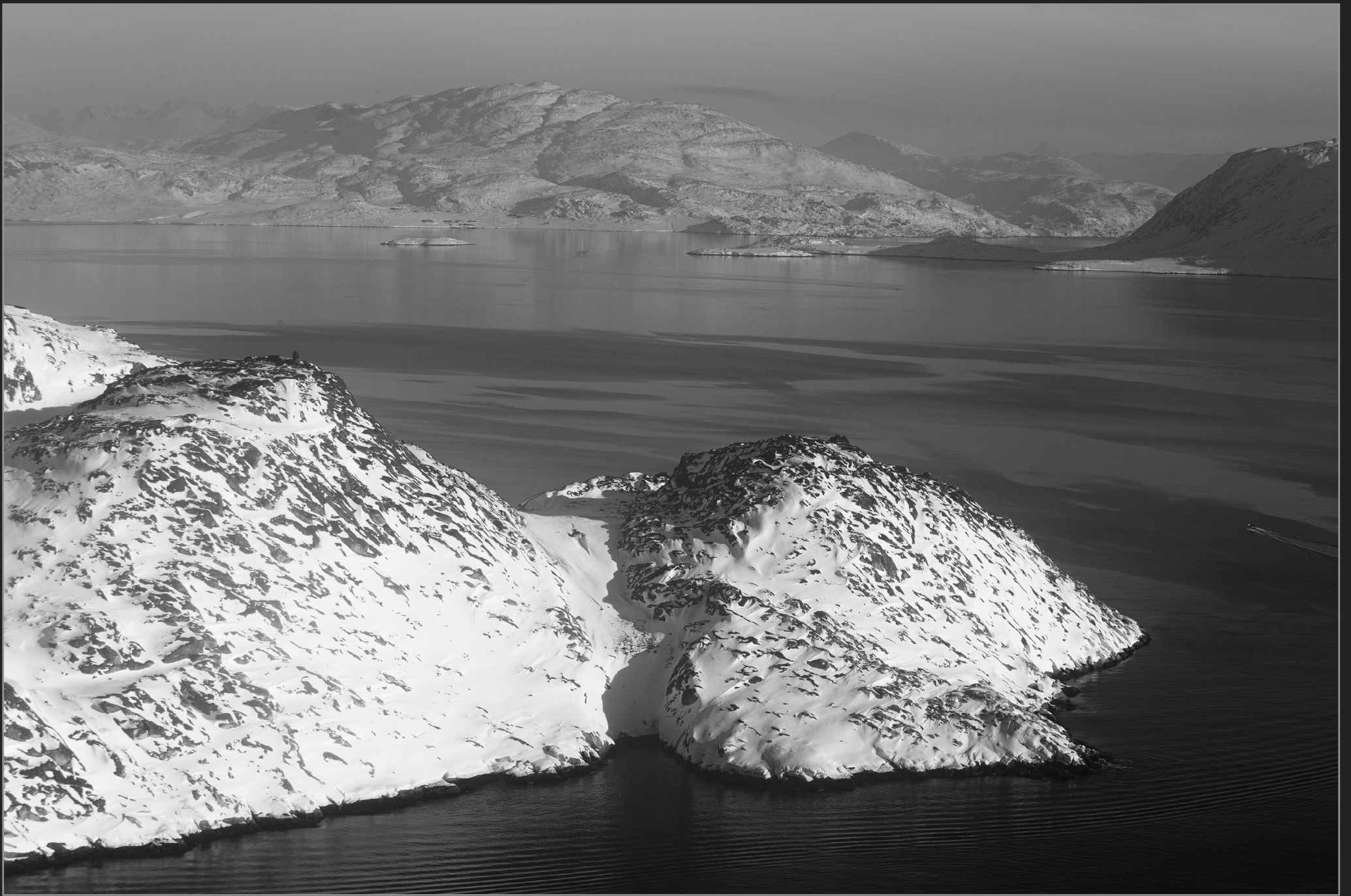
Vestgrønland, februar 2014