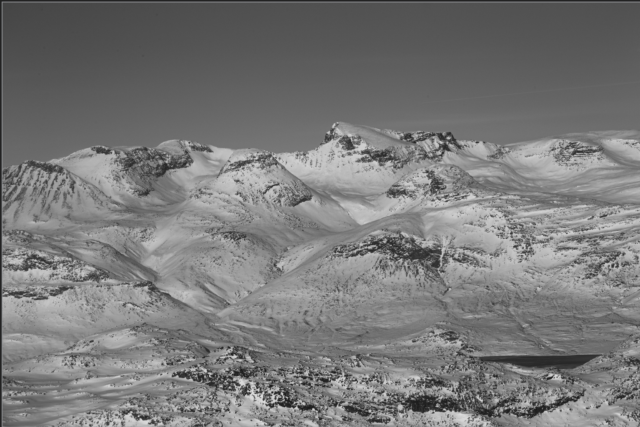
Vestgrønland, februar 2014