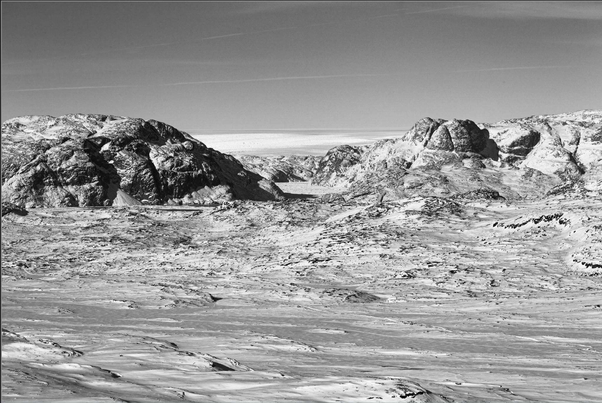
Vestgrønland, februar 2014