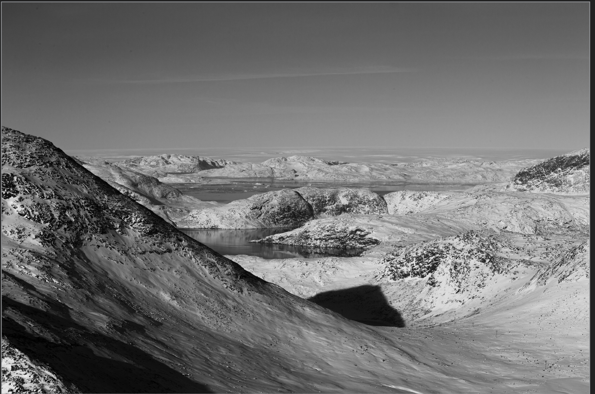
Vestgrønland, februar 2014