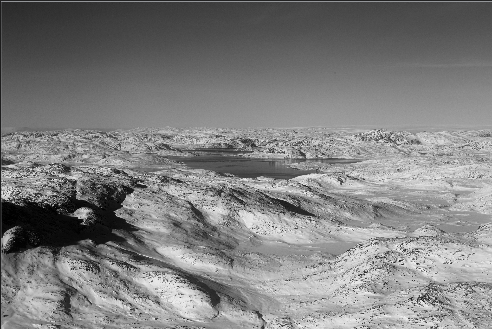
Vestgrønland, februar 2014