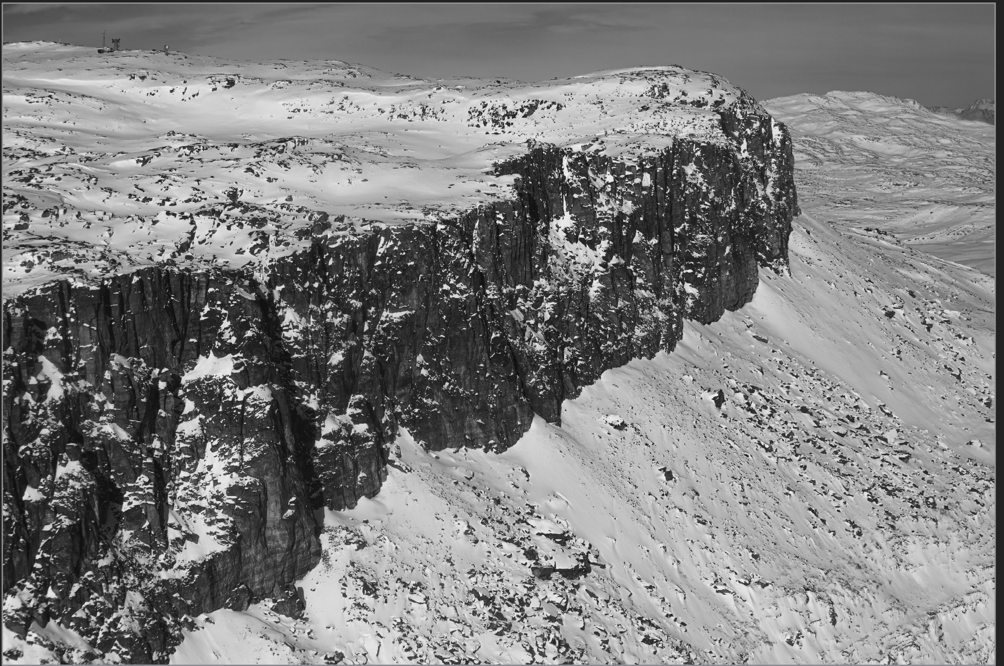
Vestgrønland, februar 2014