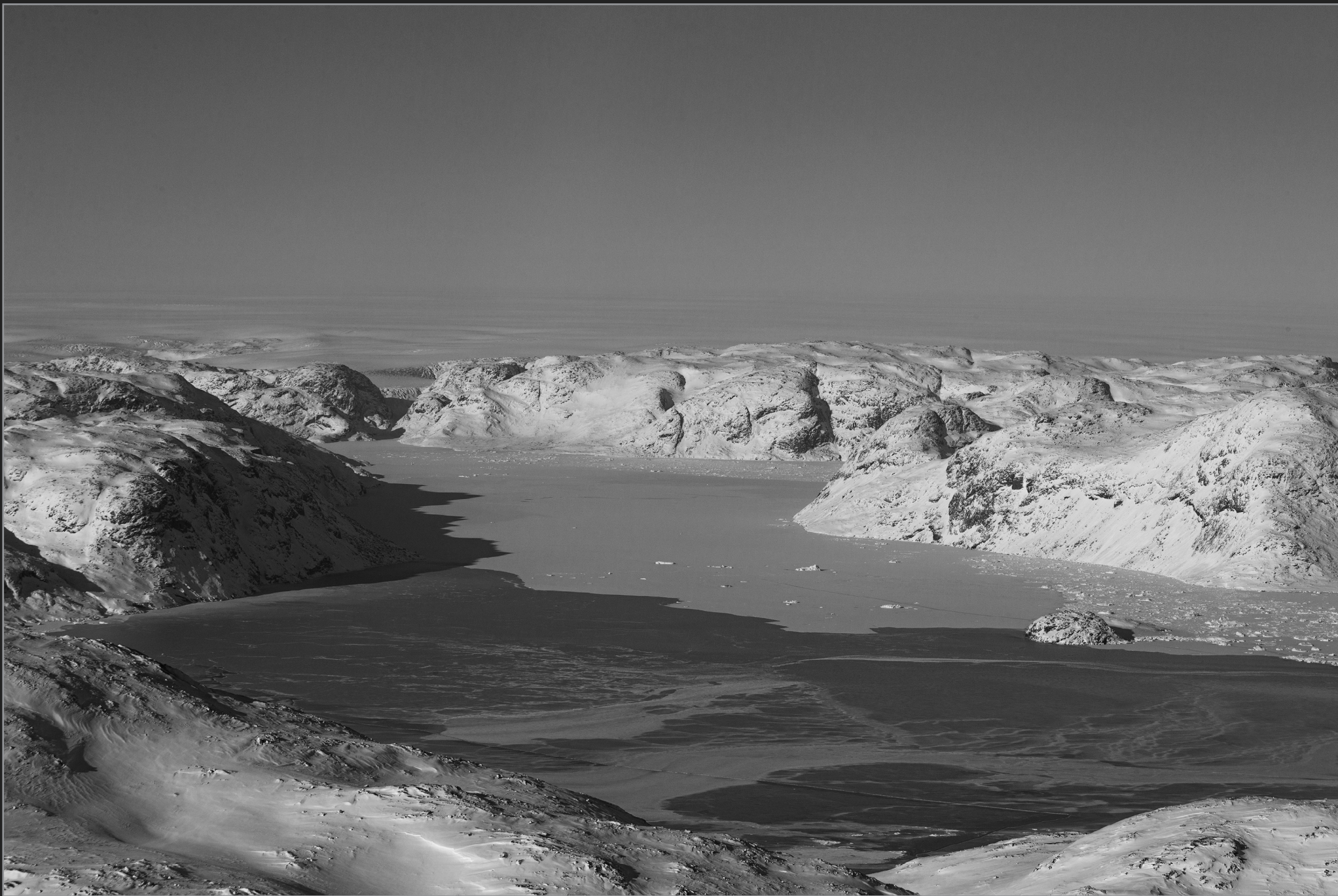
Vestgrønland, februar 2015