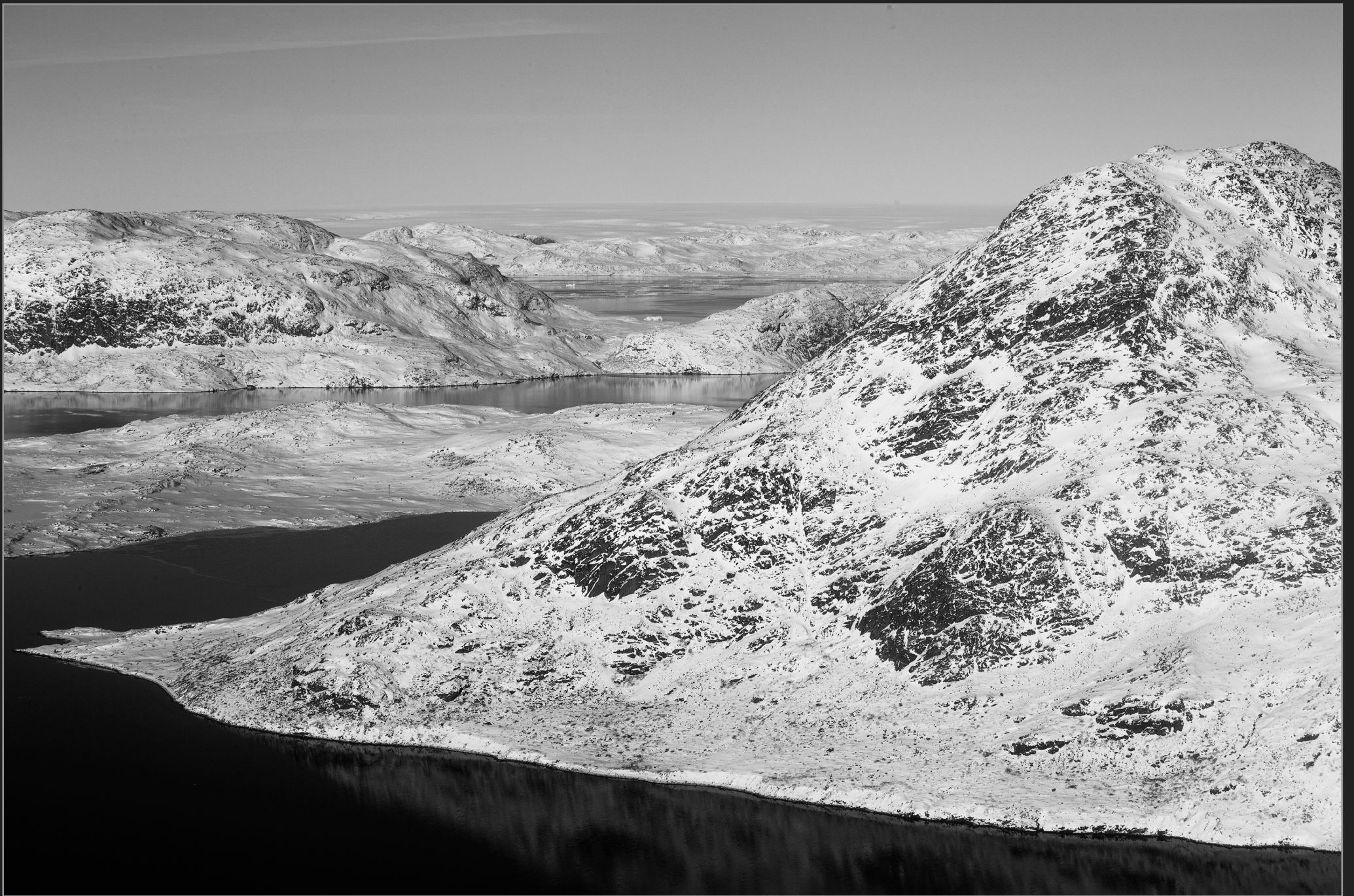
Vestgrønland, februar 2014