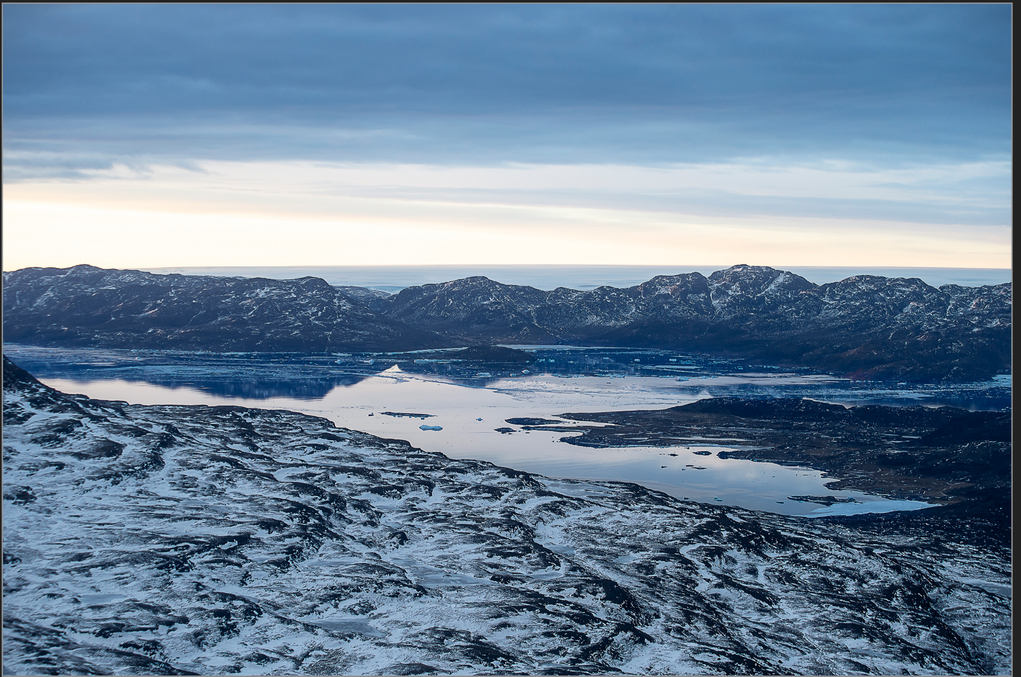
Sydgrønland, januar 2018