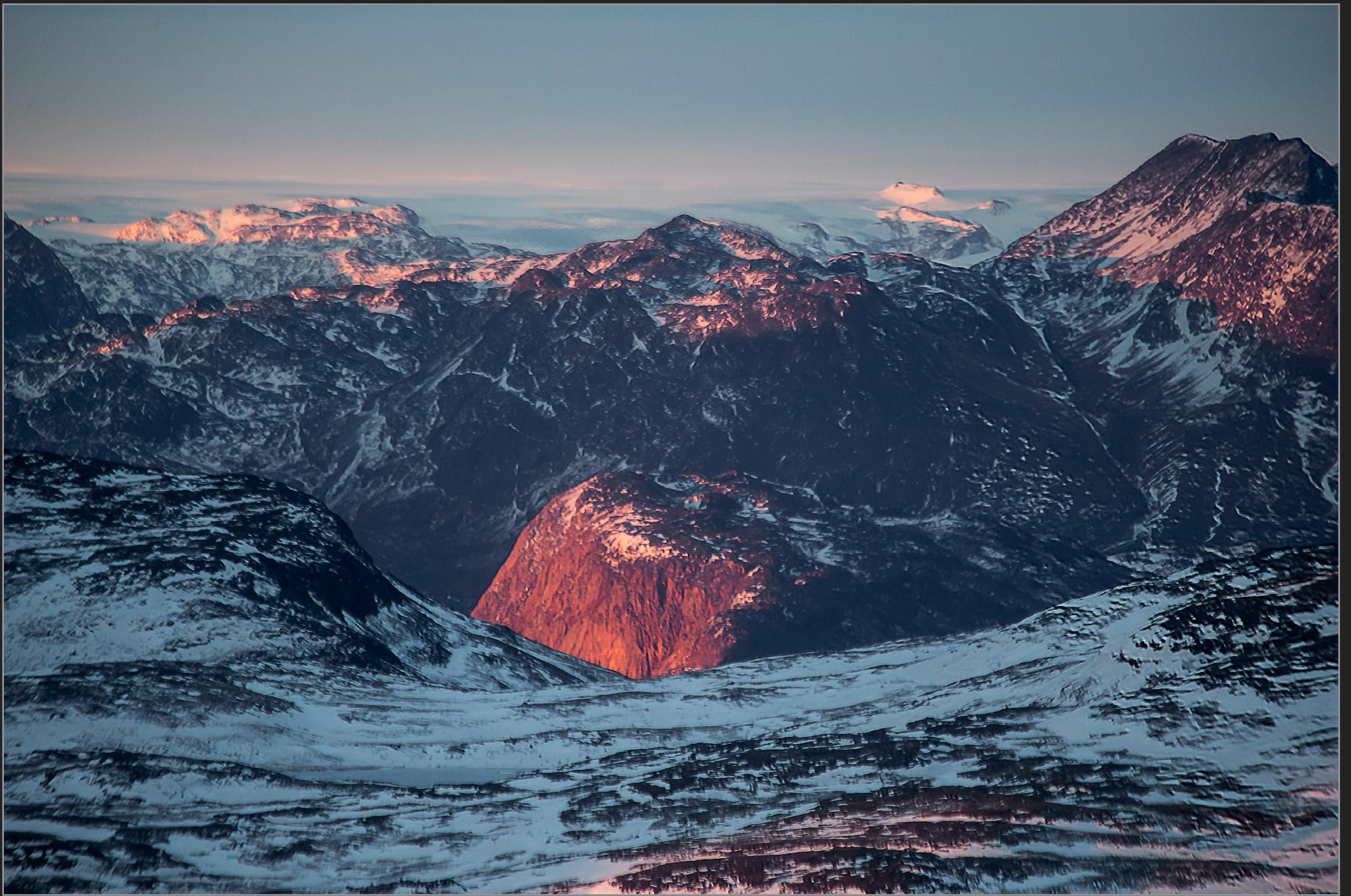
Sydgrønland, januar 2018