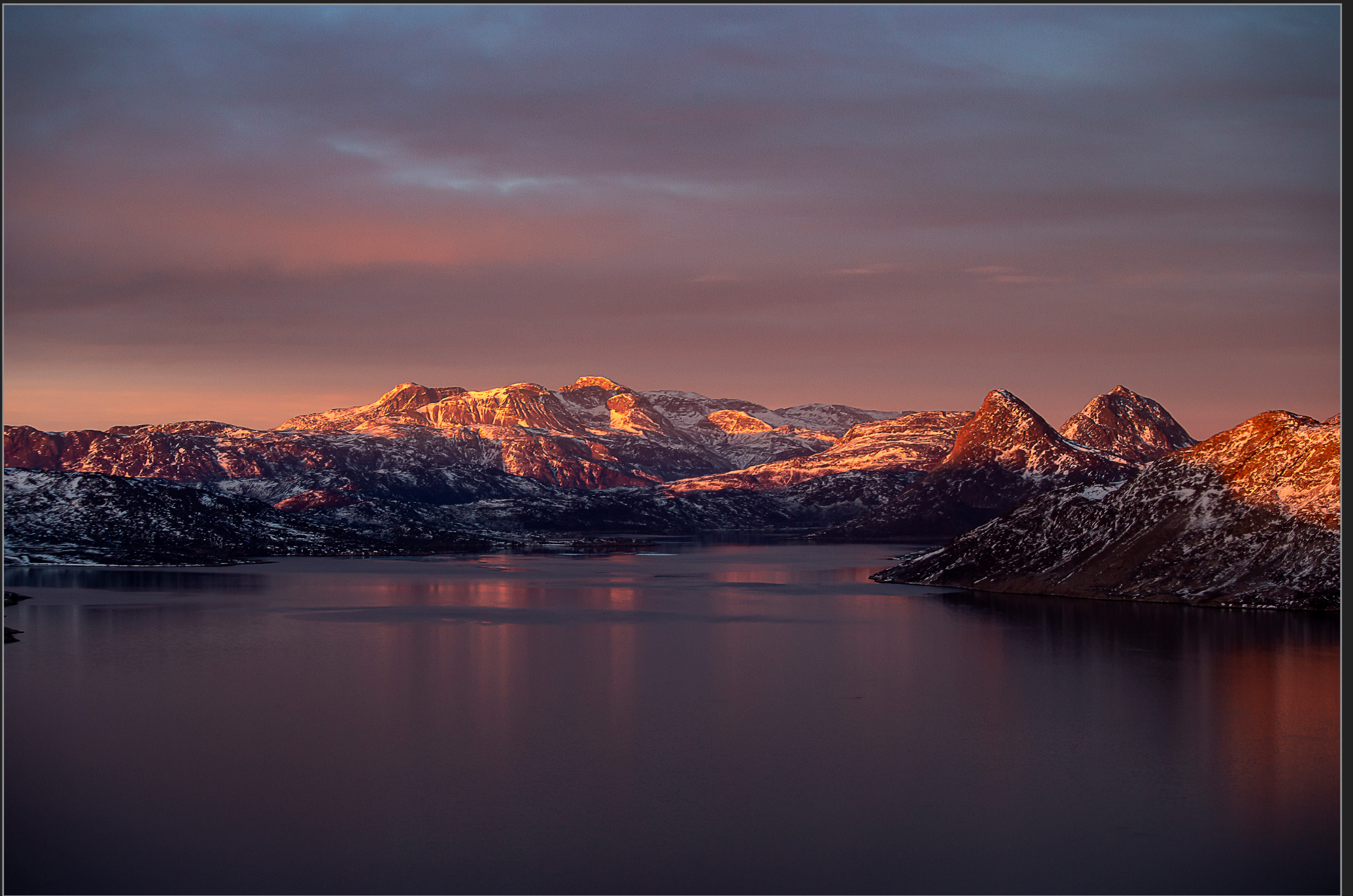
Sydgrønland, januar 2018