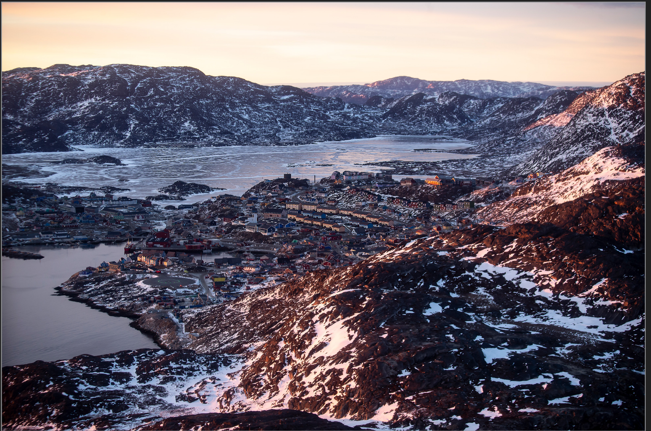
Sydgrønland, januar 2018