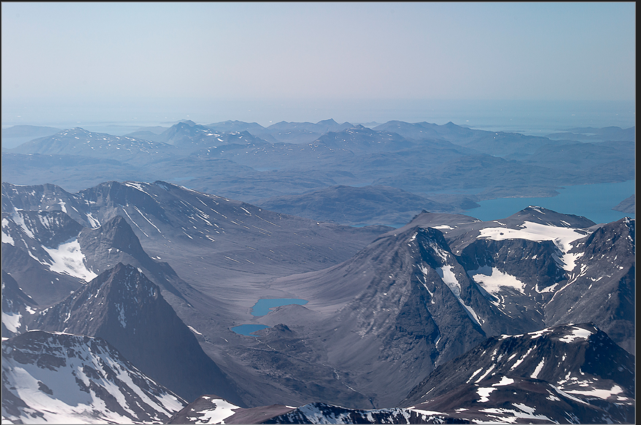
Sydgrønland, juli 2017