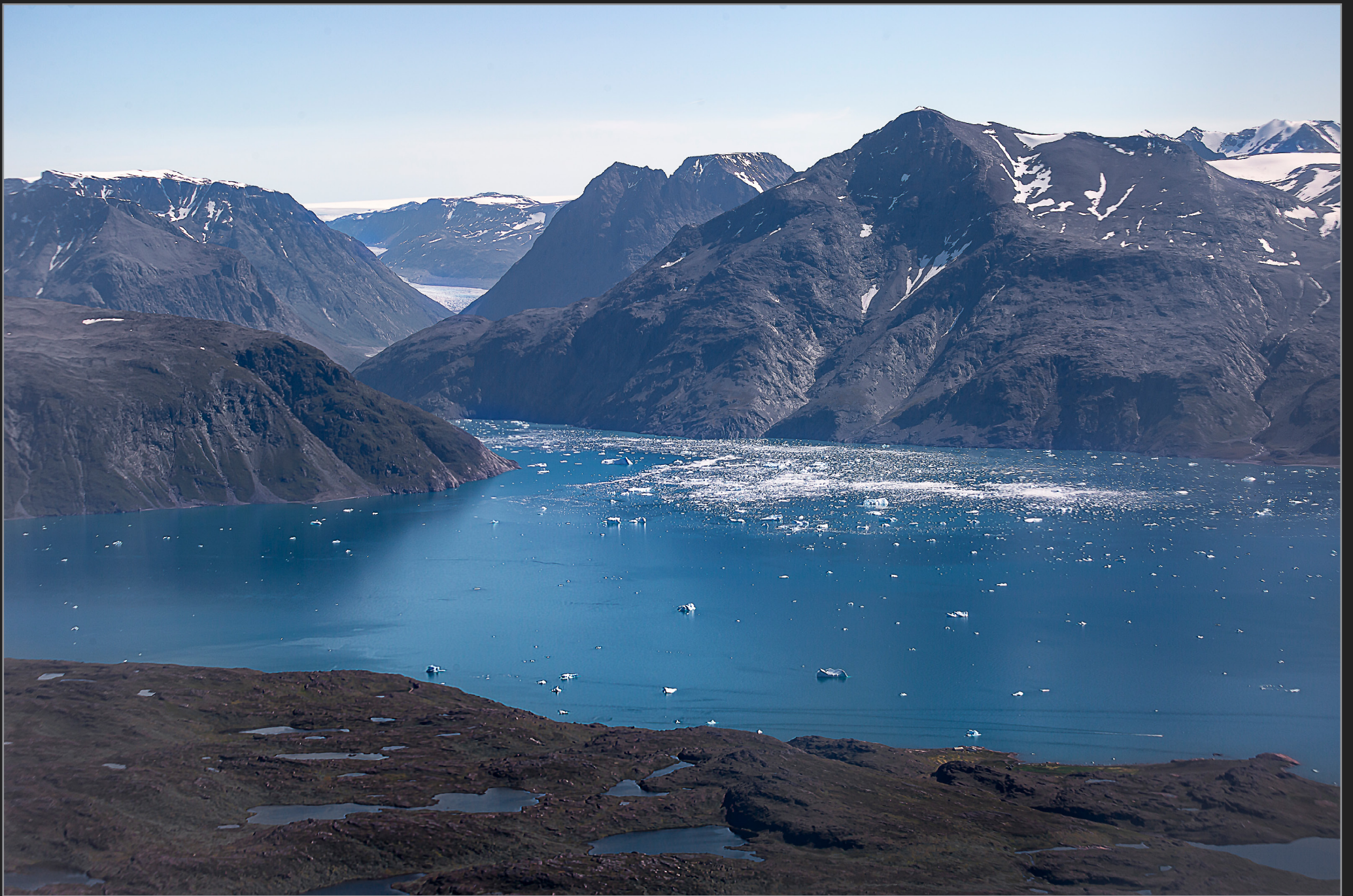
Sydgrønland, juli 2017