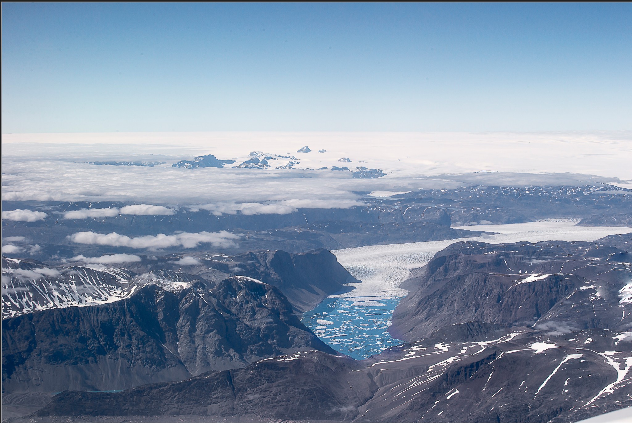
Sydgrønland, juli 2017