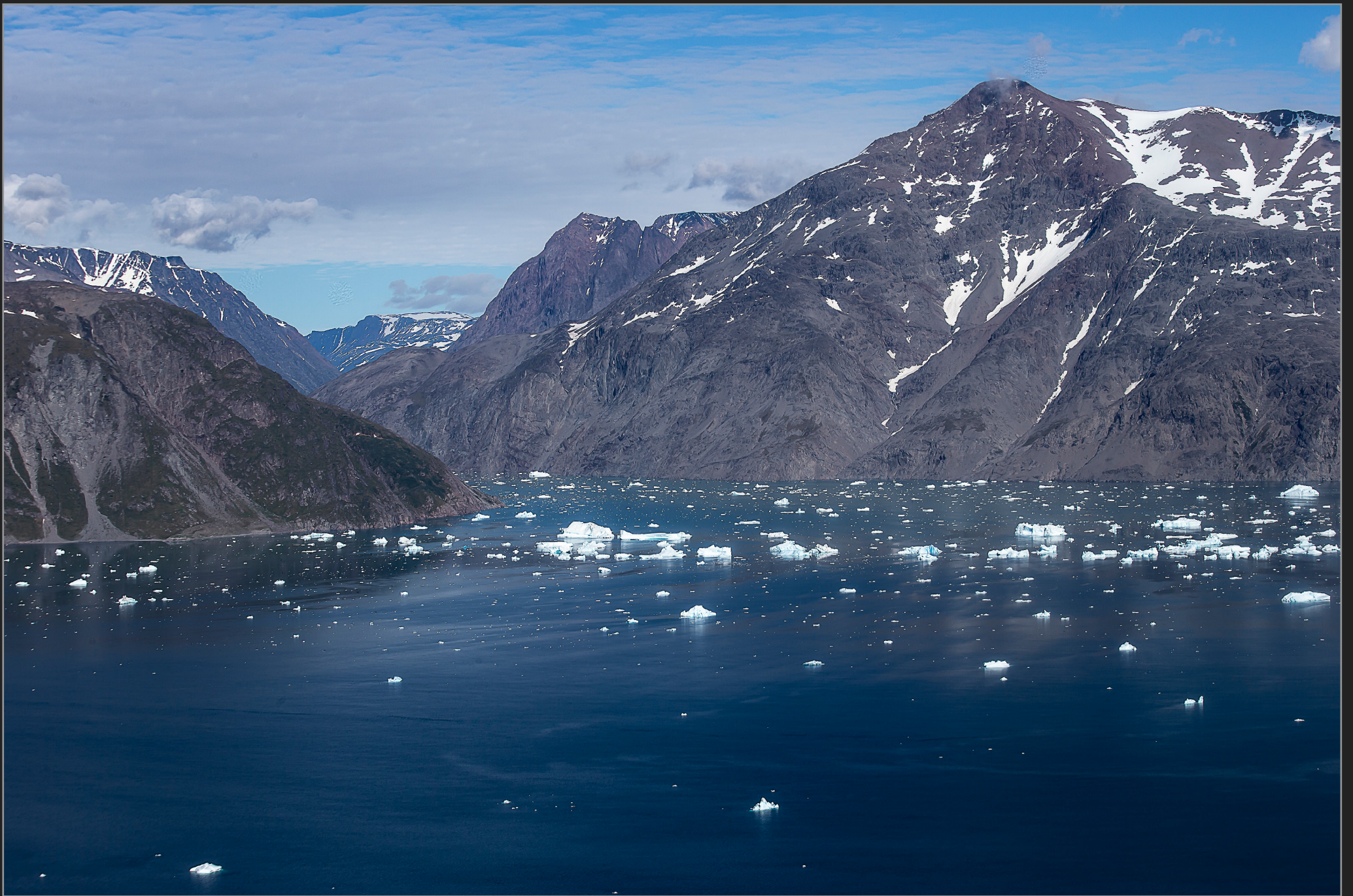
Sydgrønland, juli 2015