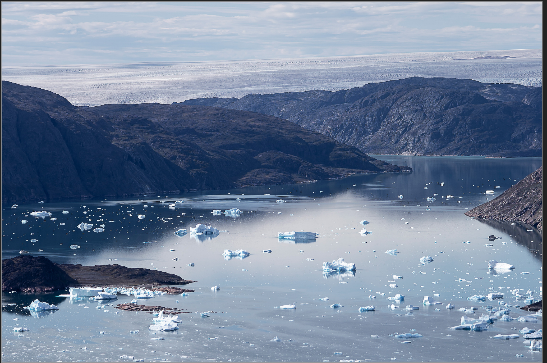
Sydgrønland, august 2016