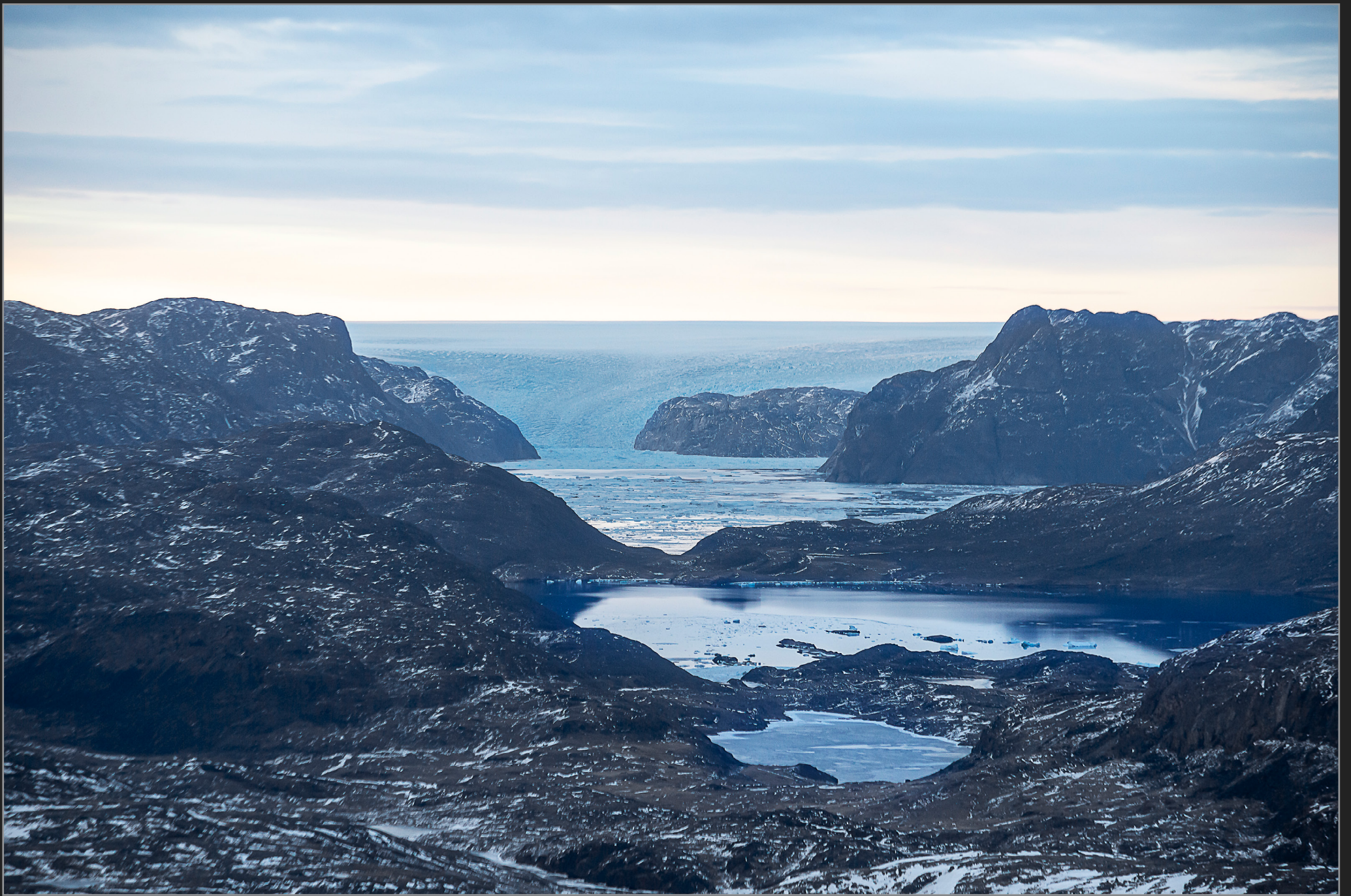
Sydgrønland, januar 2018