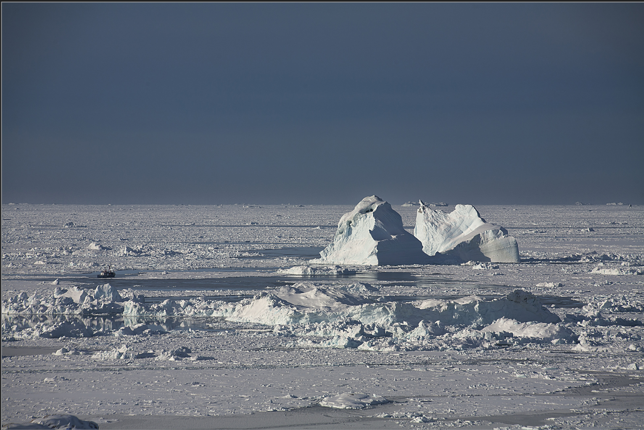
Ilulissat, marts 2012