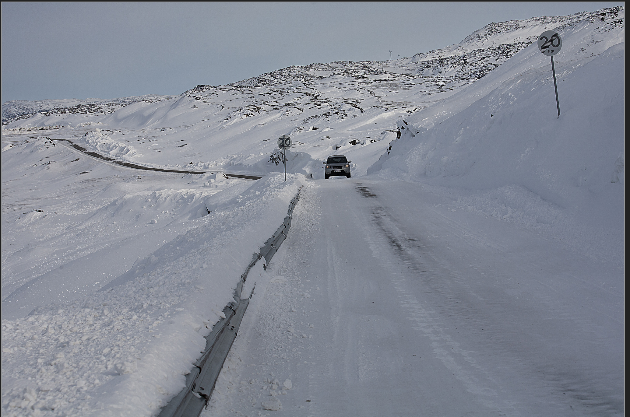
Ilulissat, marts 2012