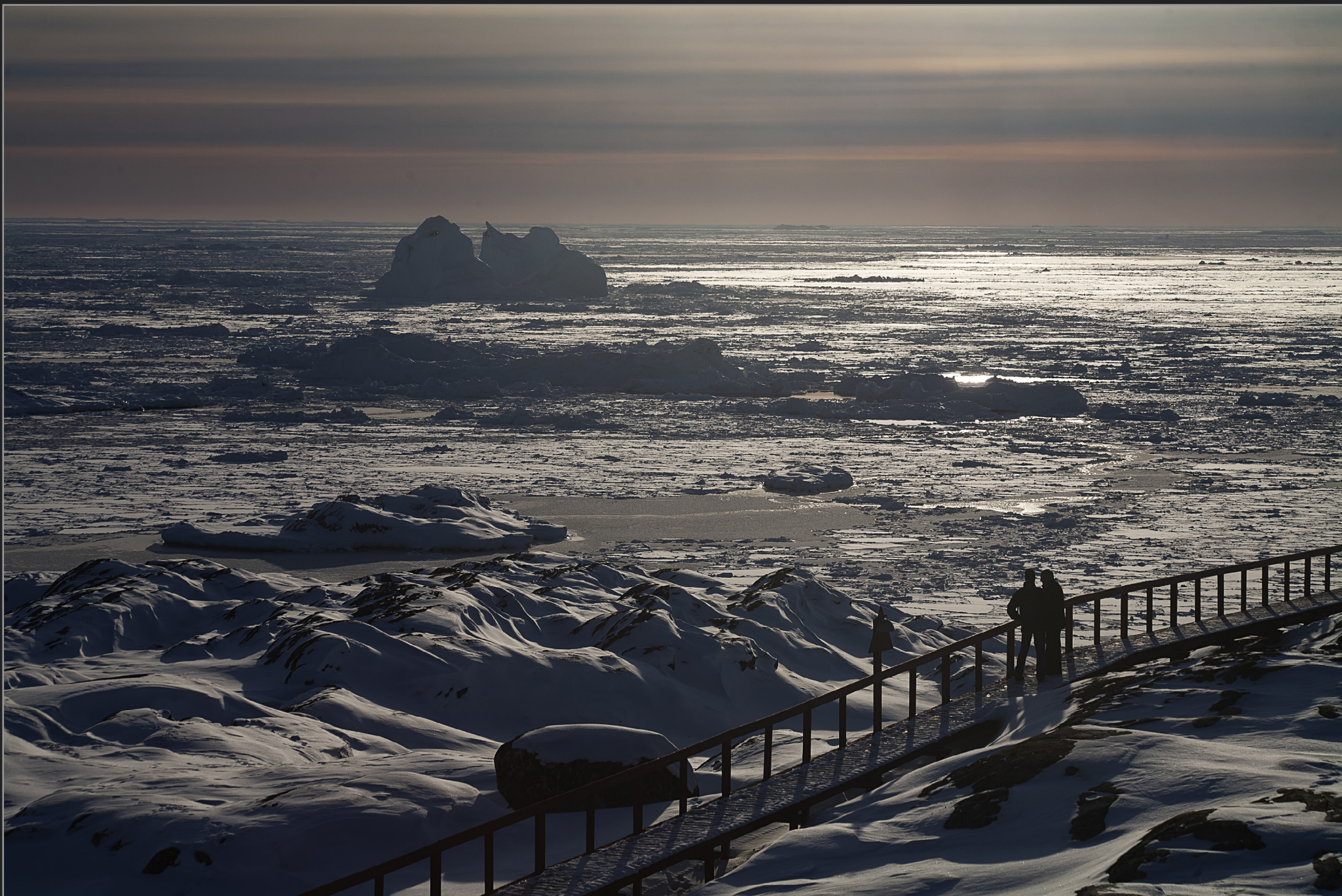
Ilulissat, marts 2012