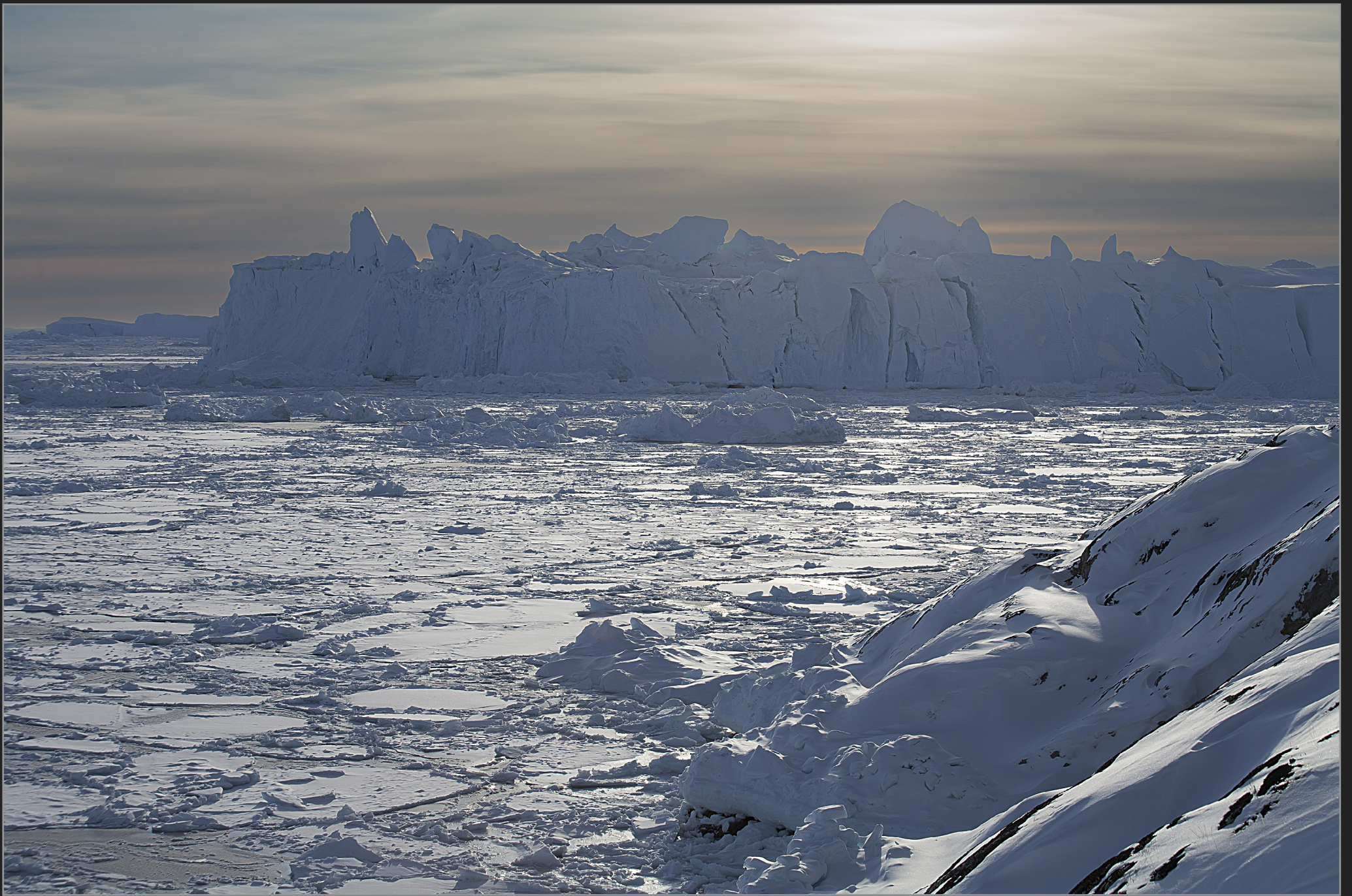
Ilulissat, marts 2012