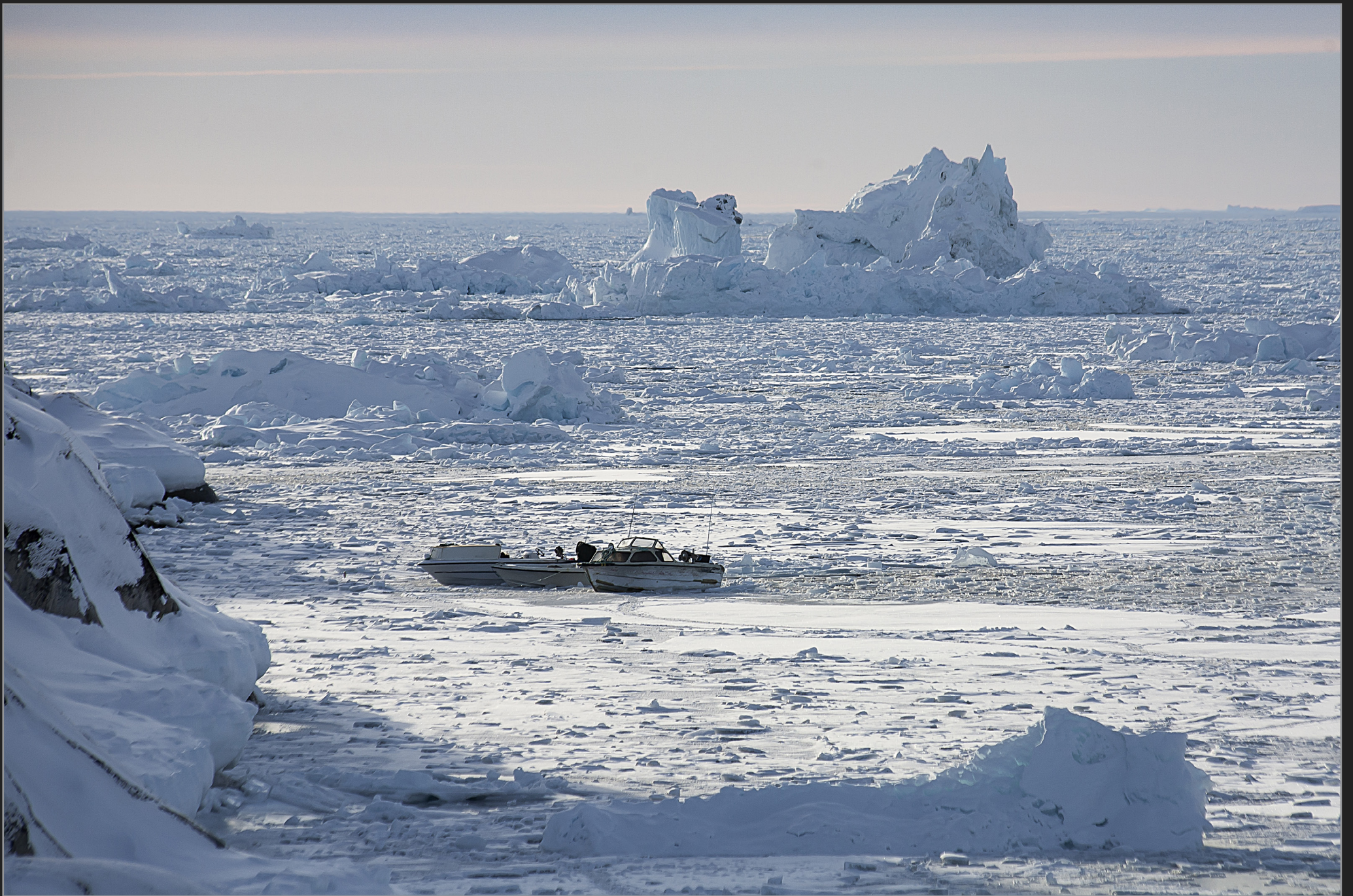
Ilulissat, marts 2012