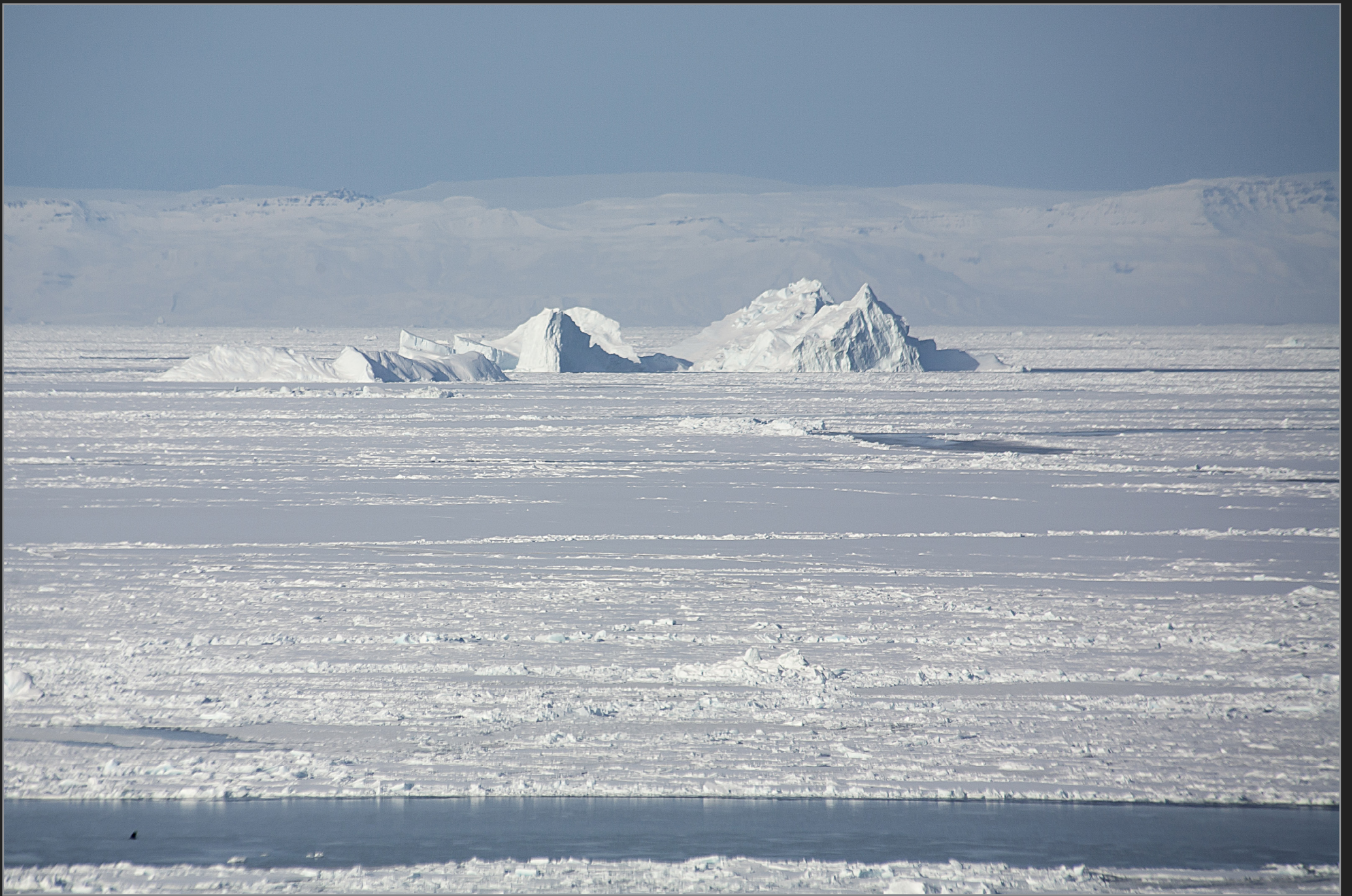
Ilulissat, marts 2012