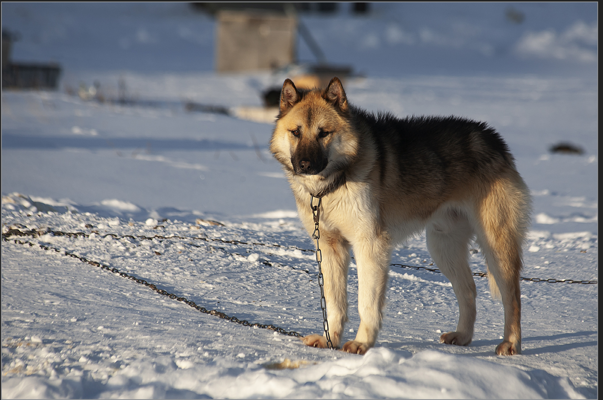
Ilulissat, marts 2012