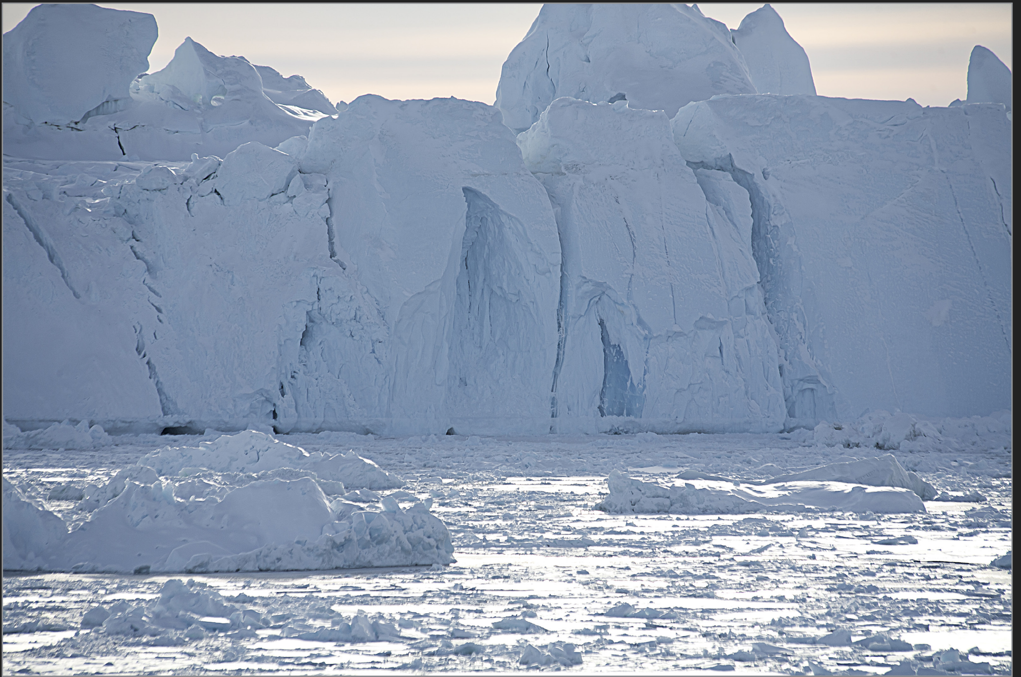
Ilulissat, marts 2012