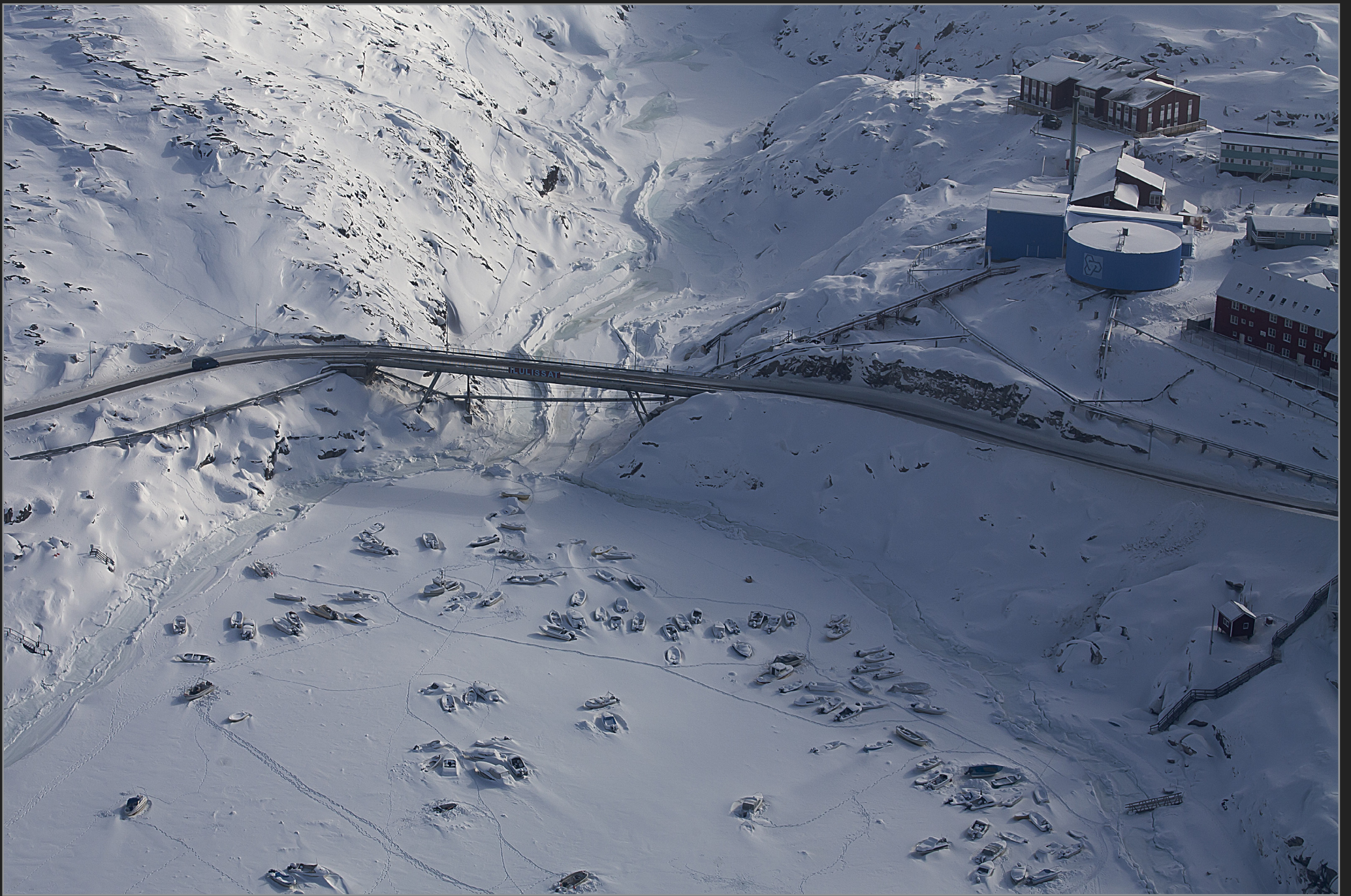
Ilulissat, marts 2012