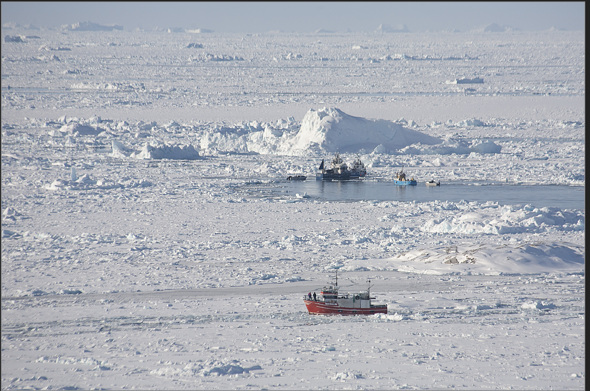
Ilulissat, marts 2012