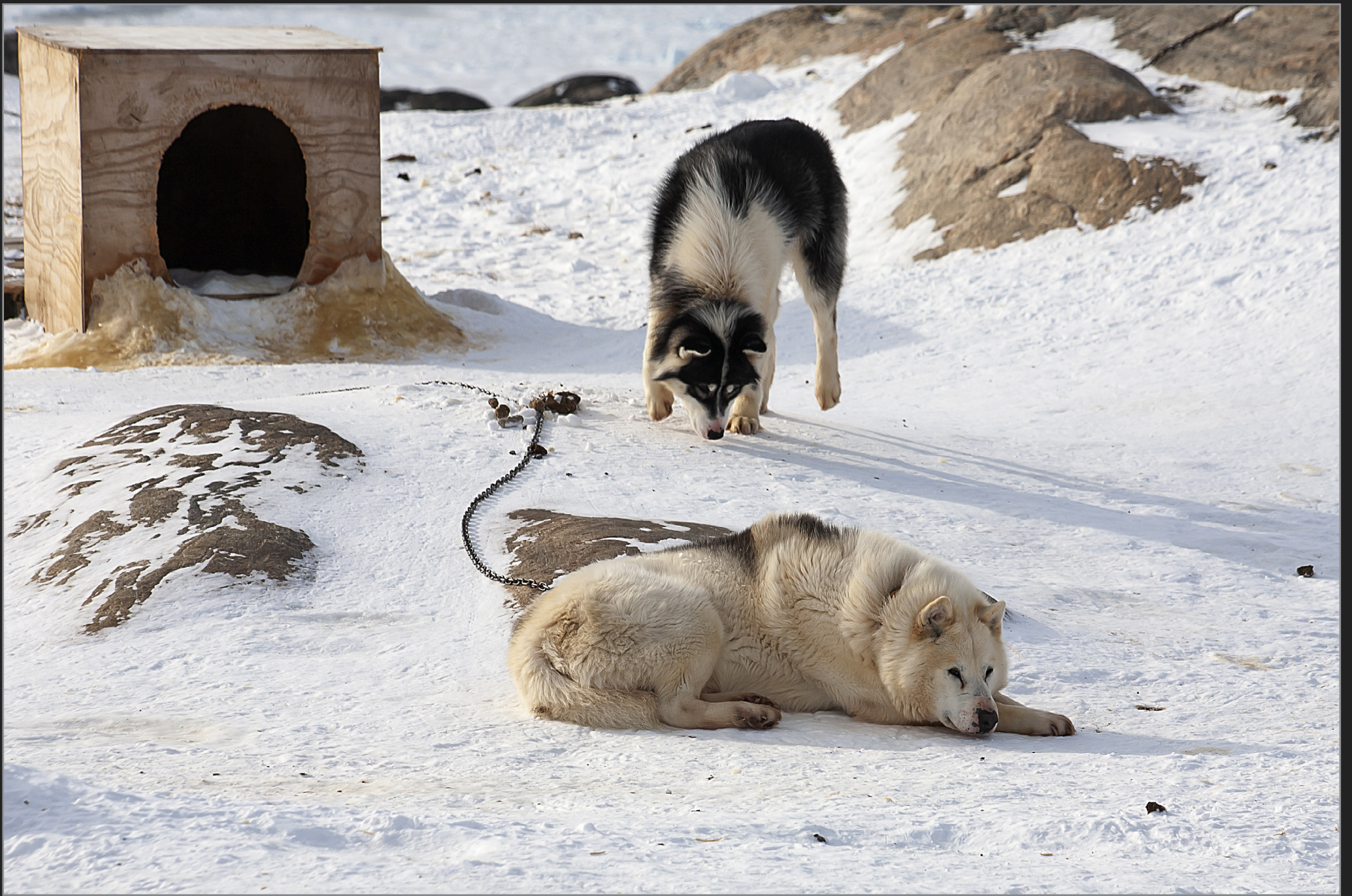
Ilulissat, marts 2012