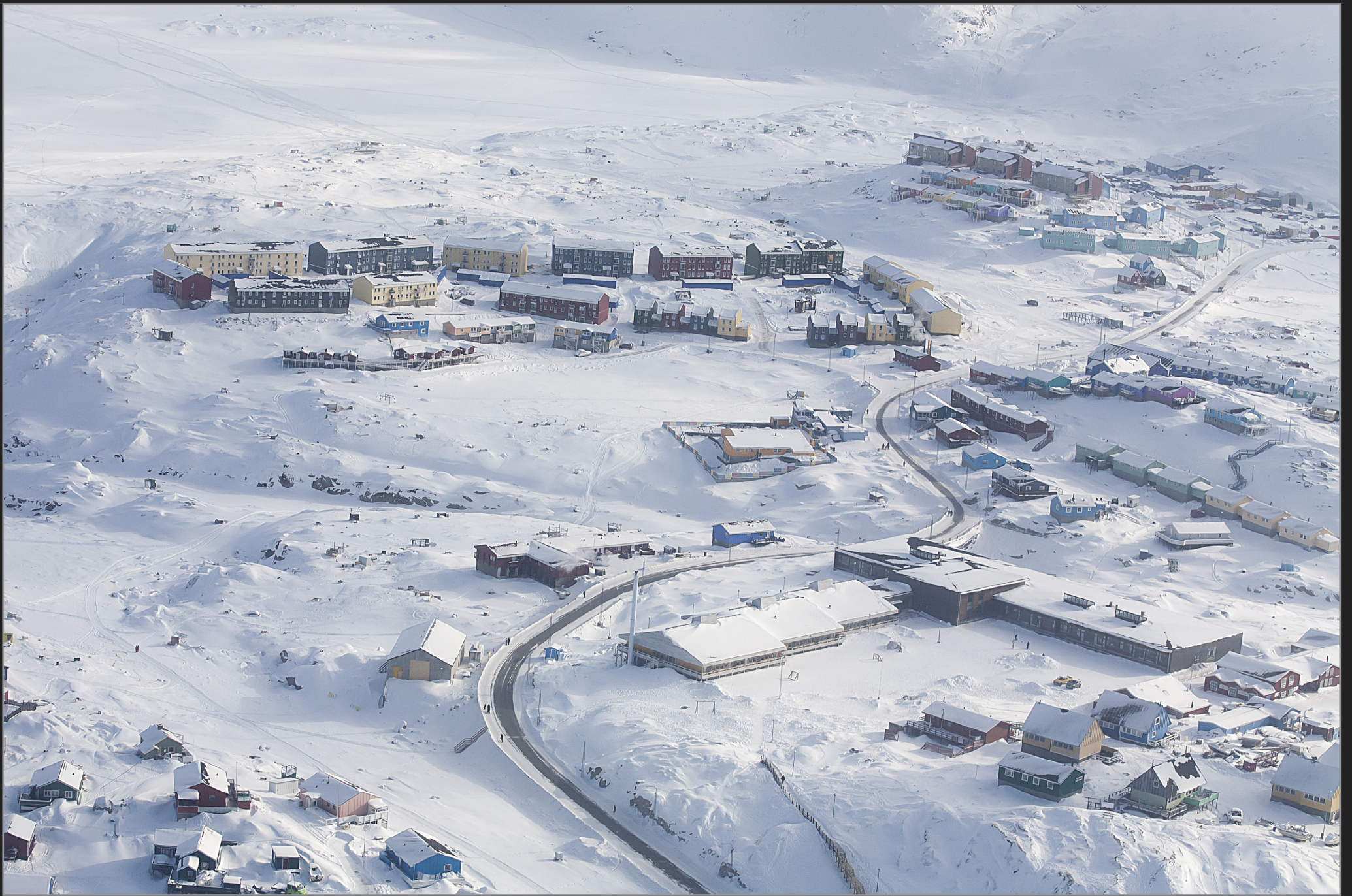
Ilulissat, marts 2012