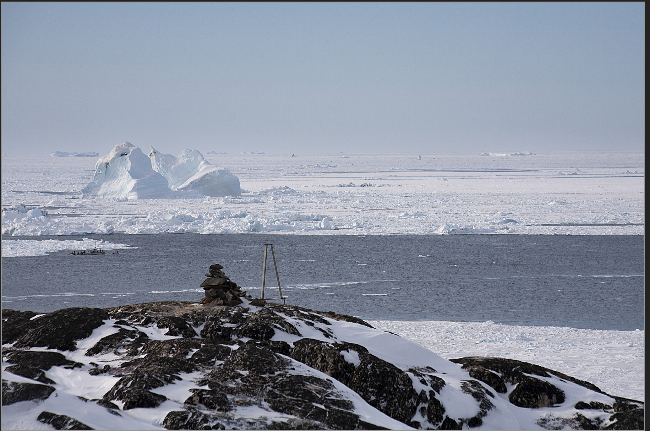
Ilulissat, marts 2012