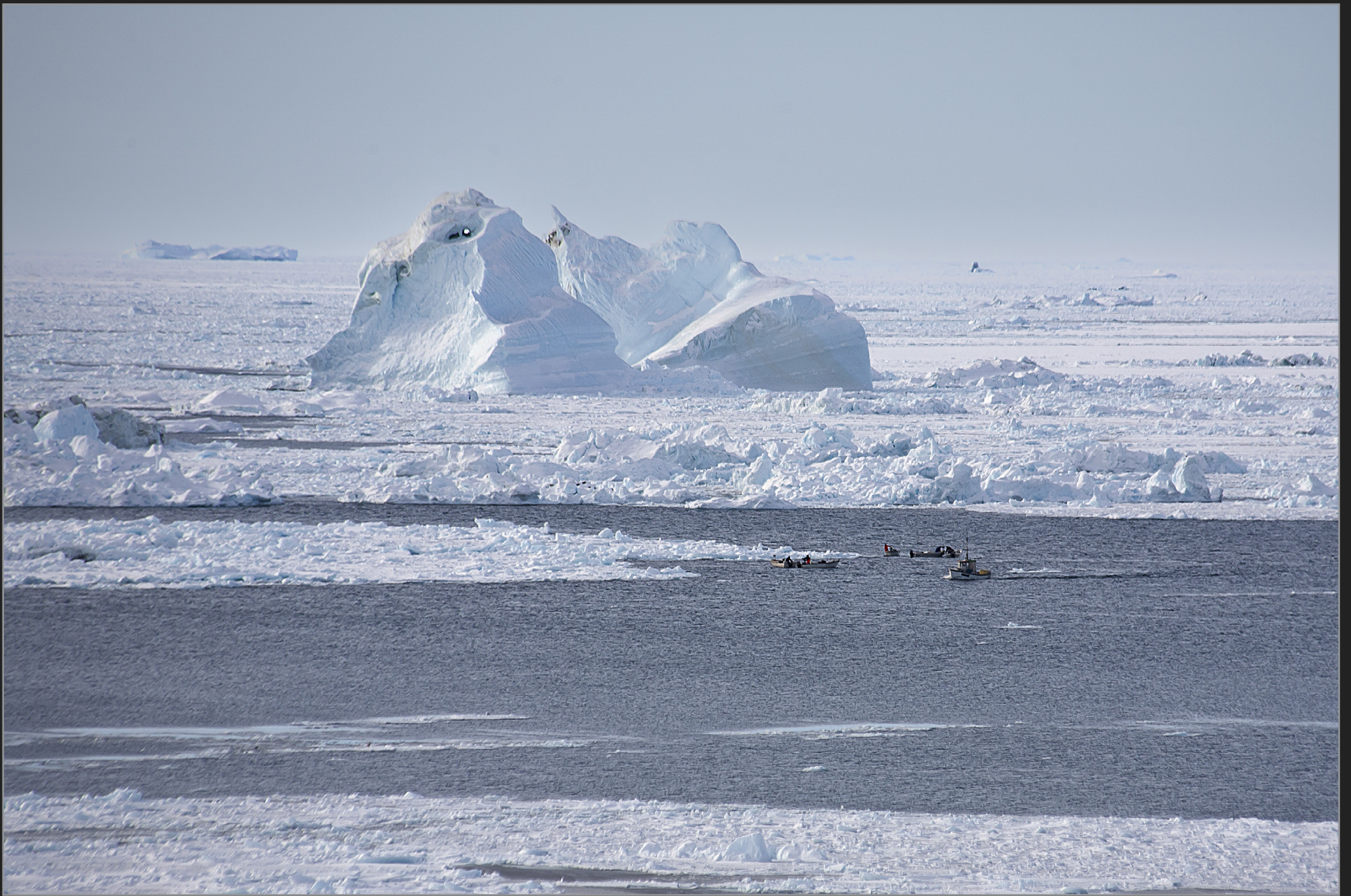
Ilulissat, marts 2012