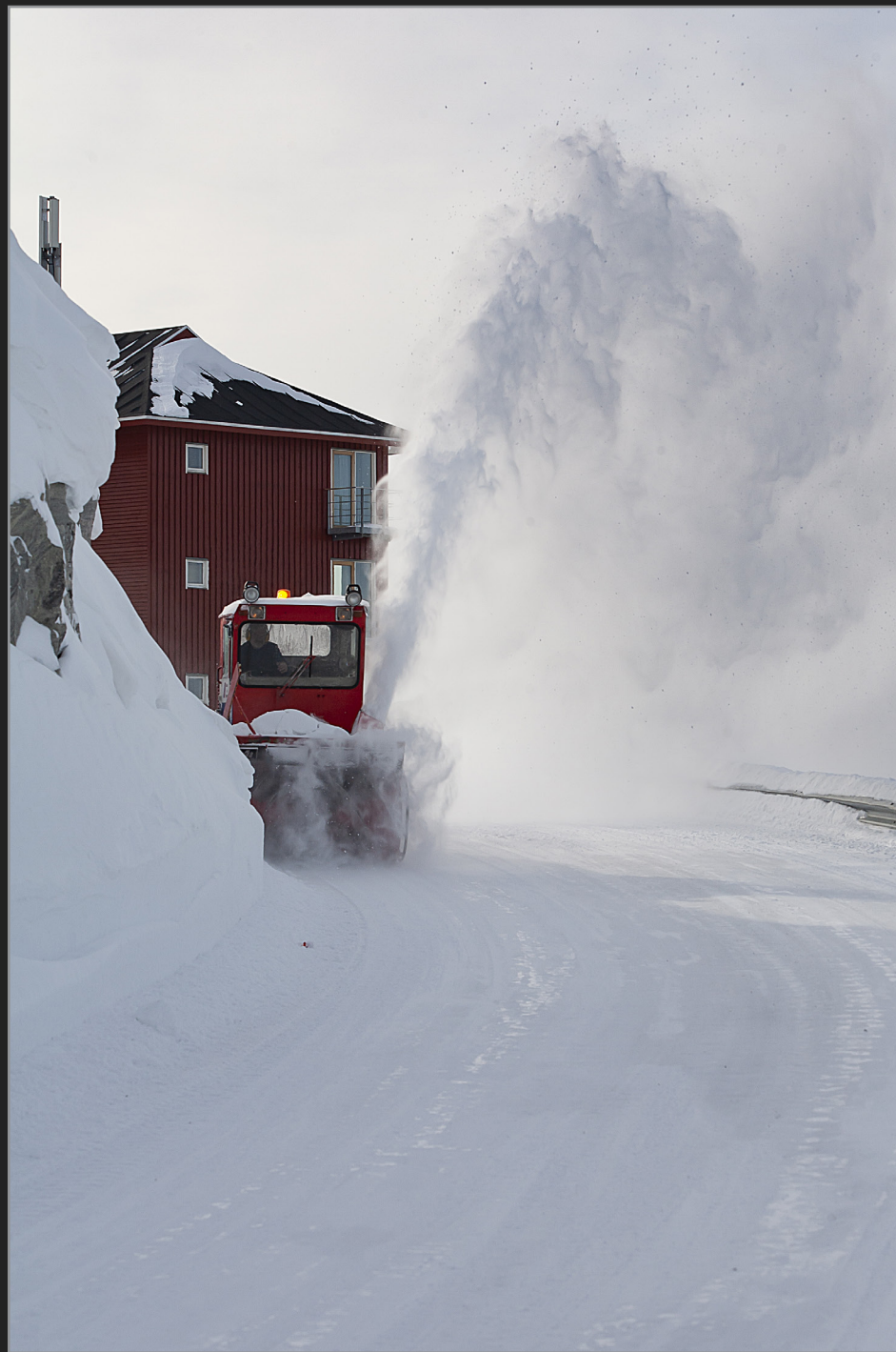
Ilulissat, marts 2012