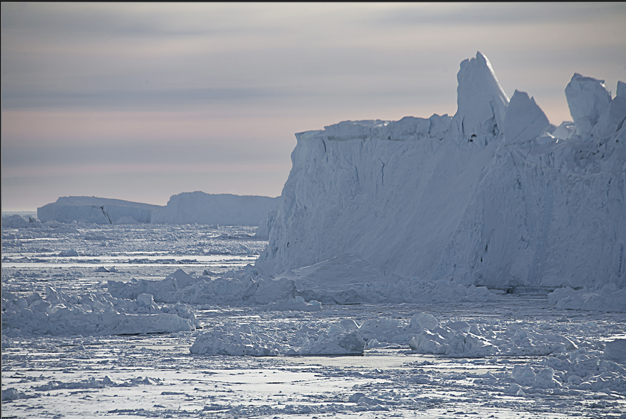
Ilulissat, marts 2012