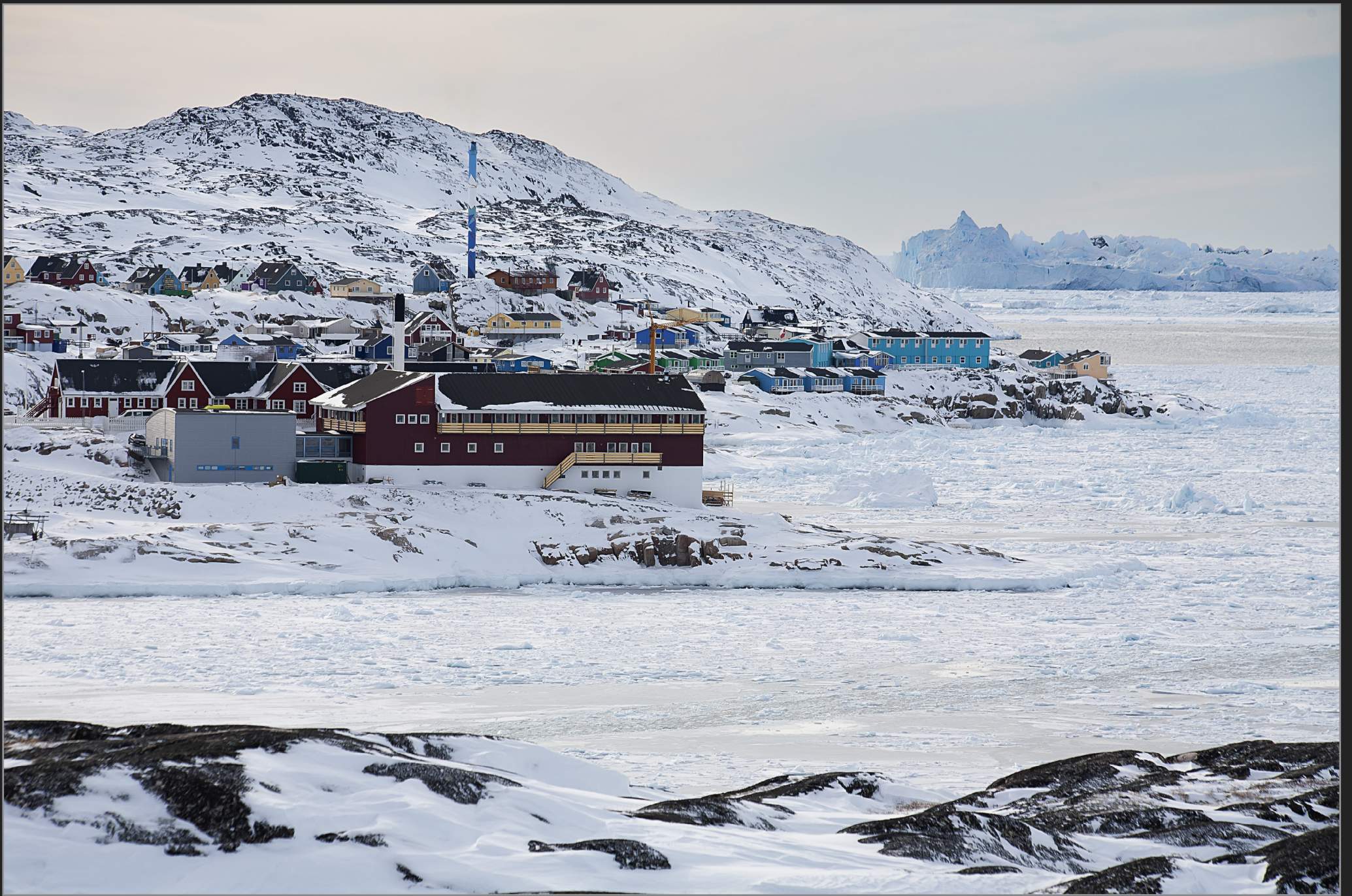
Ilulissat, marts 2012