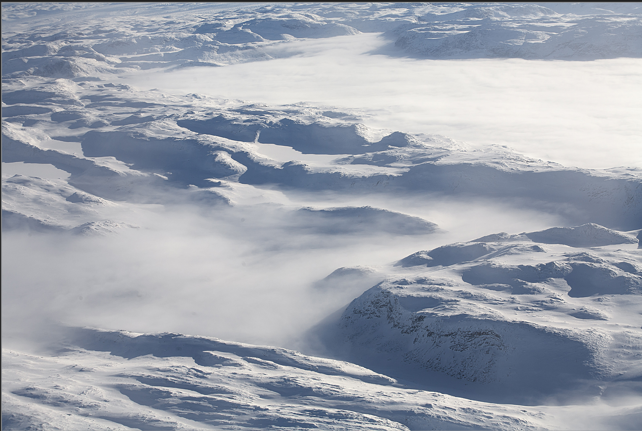
Ilulissat, marts 2012