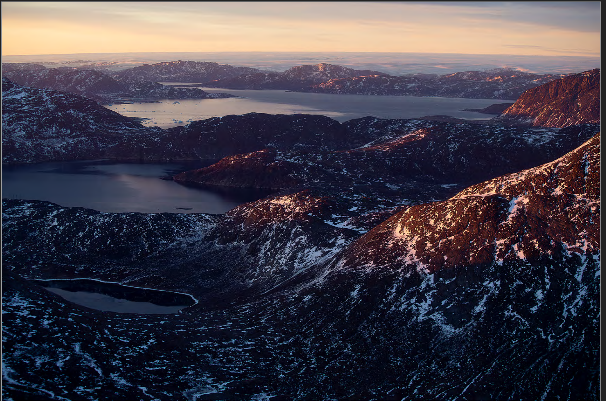
Vestgrønland, januar 2018