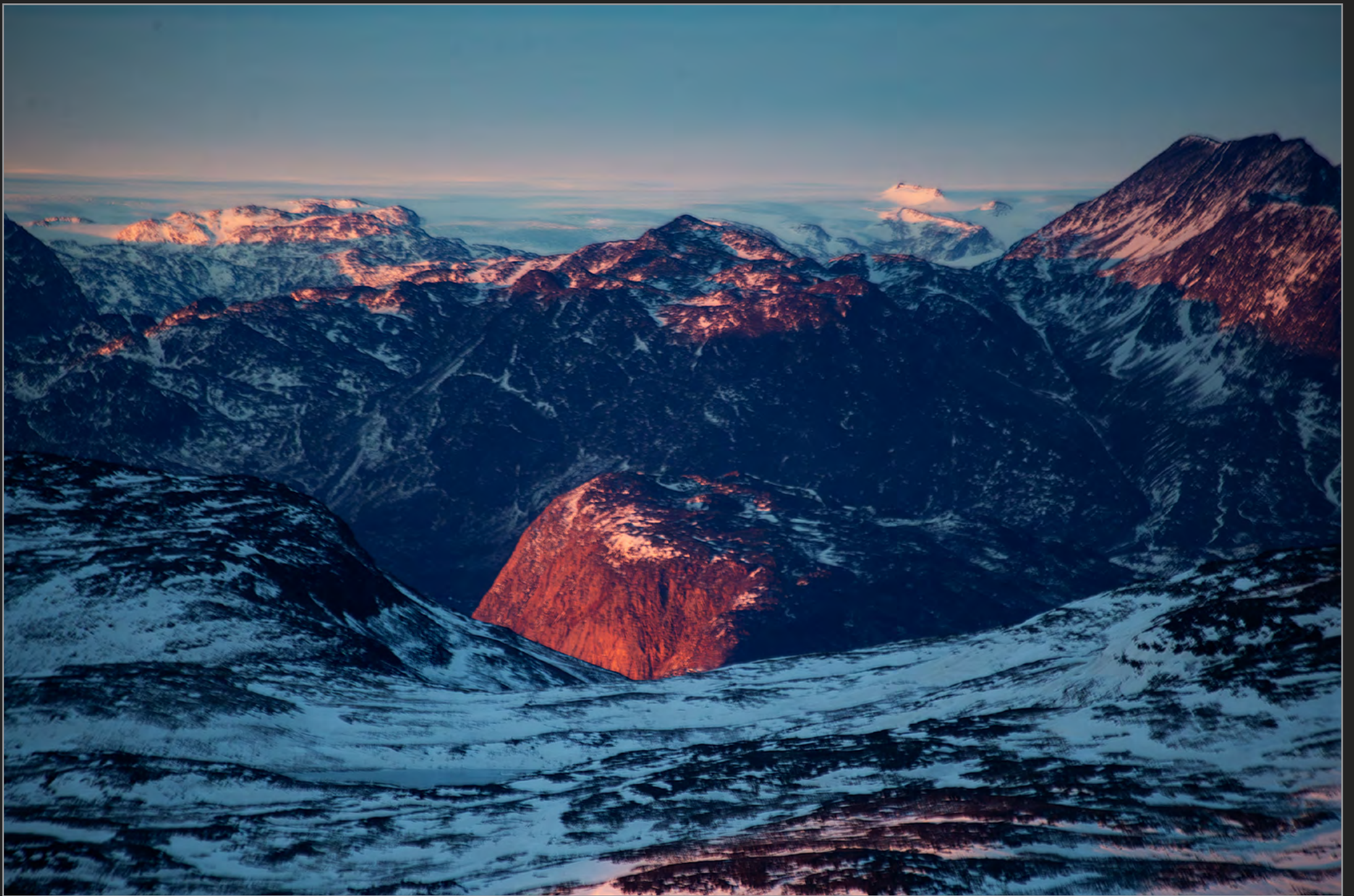
Vestgrønland, januar 2018