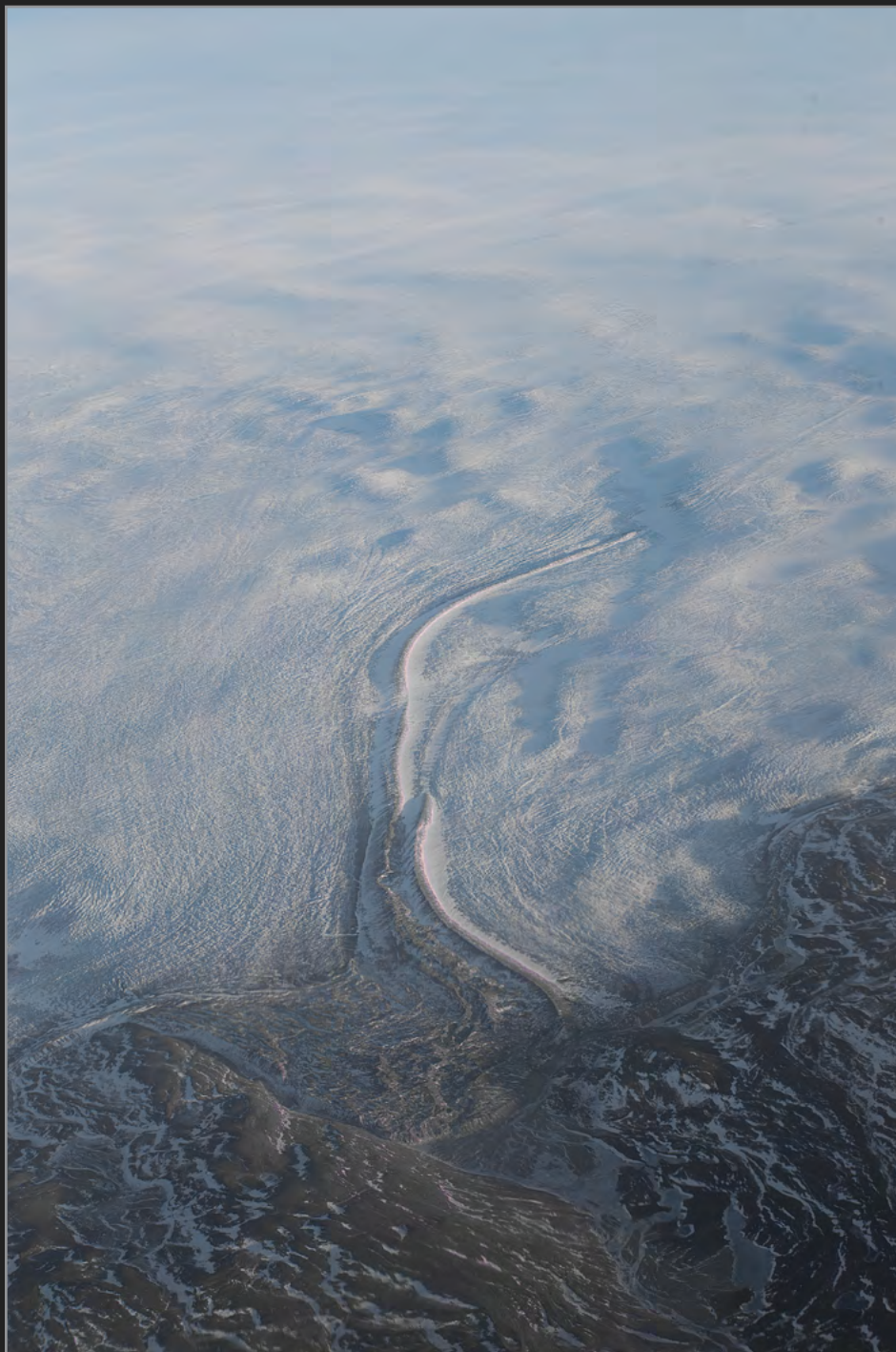
Vestgrønland, januar 2018