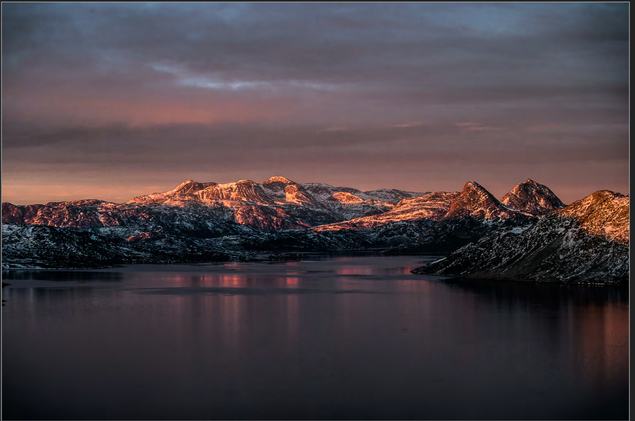
Vestgrønland, januar 2018