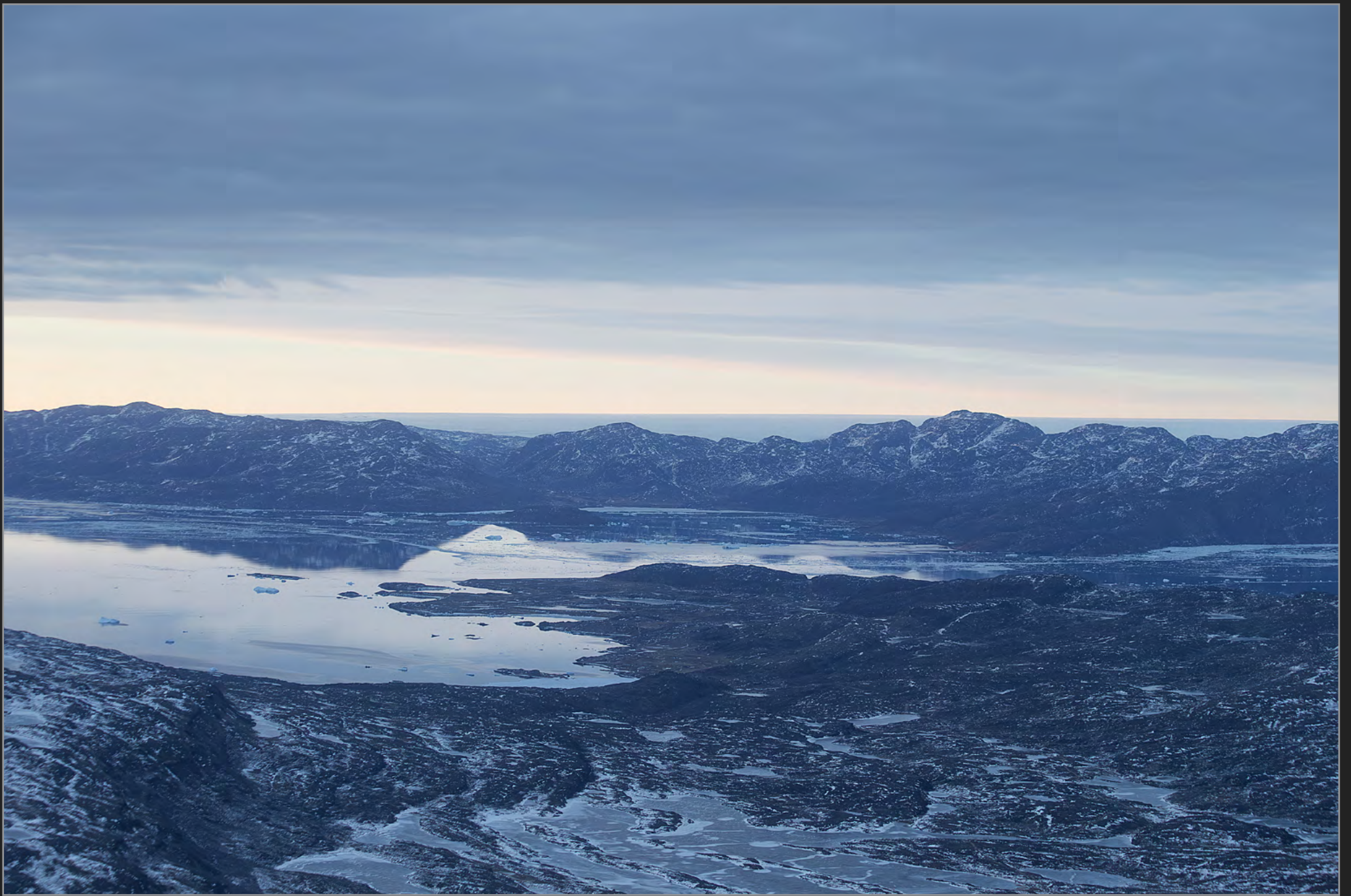
Vestgrønland, januar 2018