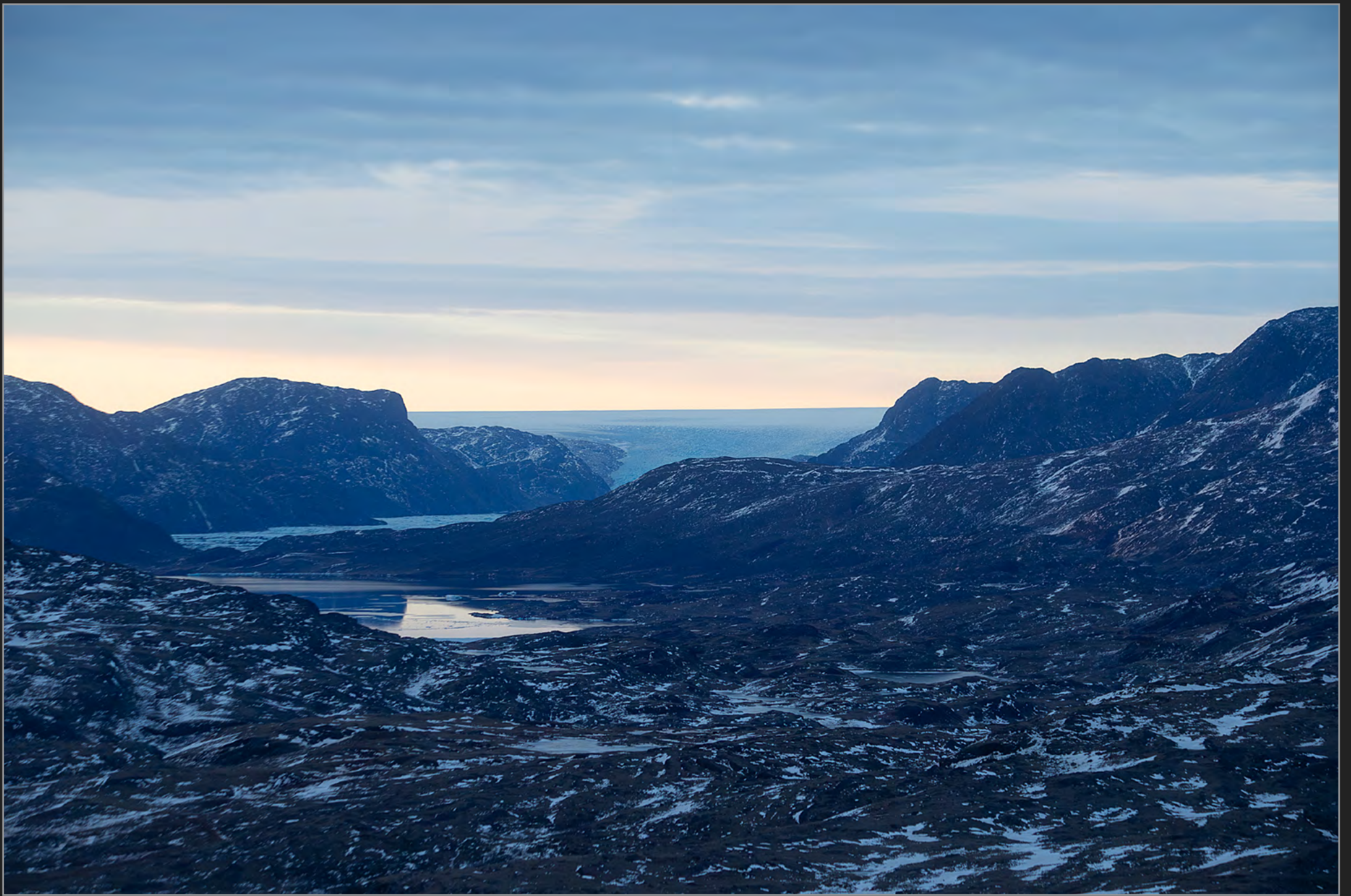
Vestgrønland, januar 2018