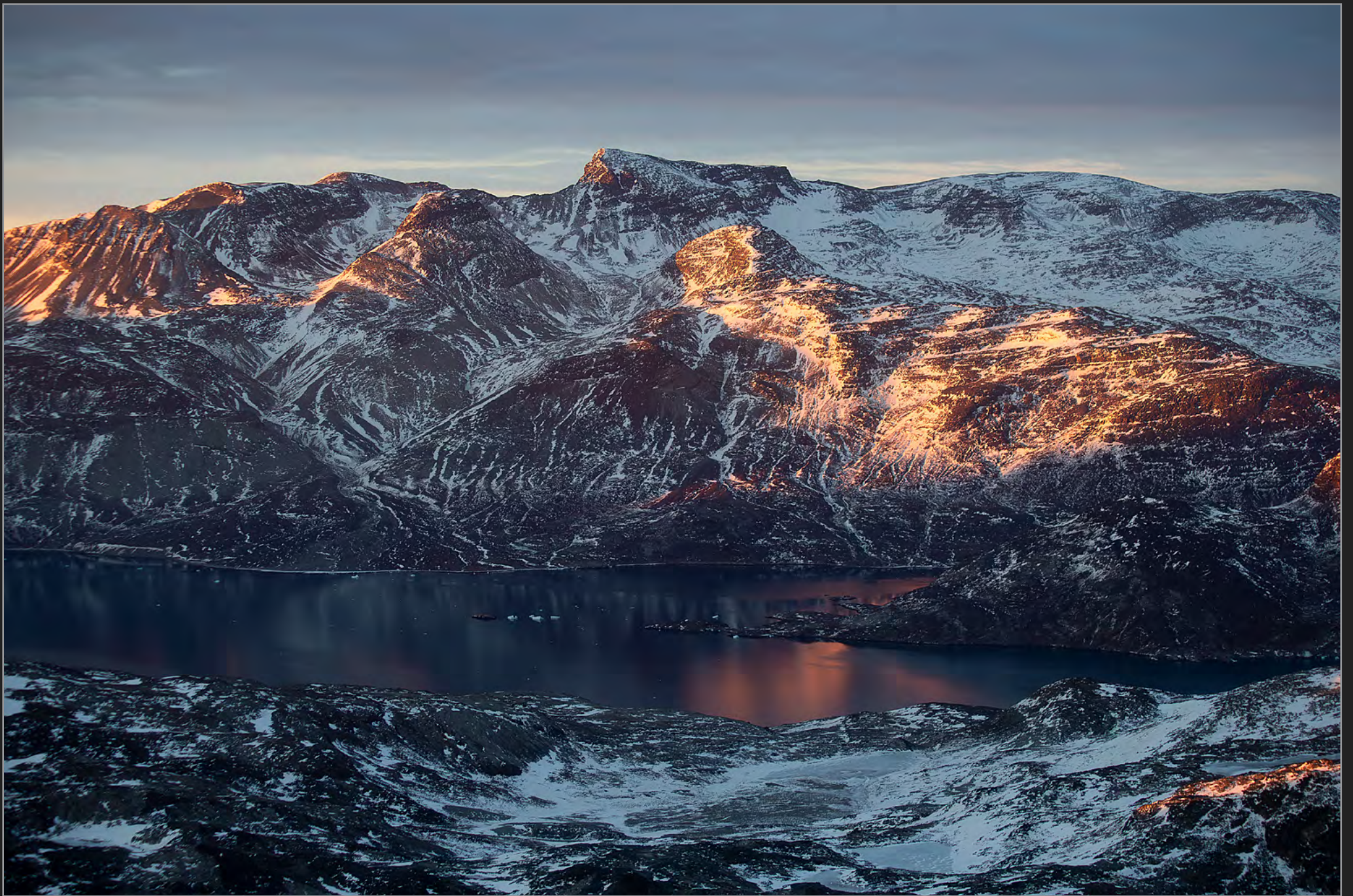
Vestgrønland, januar 2018