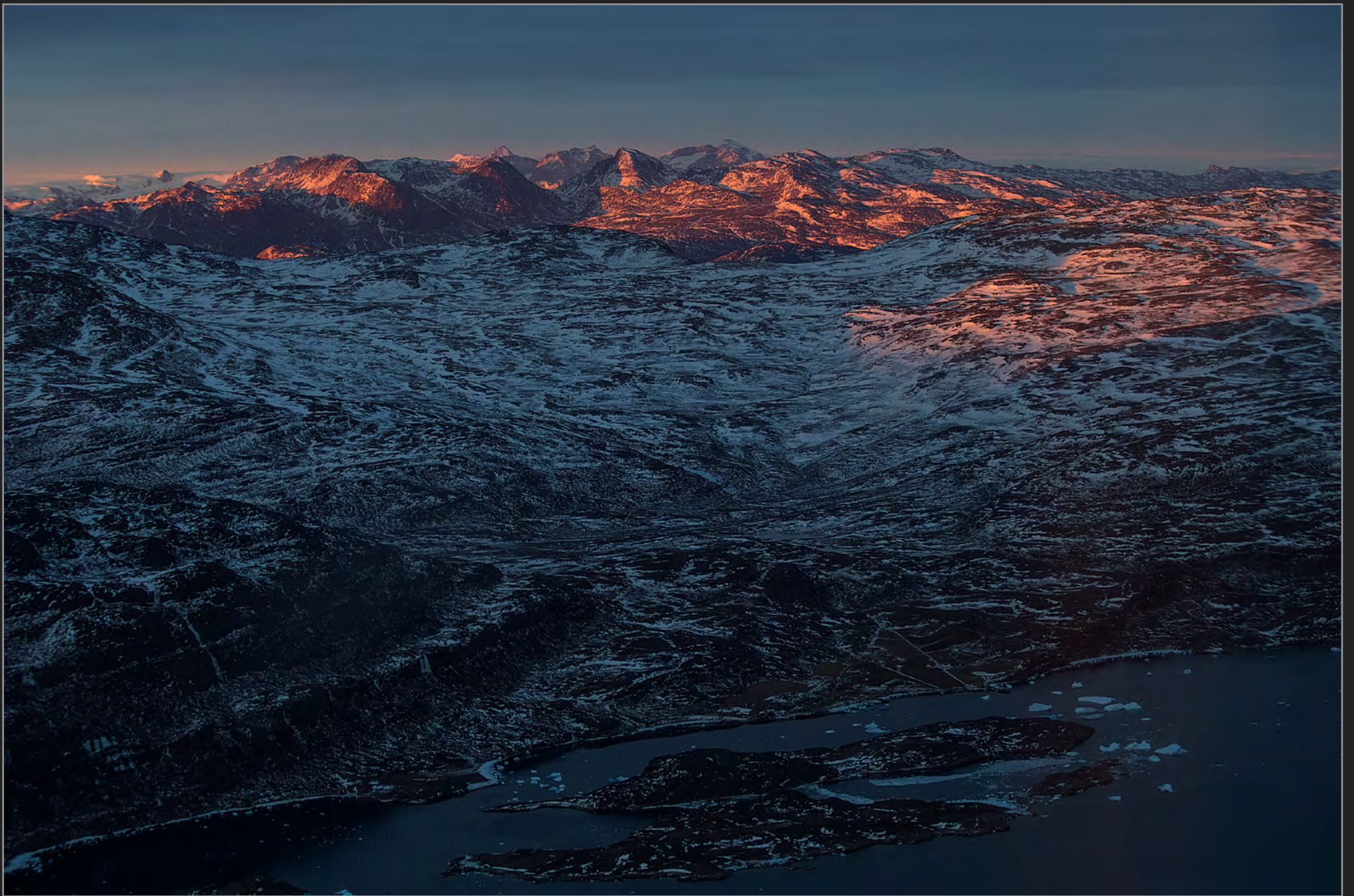
Vestgrønland, januar 2018