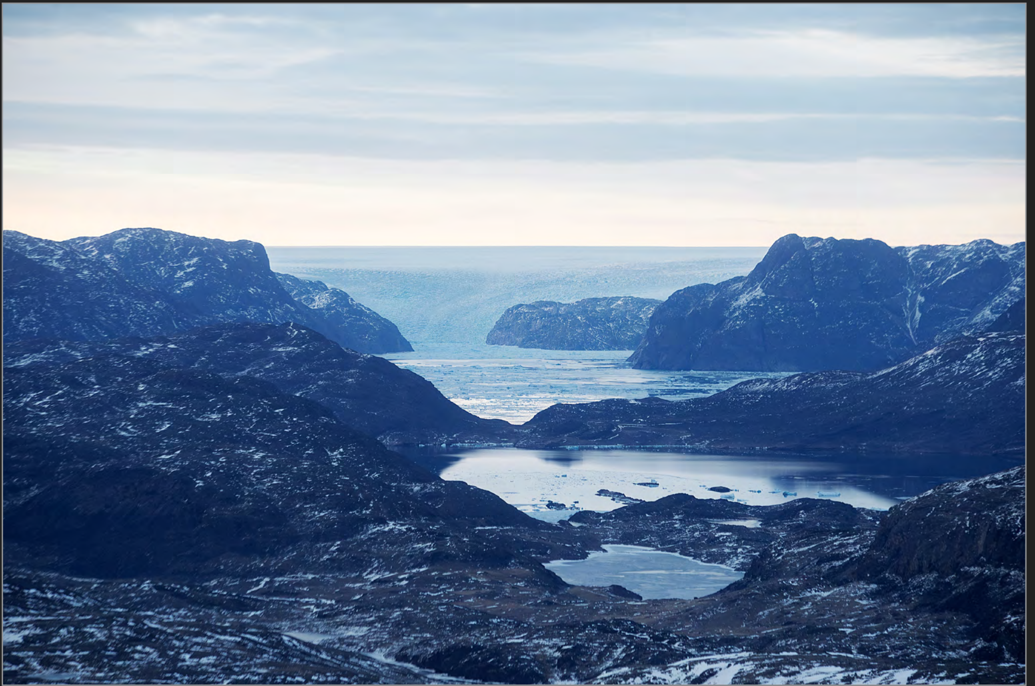
Vestgrønland, januar 2018