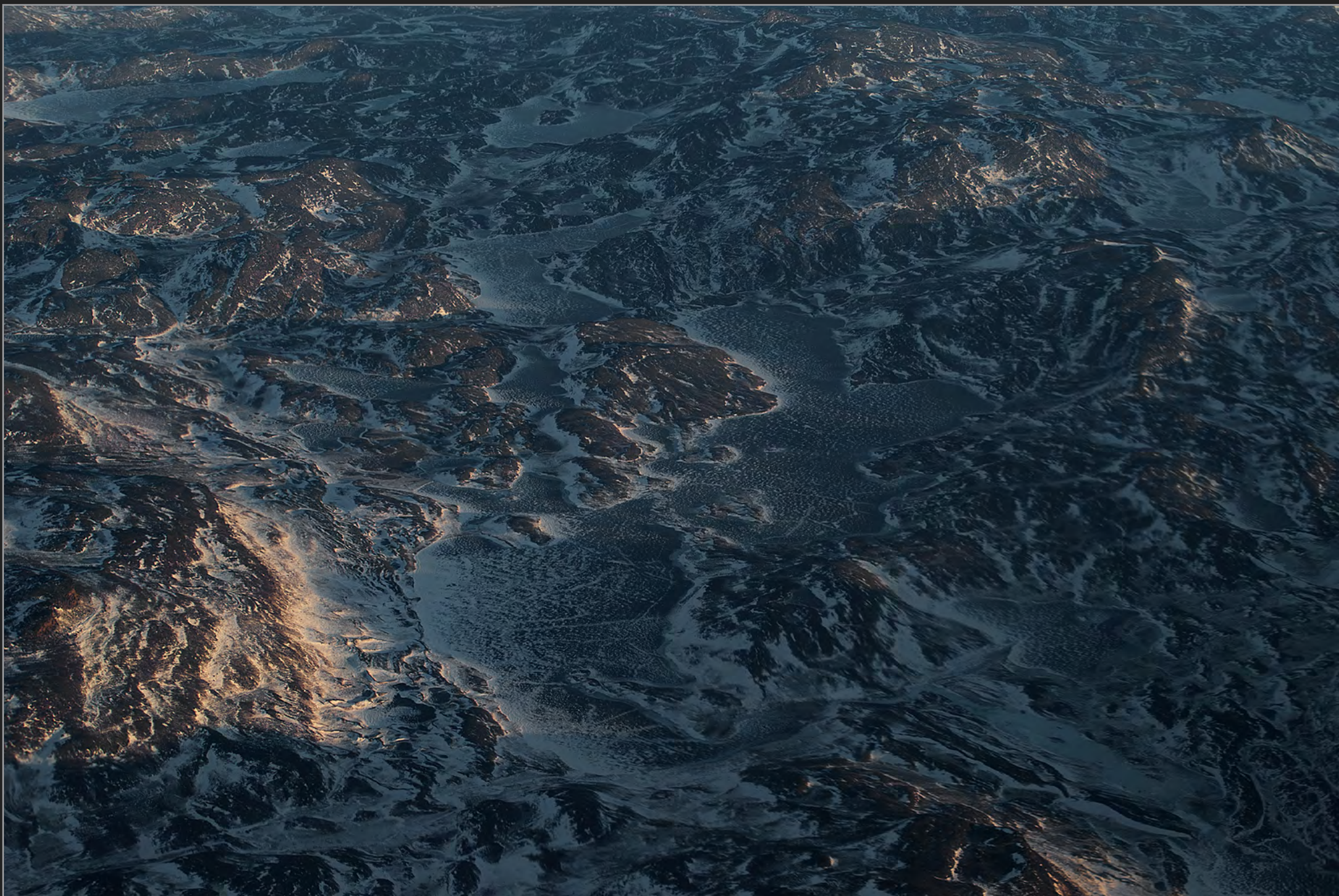
Vestgrønland, januar 2018