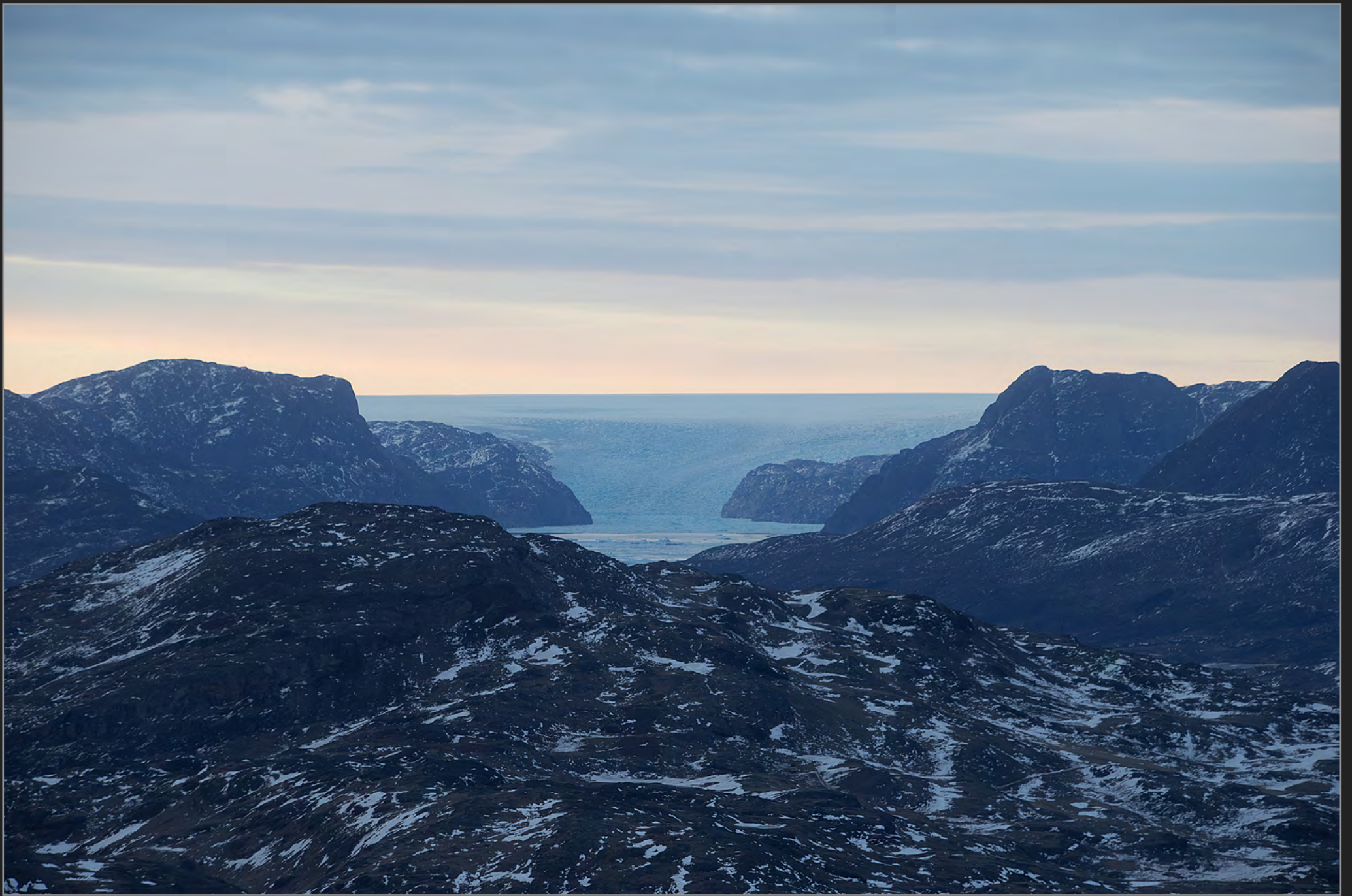
Vestgrønland, januar 2018