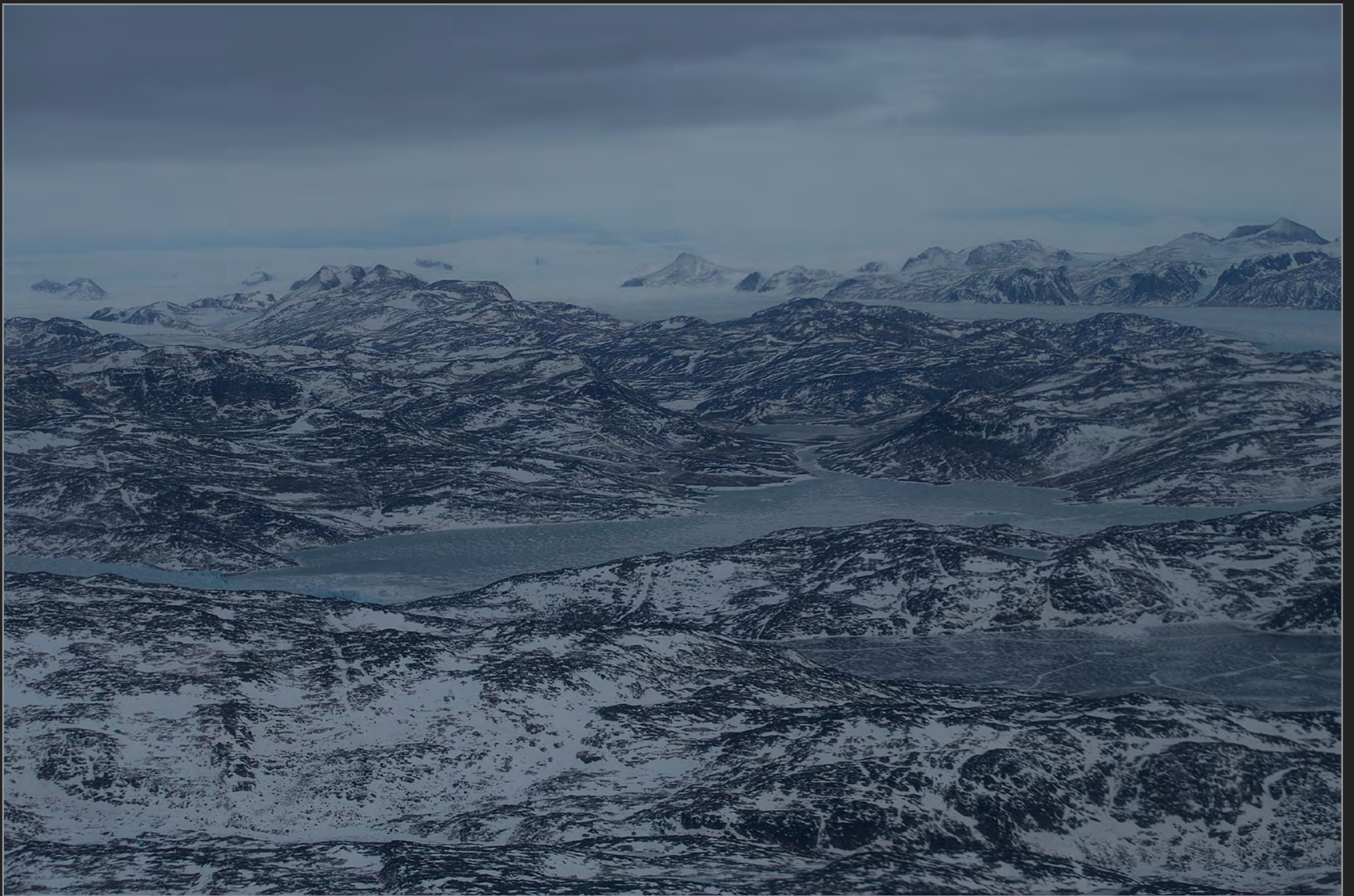
Vestgrønland, januar 2018