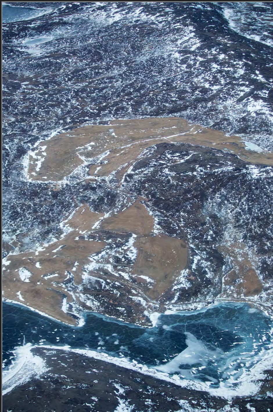
Vestgrønland, januar 2018