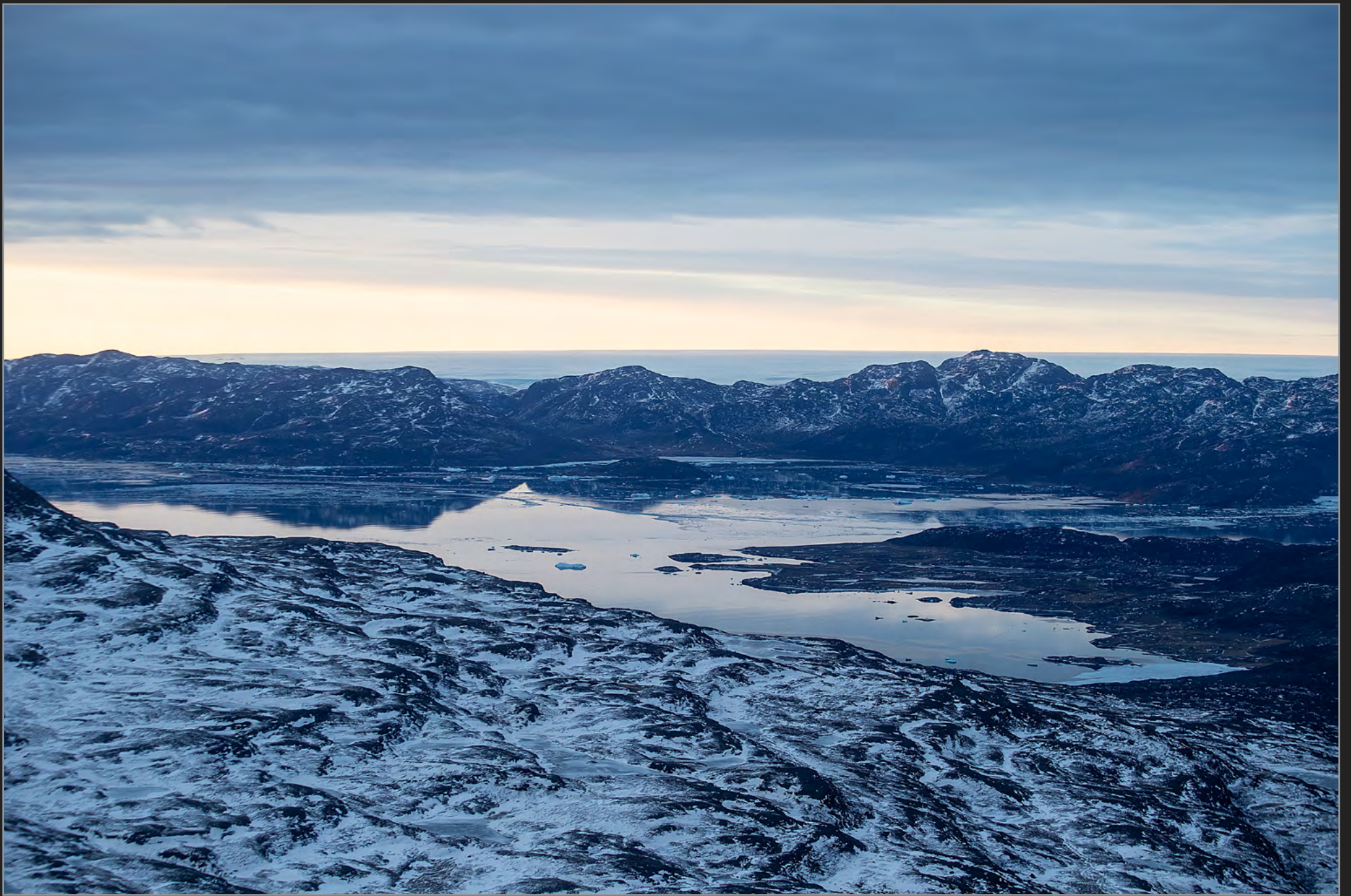
Vestgrønland, januar 2018