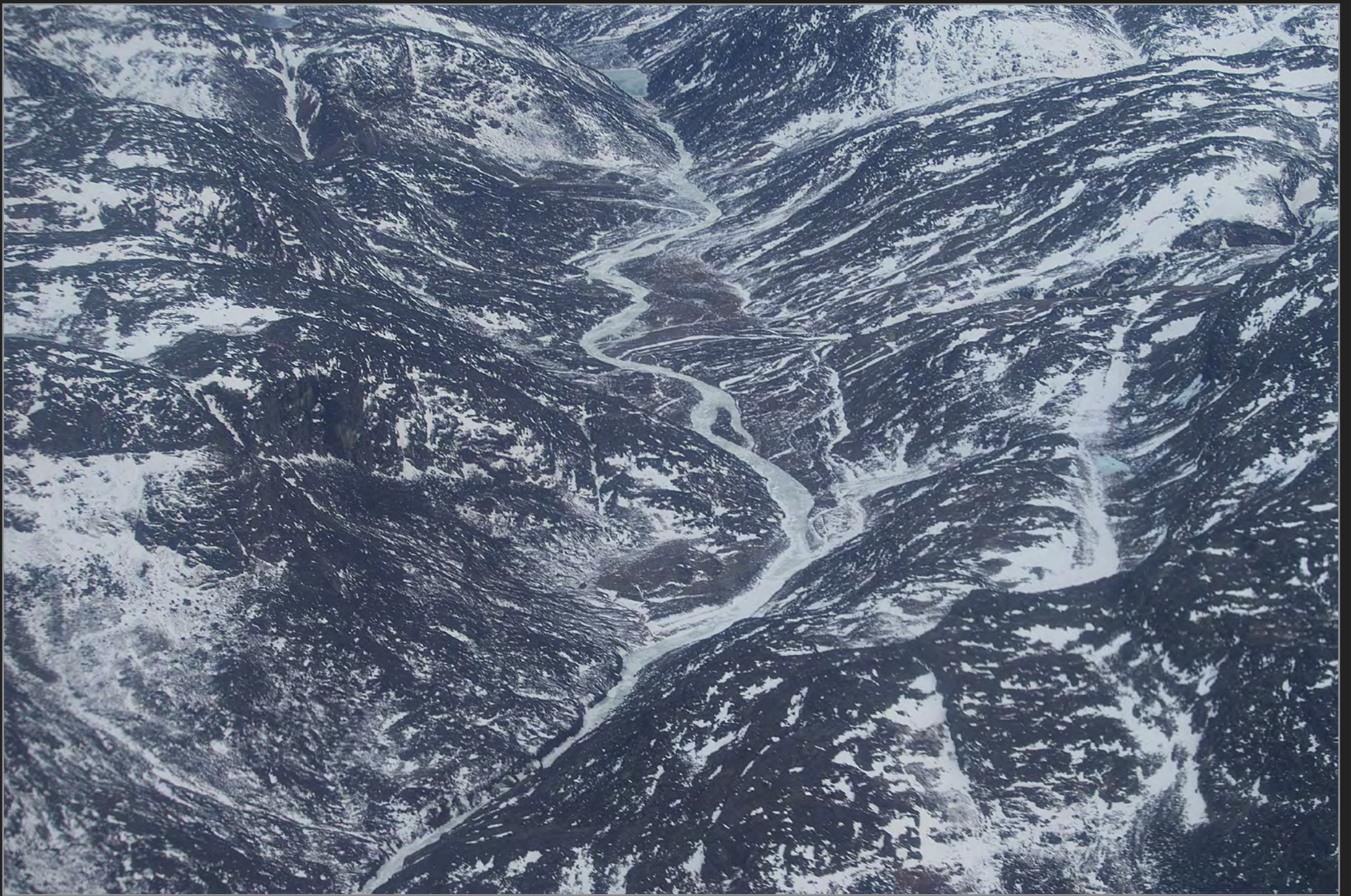
Vestgrønland, januar 2018