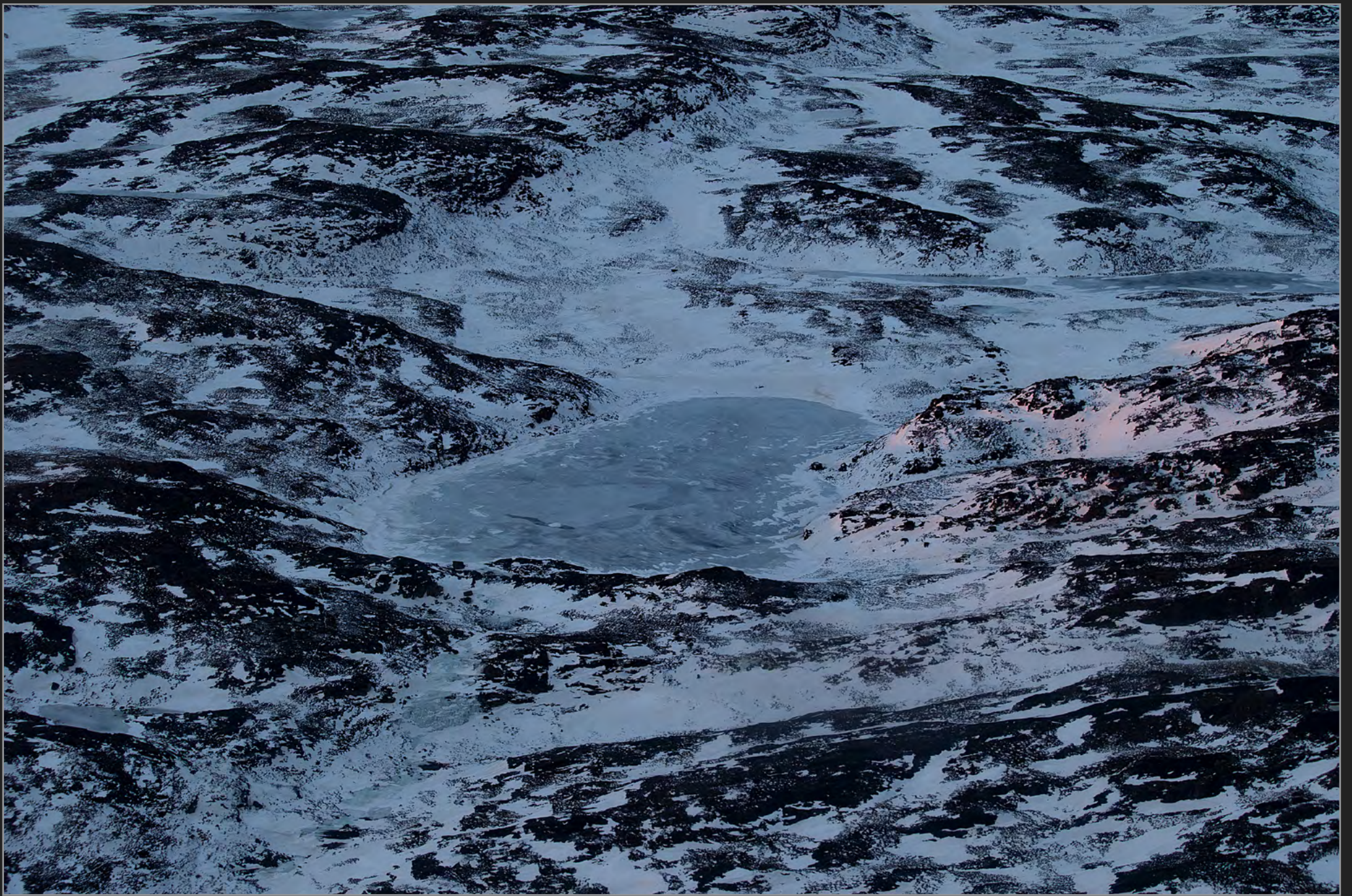
Vestgrønland, januar 2018