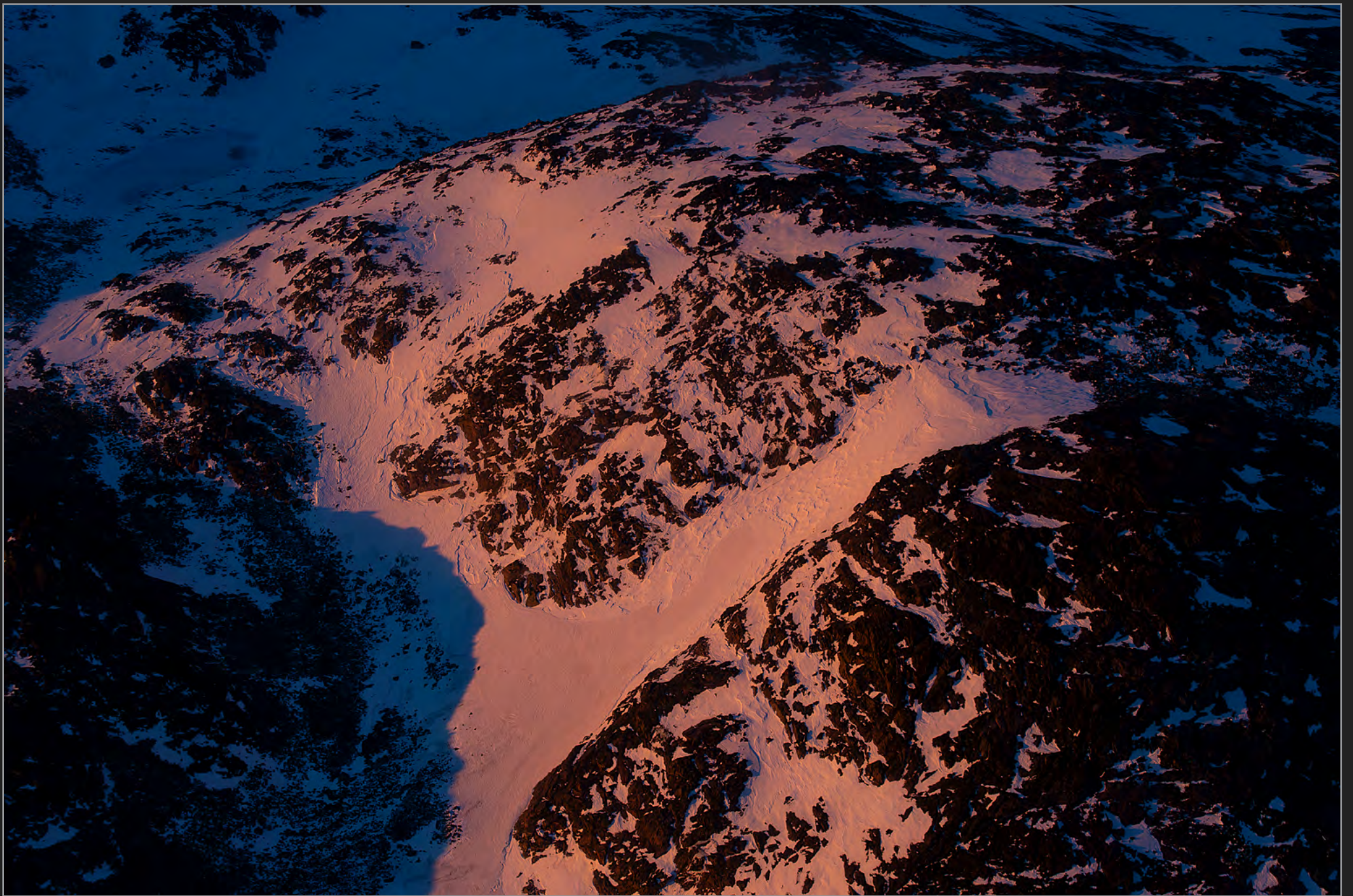
Vestgrønland, januar 2018