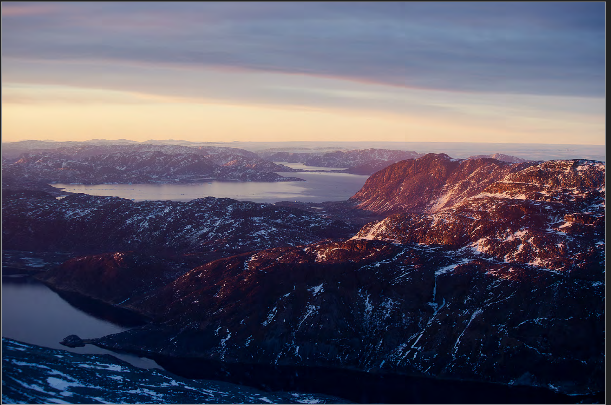
Vestgrønland, januar 2018