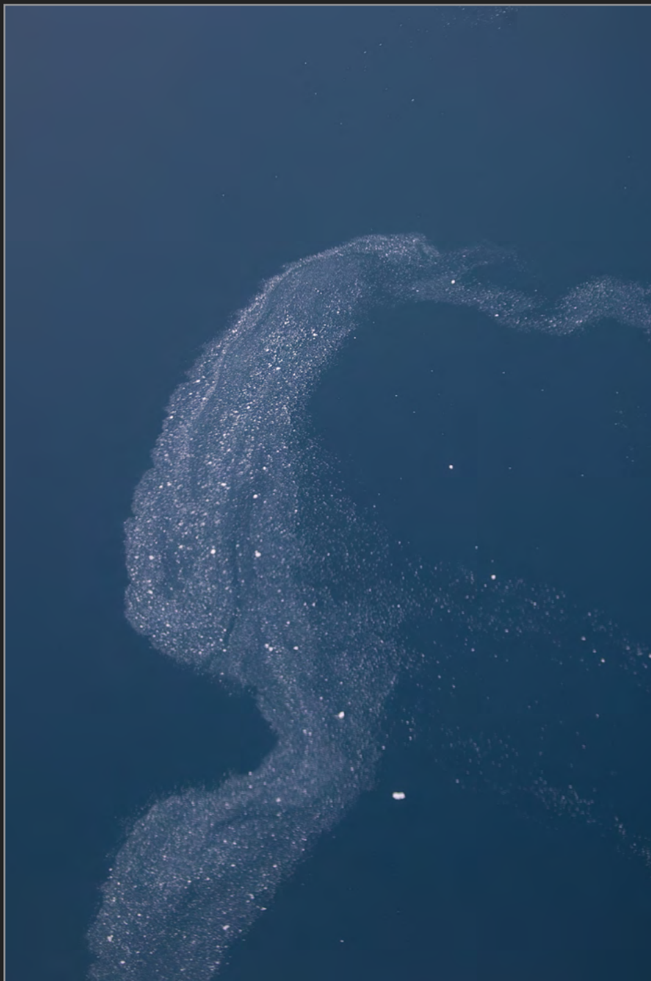
Vestgrønland, januar 2018